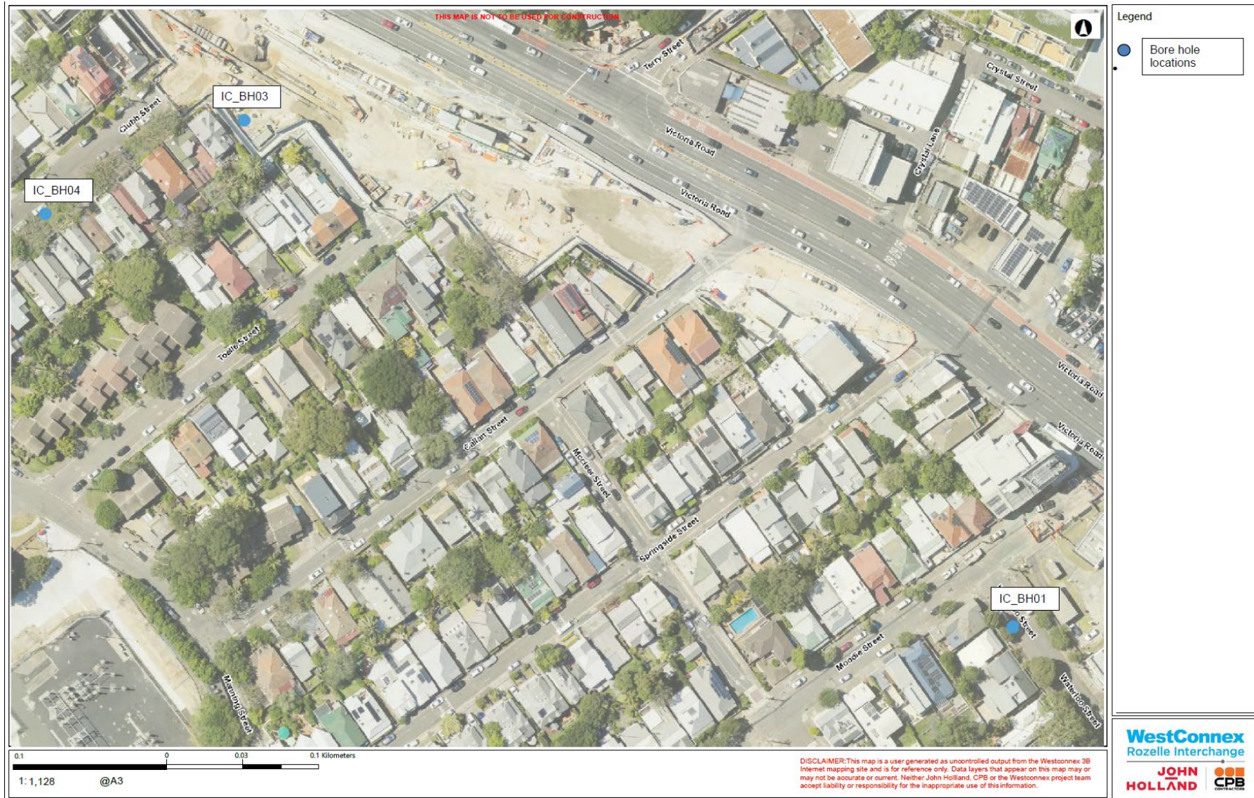
Figure 4 Construction phase groundwater monitoring network – salinity logger locations (Iron Cove)