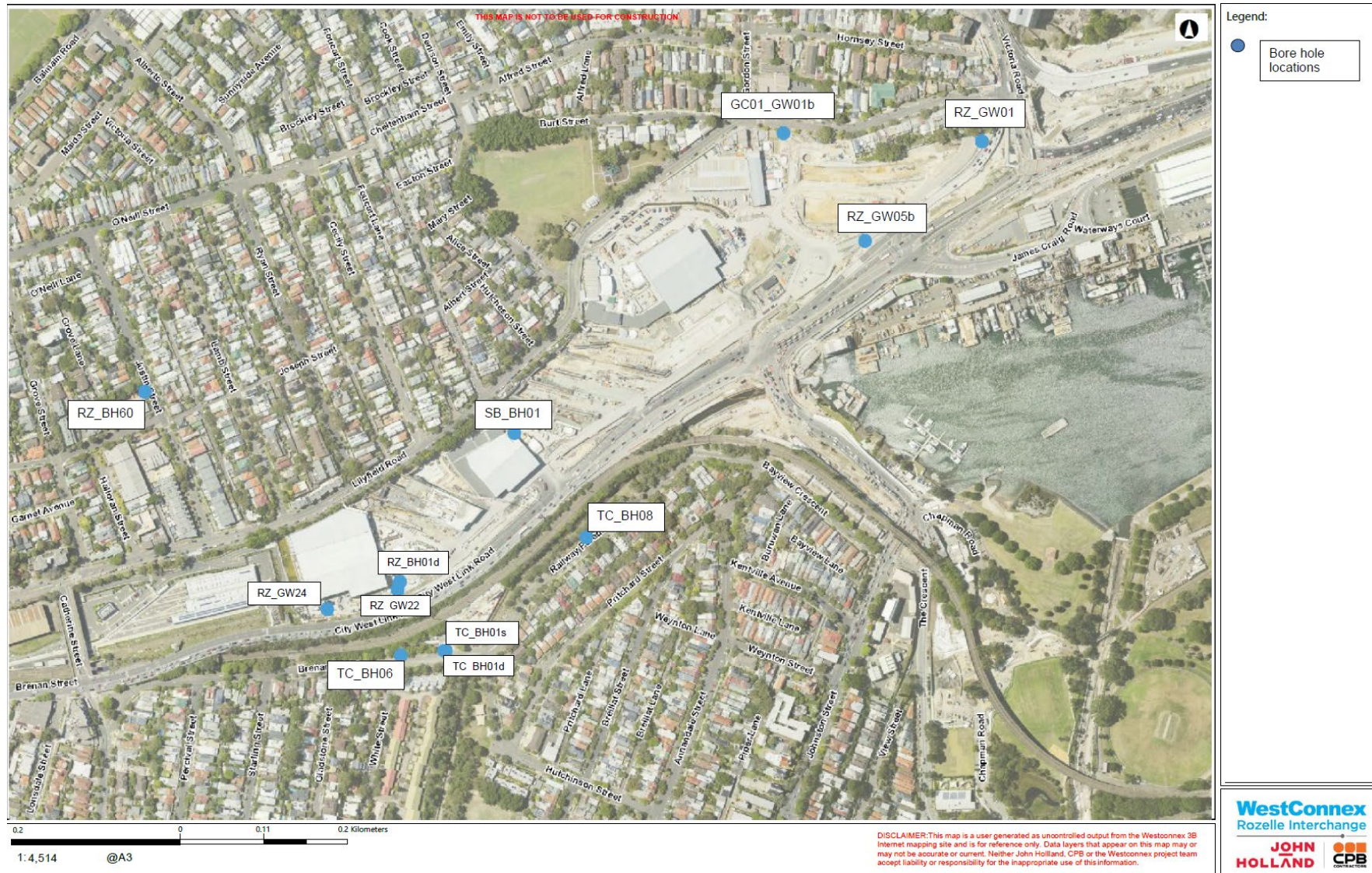
Figure 3 Construction phase groundwater monitoring network – salinity logger locations (Rozelle)