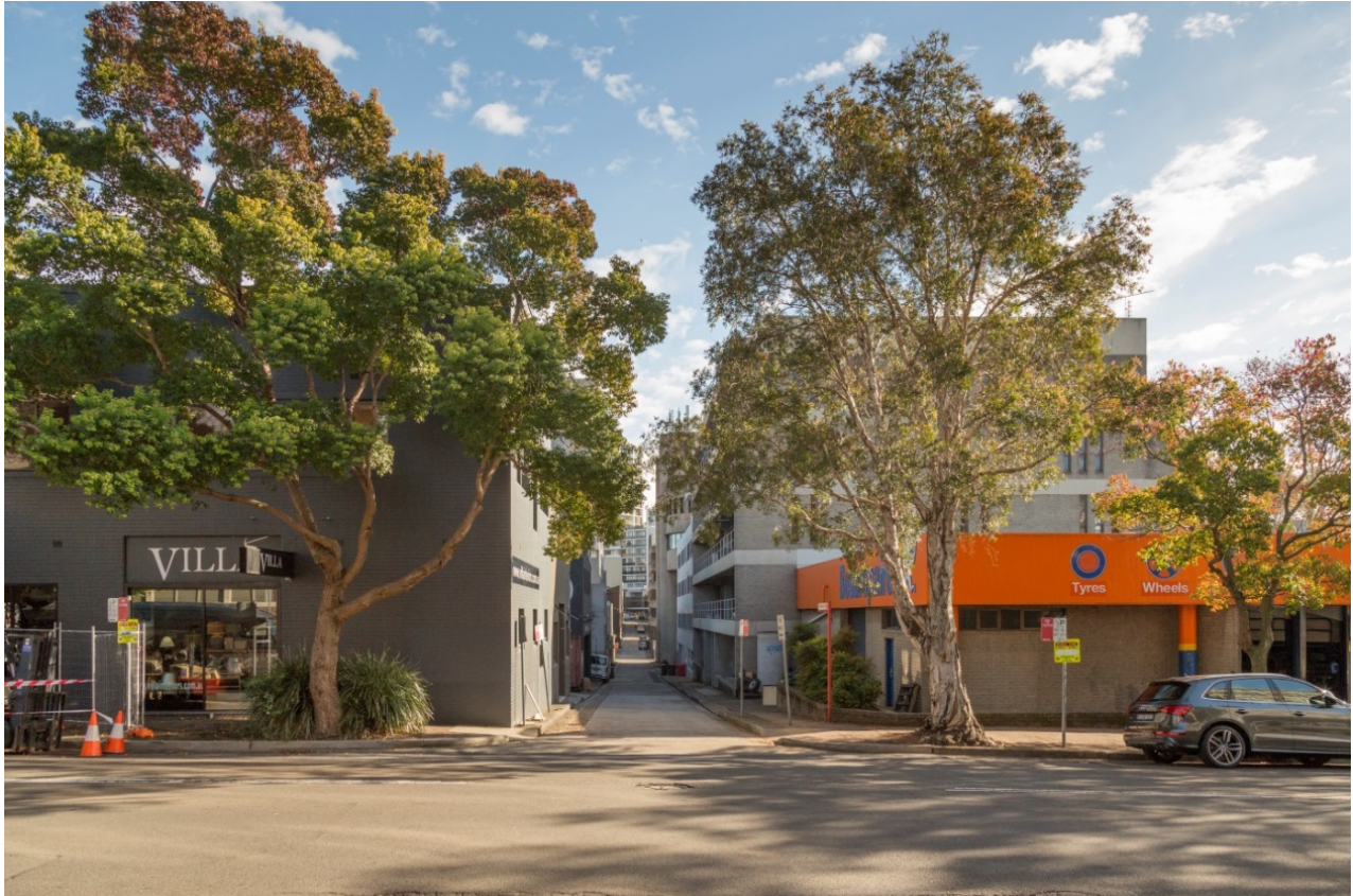
Figure 6 – Development on Site C (right) prior to demolition works commencing