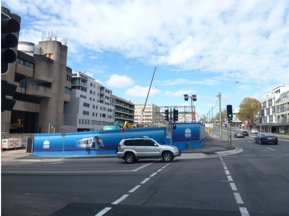
Figure 7 – Status of CSSI works on Site A as of early June 2018