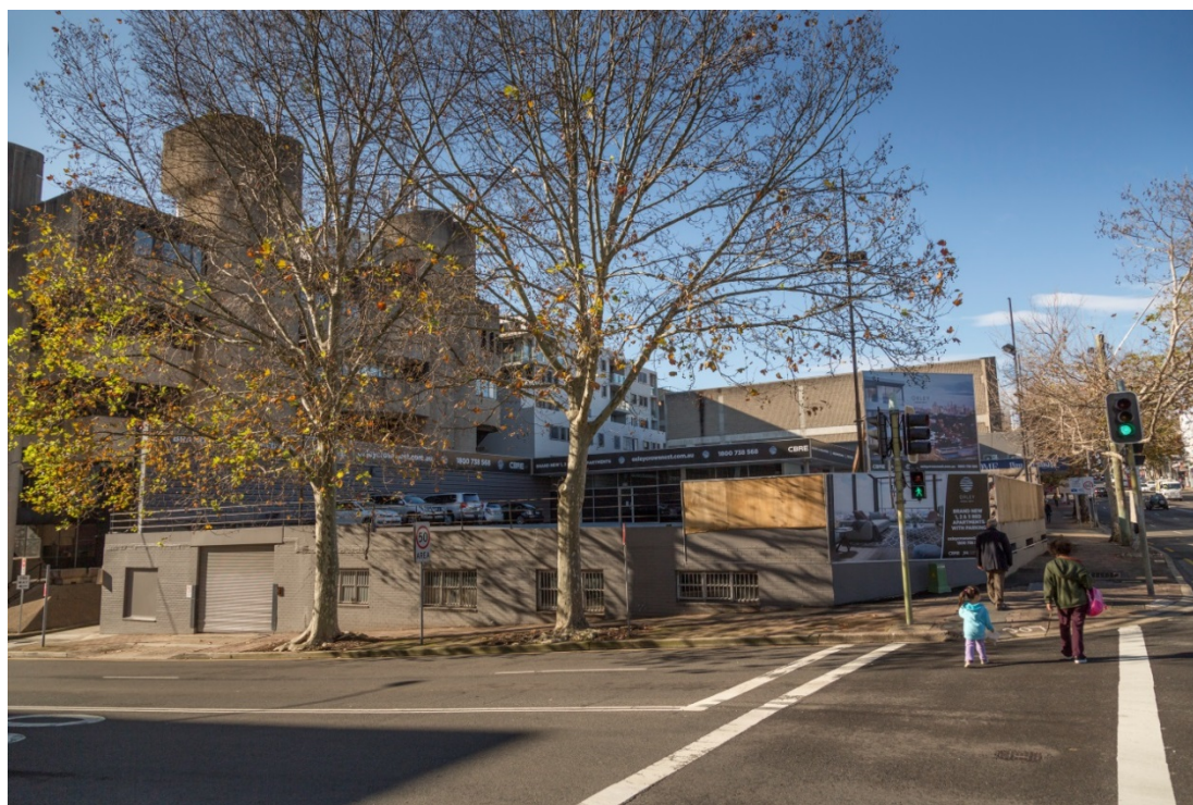
Figure 4 – Development on Site A prior to demolition works commencing

To provide a visual point of reference for this SEARs request, a series of photographs have been provided below. Photographs of the component properties of the site are provided below with Figures 4 to Figures 6 and show the former buildings on the site prior to their demolition in accordance with the CSSI Approval. Figures 7 to Figures 9 show the current status of the CSSI approved works on the site, as of early June 2018.