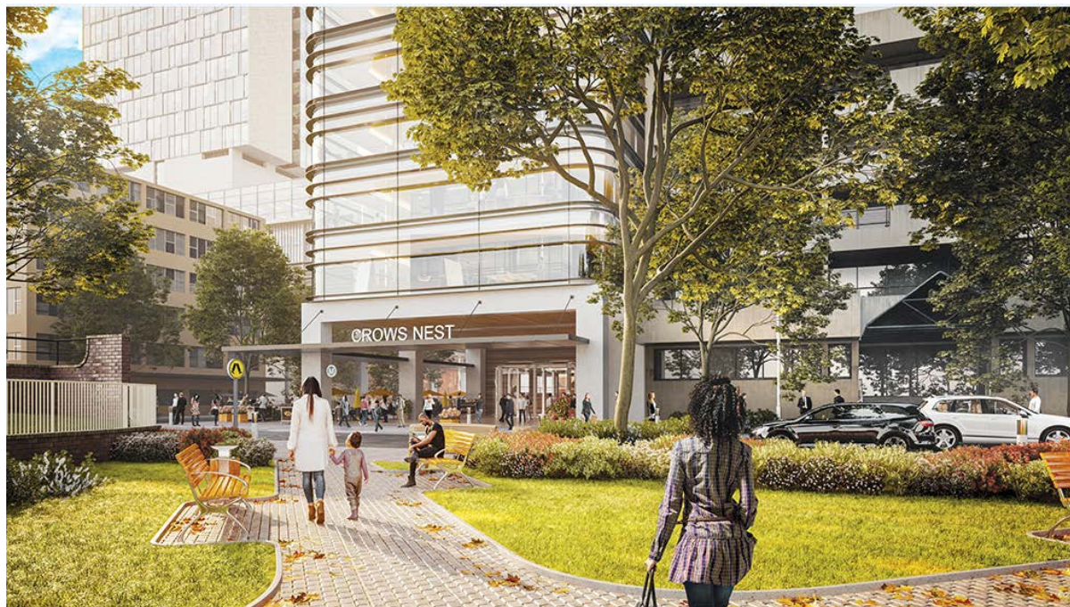
Figure 11 – Indicative building based on the proposed building envelope for Site C, viewed from Hume Street Park

A photomontage of an indicative building for Site C using the proposed building envelope is provided in Figure 11 .