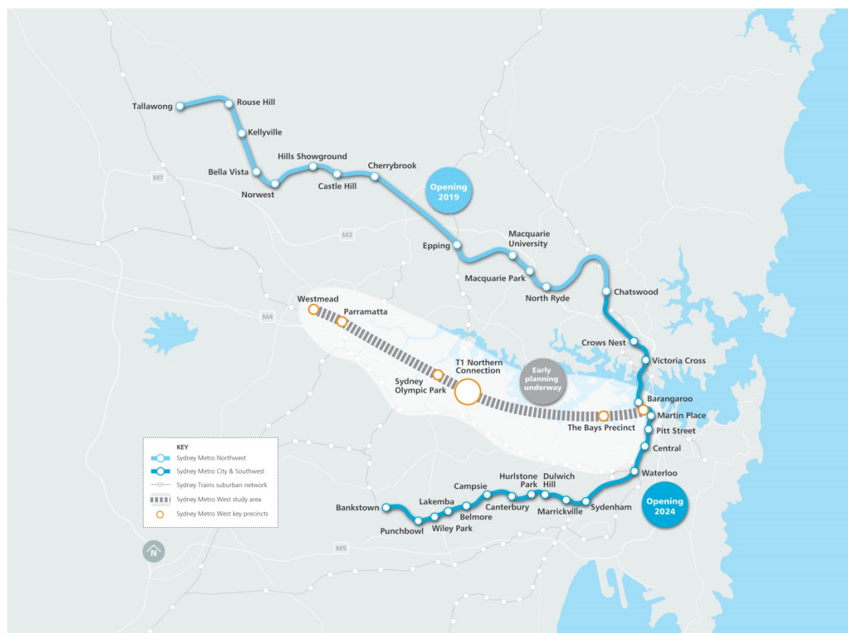
Figure 1 – Sydney Metro alignment map

alignment and we are continuing community and industry consultation to get the best outcomes for customers and communities.