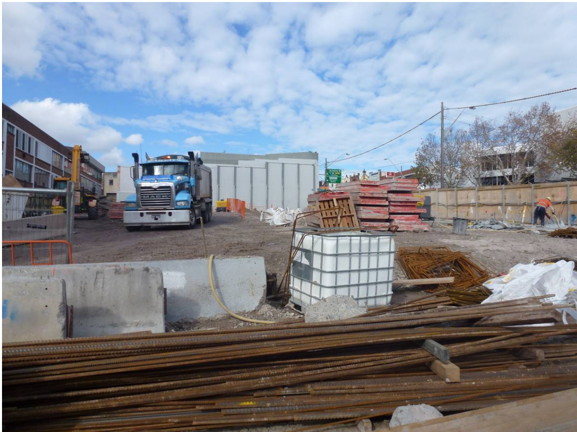
Figure 8 – Status of CSSI approved works on Site B as of early June 2018