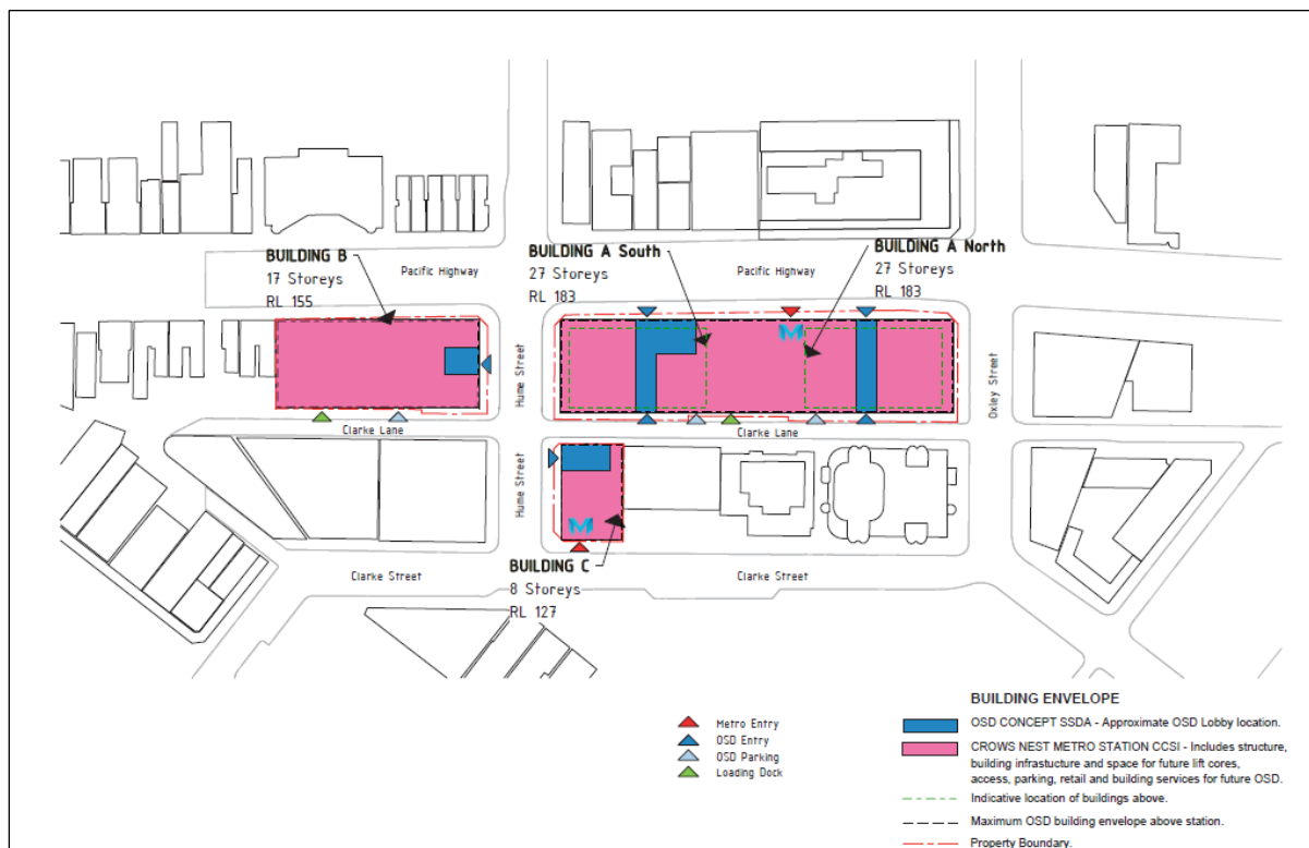
Figure 10 – Proposed location of buildings on the site

The proposed location of the building on each site is illustrated in the Location Plan provided at Figure 10 below.