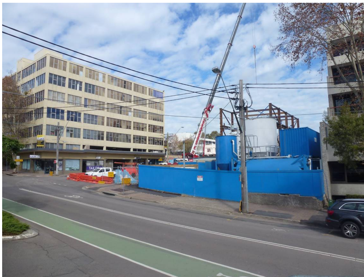
Figure 9 – Status of CSSI approval works on site C as of early June 2018