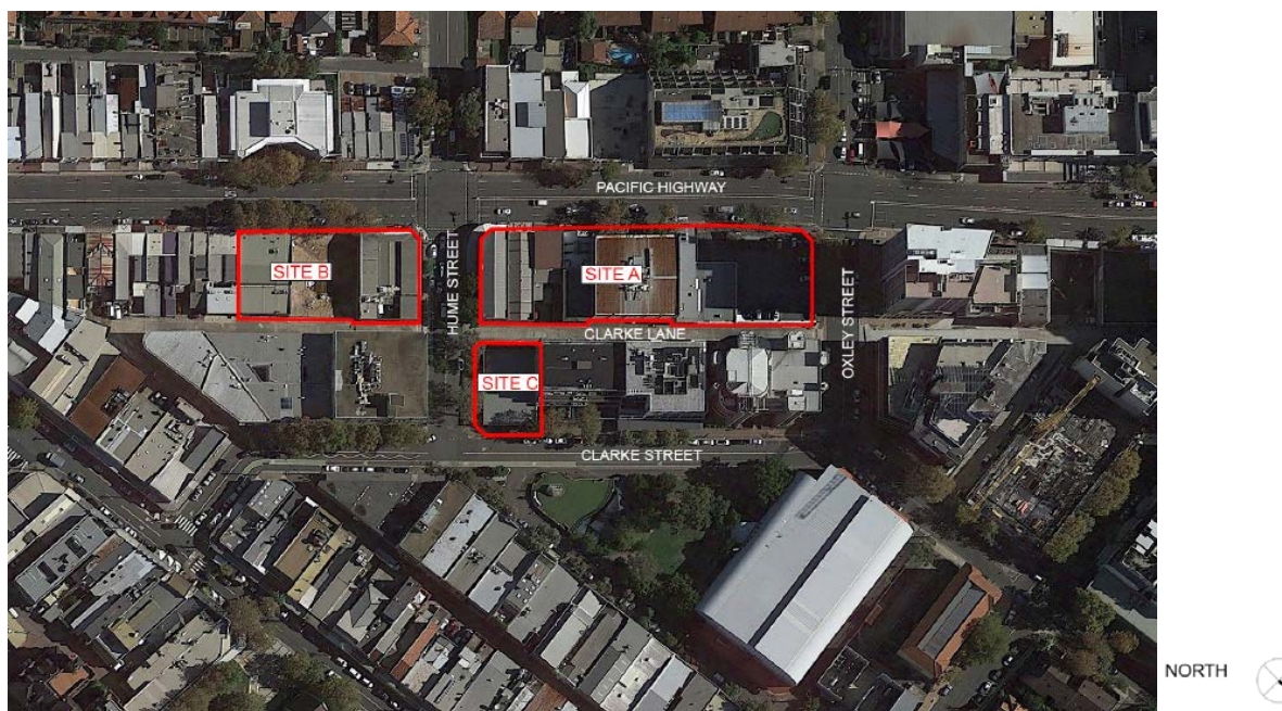
Figure 3 – Site Plan

Sites A, B and C have a combined site area of 6,356 square metres.