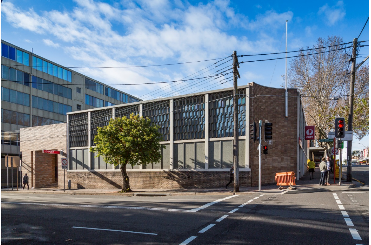
Figure 5 – Development on Site B prior to demolition works commencing