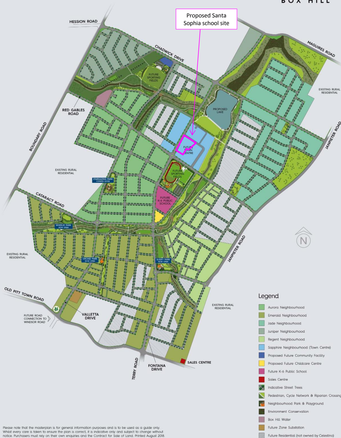
Figure 1. Location of proposed school site within The Gables Masterplan