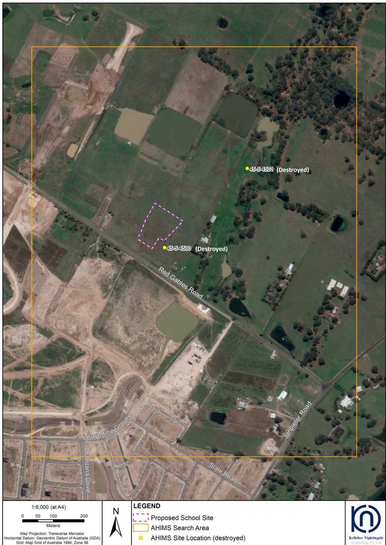
Figure 3. AHIMS search results