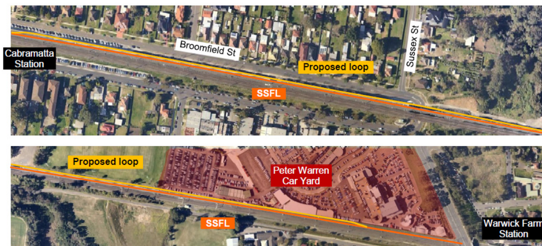
Figure 2 Cabramatta Loop Project Overview (ARTC, 2015)

The proposed project involves constructing a new 1,300m crossing loop between Cabramatta (32.200km) and Warwick Farm (33.750km) on the down side of the existing SSFL line. The existing SSFL requires slewing towards the Sydney Trains tracks for approximately 600m to reduce property impacts to Peter Warren Card Yard.