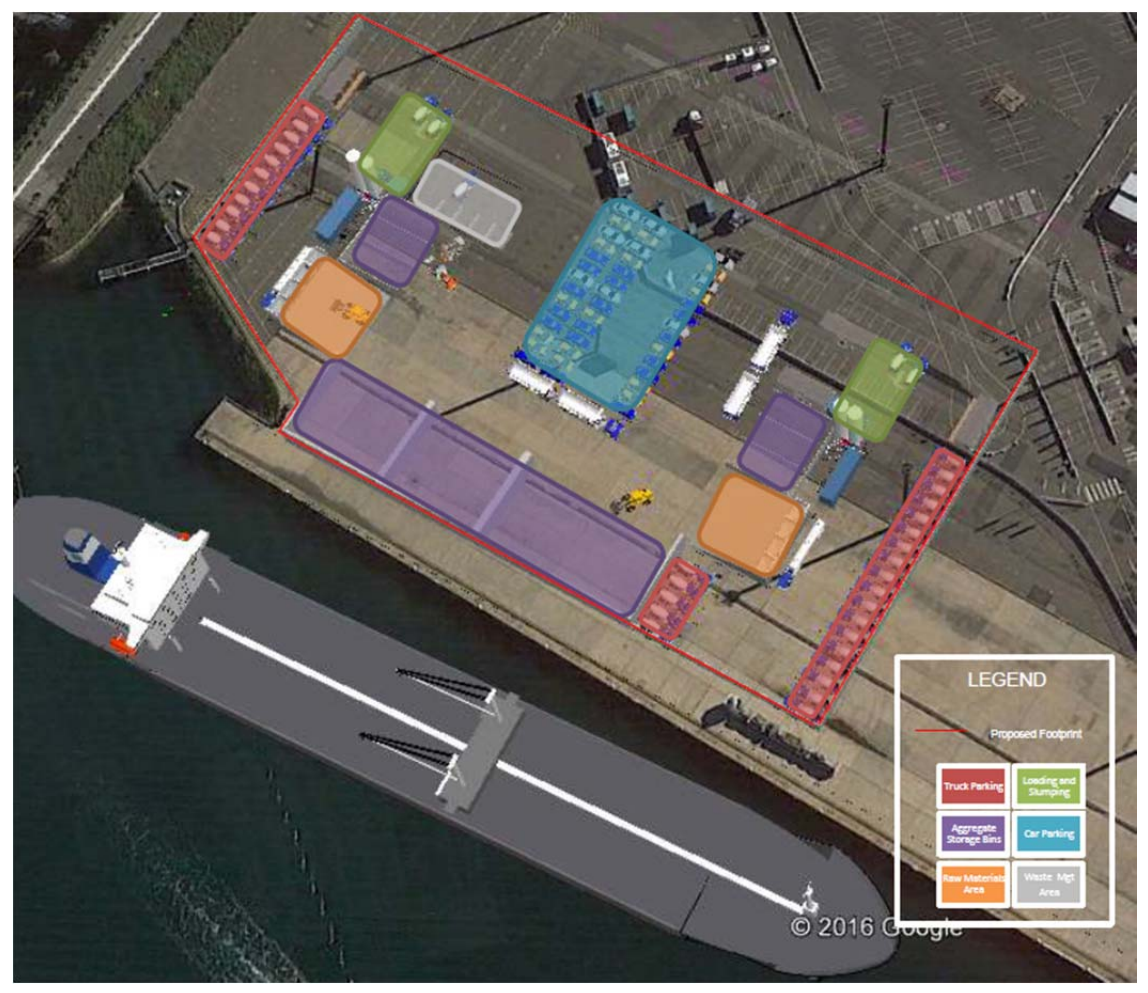
Figure 2 – Indicative features and components of proposed concrete batching plant