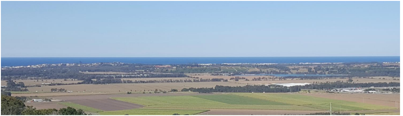
View across the site from the West