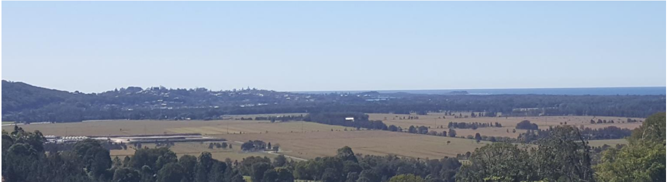
View across the site from the South