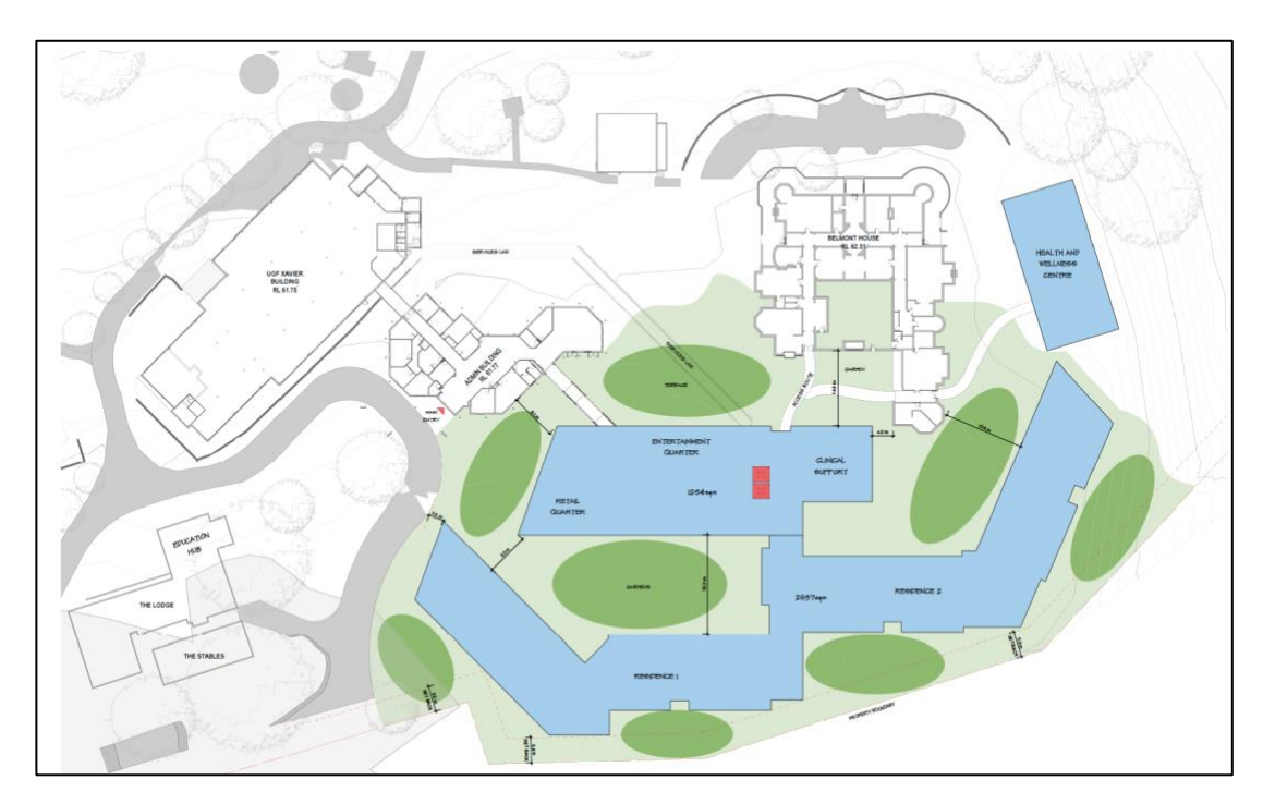
Figure 3: Proposed ground floor plan