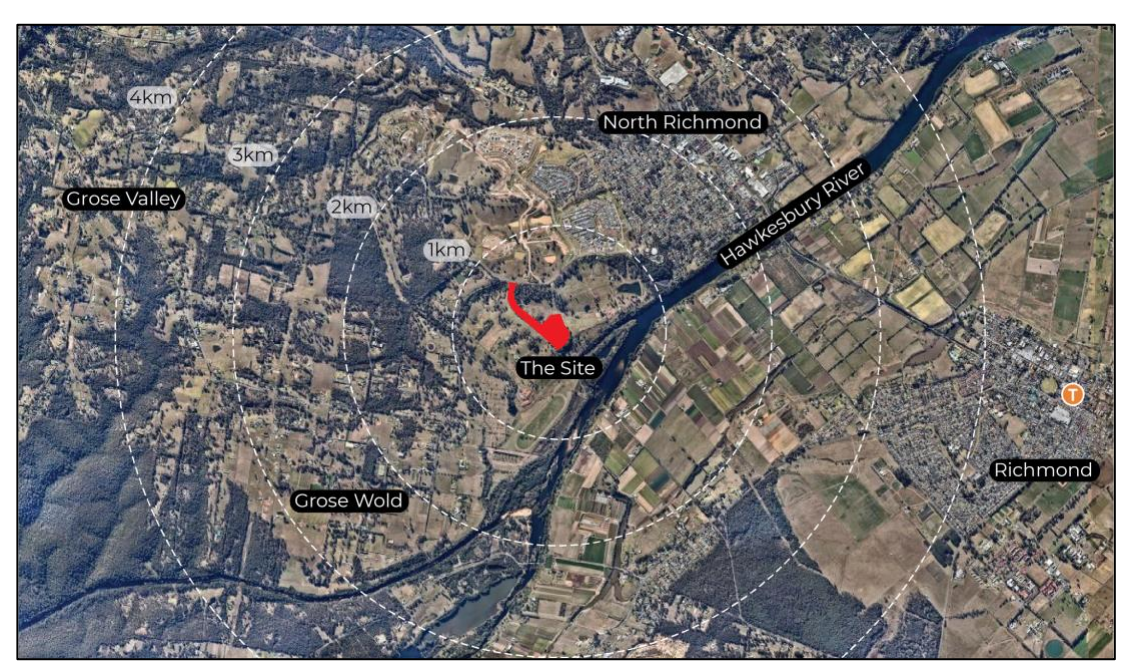
Figure 2: Context map

A summary description of the site is provided in Table 1 .