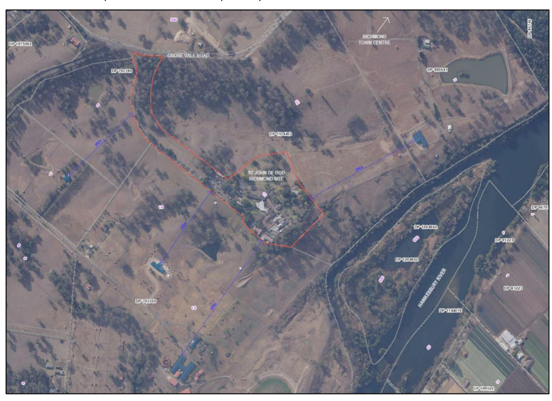
Figure 1: Site aerial map

A site aerial map and context map are provided below.