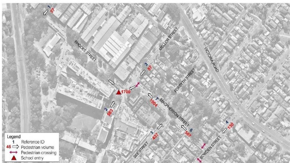
Figure 1.23: Projected Student and Parent/ Caregiver Pedestrian Volumes – Moderate Scenario

It should be noted that the significant pedestrian demand reflected within the applicant's School Transport Plan (see extract of Figure 1.23 of the Plan below for reference) would suggest that a pedestrian crossing on See Street at Macpherson Street is warranted.