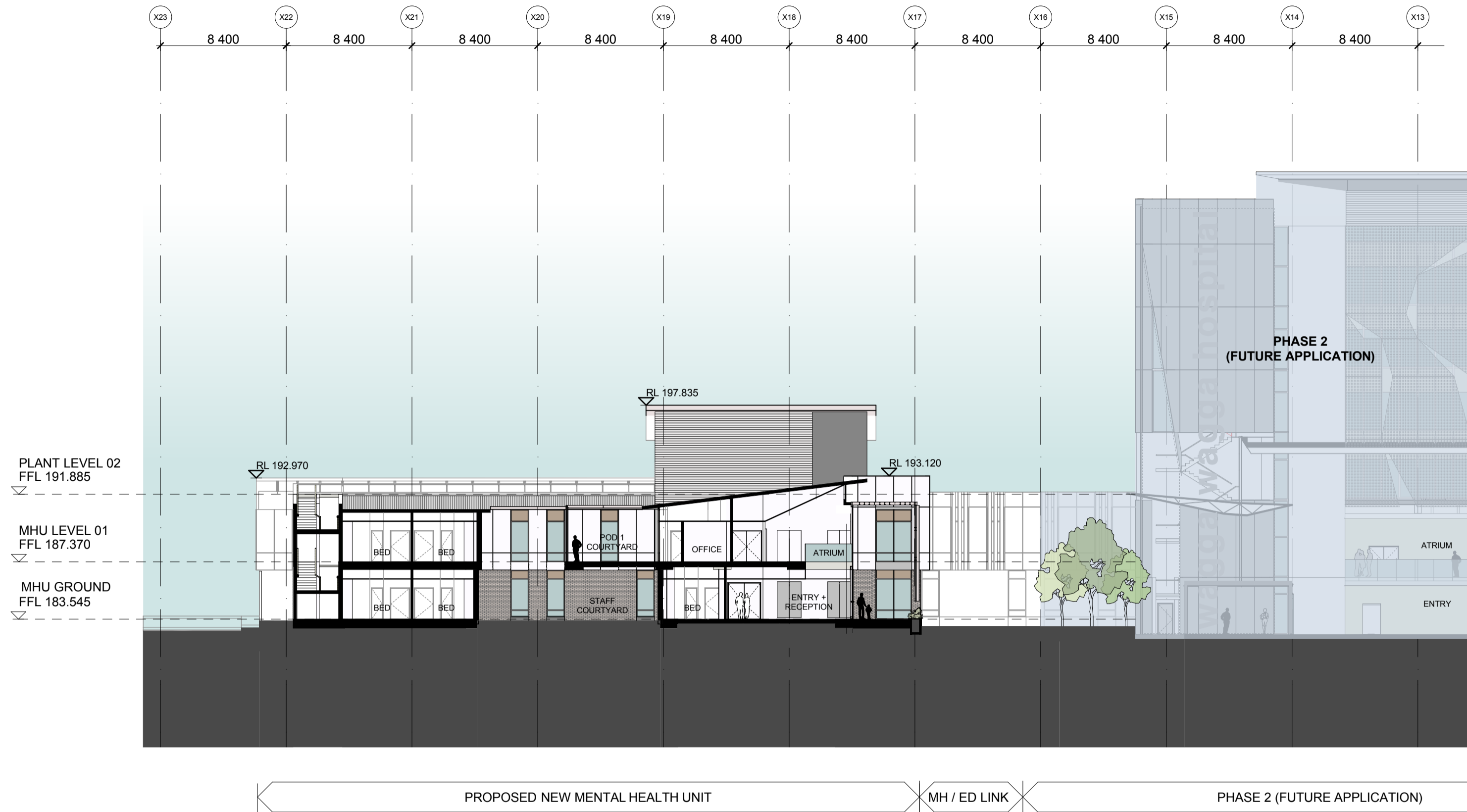
1 SECTION EAST WEST SECTION 1:250 @A1