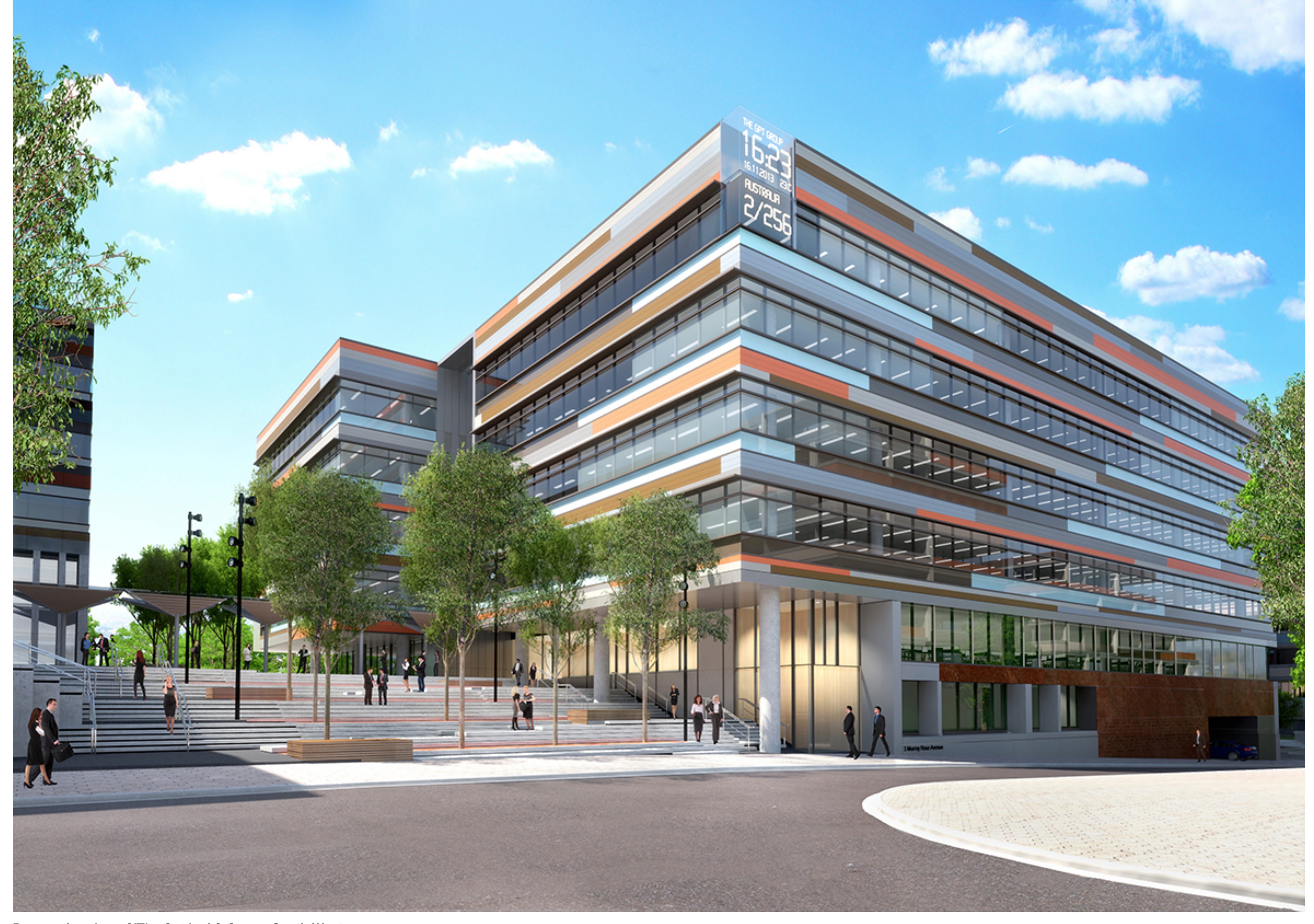
Perspective view of 'The Cutting' & Corner South-West

THIS DRAWING IS COPYRIGHT © AND SHALL REMAIN THE PROPERTY OF TURNER + ASSOCIATES ARCHITECTS. NO REPRODUCTION WITHOUT PERMISSION. UNLESS NOTED OTHERWISE THIS DRAWING IS NOT FOR CONSTRUCTION. DO NOT SCALE FROM DRAWINGS, FIGURED DIMENSIONS SHALL TAKE PRECEDENCE.