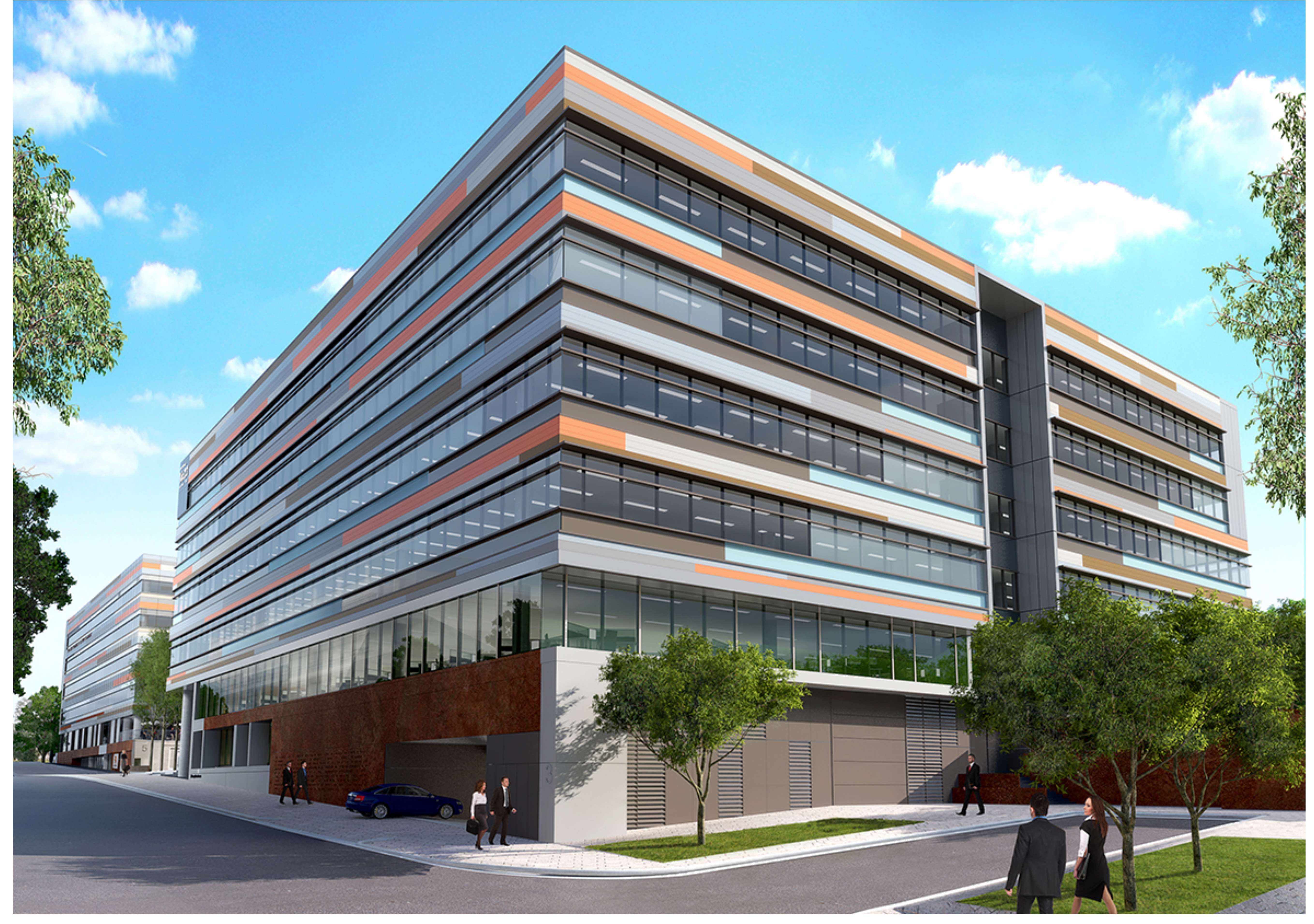
Perspective view of South-East Corner

THIS DRAWING IS COPYRIGHT © AND SHALL REMAIN THE PROPERTY OF TURNER + ASSOCIATES ARCHITECTS. NO REPRODUCTION WITHOUT PERMISSION. UNLESS NOTED OTHERWISE THIS DRAWING IS NOT FOR CONSTRUCTION. DO NOT SCALE FROM DRAWINGS, FIGURED DIMENSIONS SHALL TAKE PRECEDENCE.