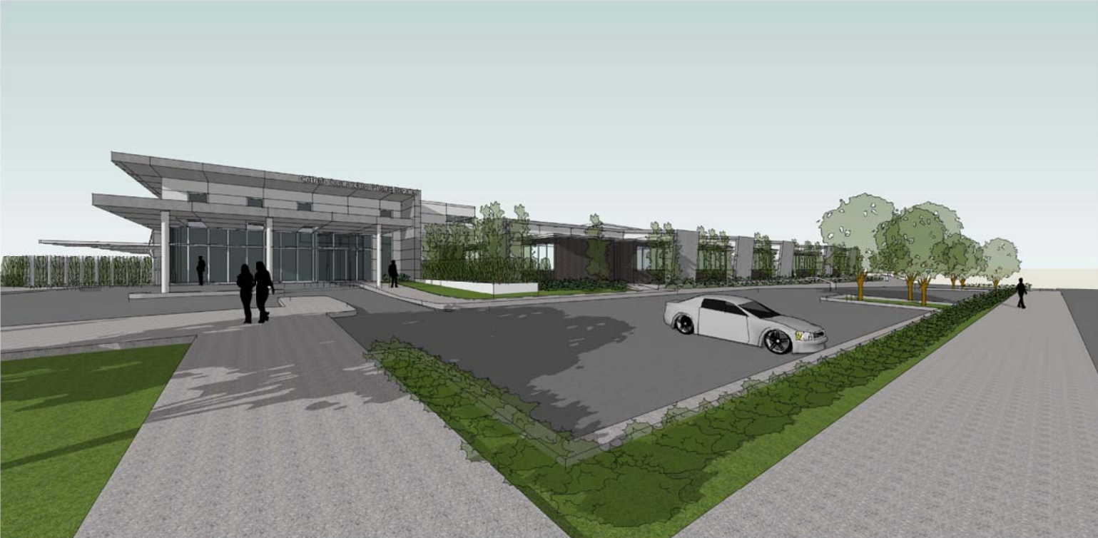
MAIN ENTRANCE VIEWED FROM ANIMOO AVENUE