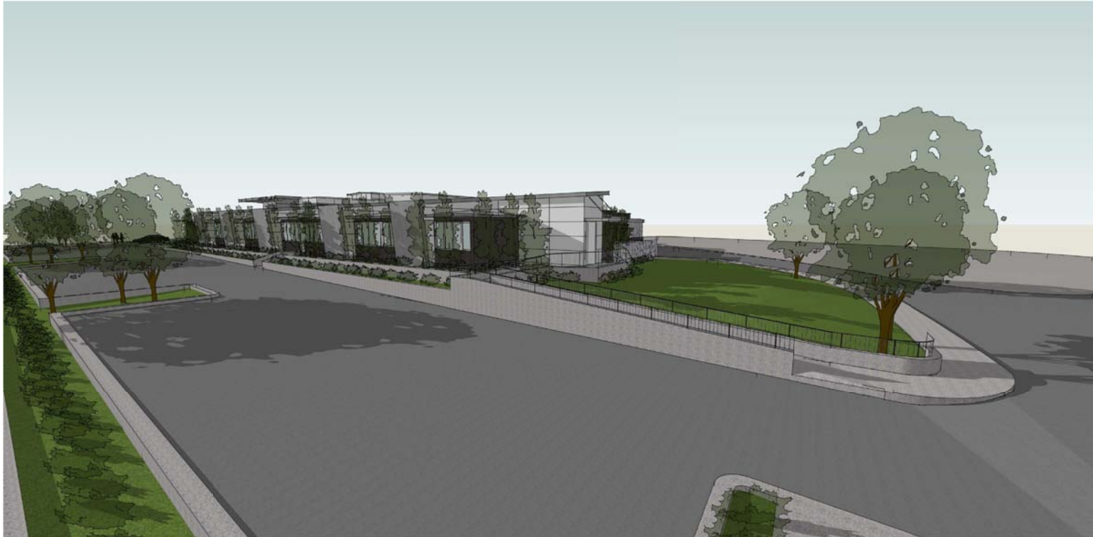
INPATIENT CLUSTER VIEWED FROM ANIMOO AVENUE