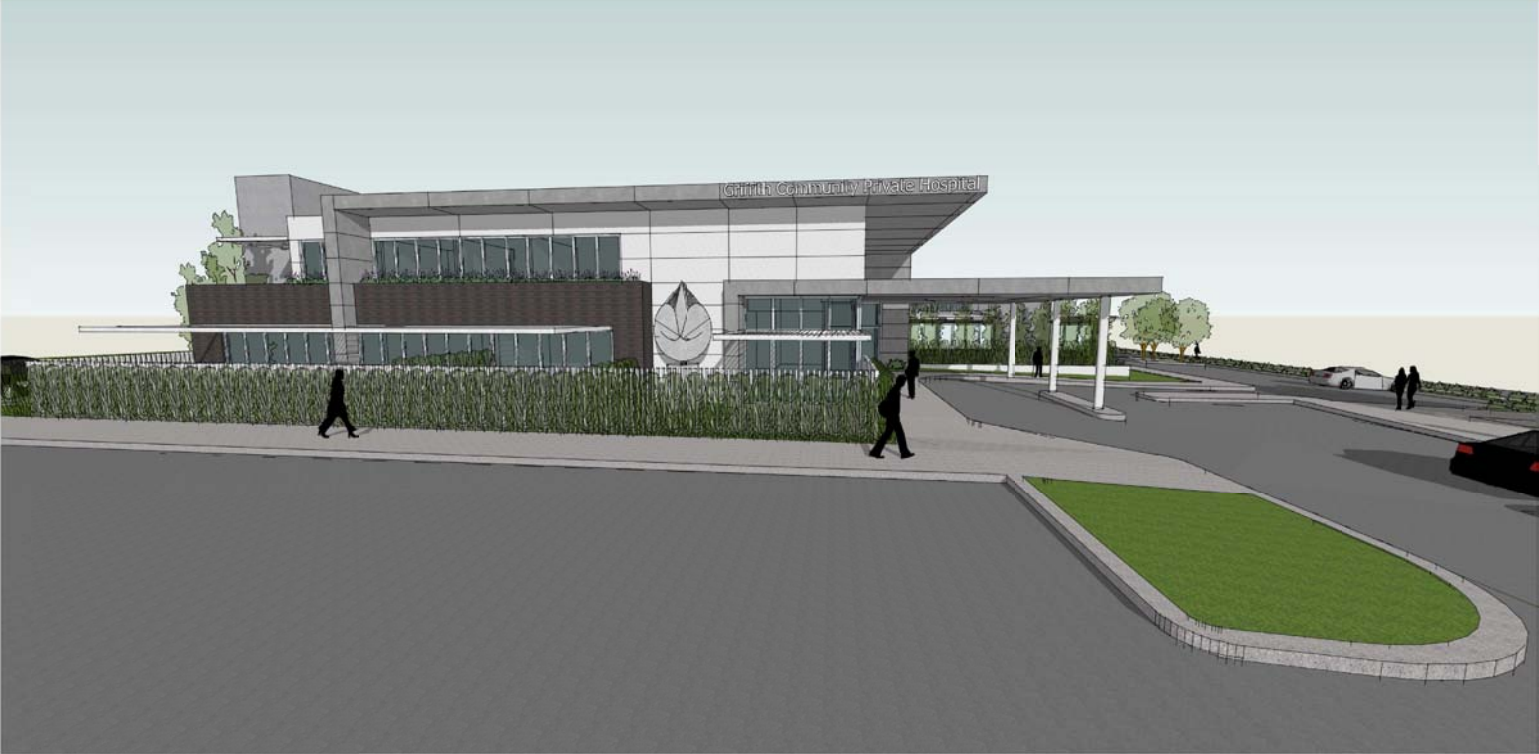
ADMIN/AMBULATORY CLUSTER VIEWED FROM WARRAMBOOL ST.