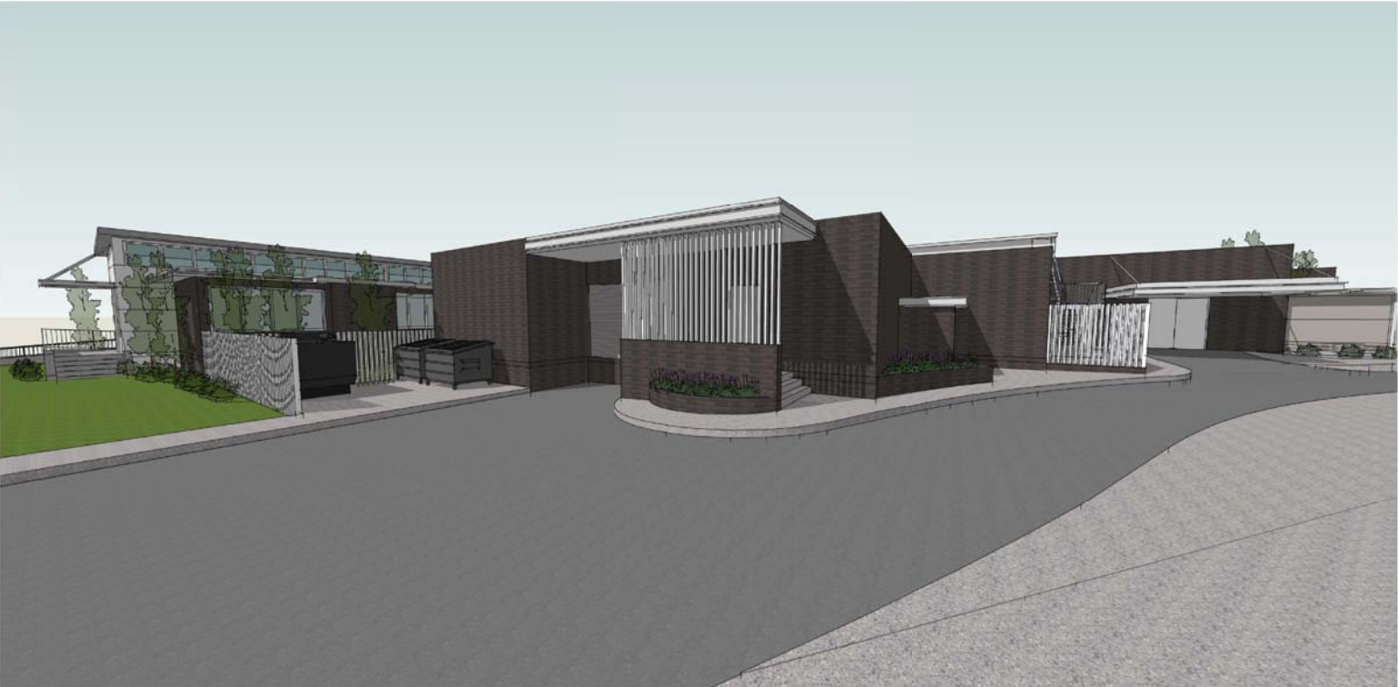
INPATIENT & SUPPORT CLUSTERS WESTERN VIEW