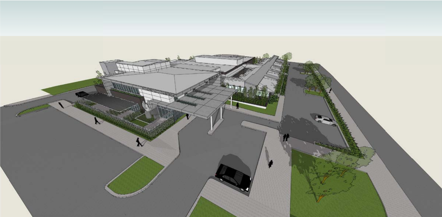
MAIN ENTRY BUILDING BIRDSEYE VIEW