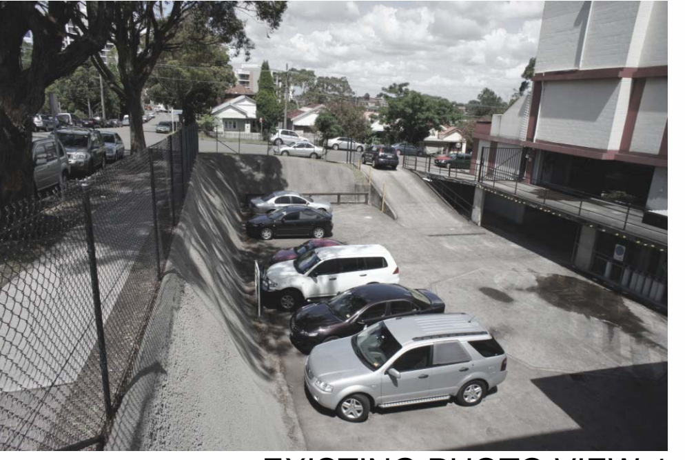
EXISTING PHOTO VIEW 4