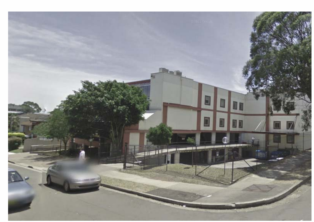
EXISTING PHOTO VIEW 1