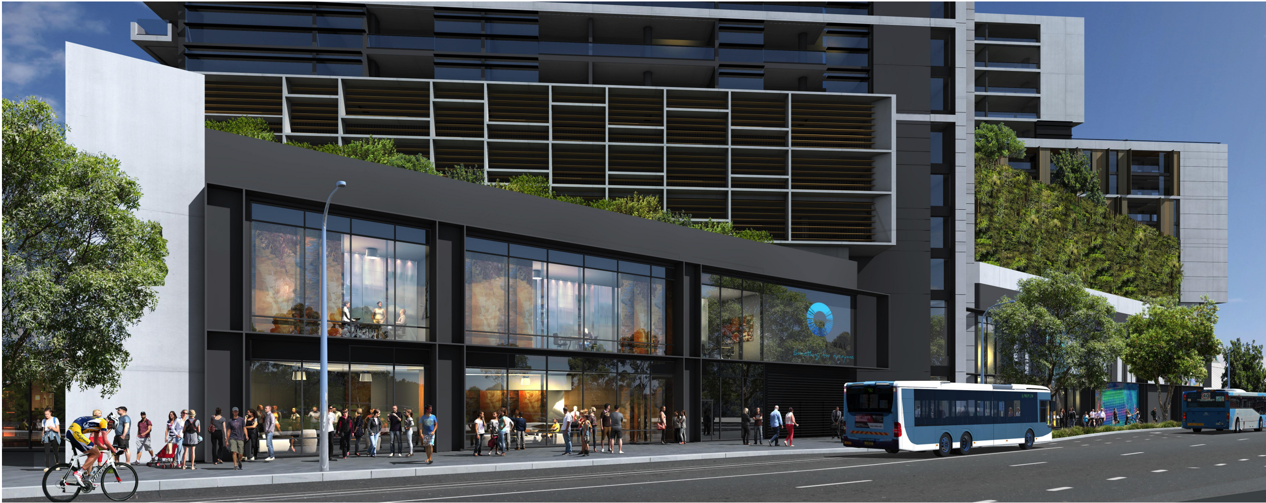
DETAIL VIEW LOOKING TOWARD RETAIL CENTRE FROM CAPTAIN COOK DRIVE, WITH PODIUM OF BUILDING A ABOVE AND BUILDING B BEYOND.