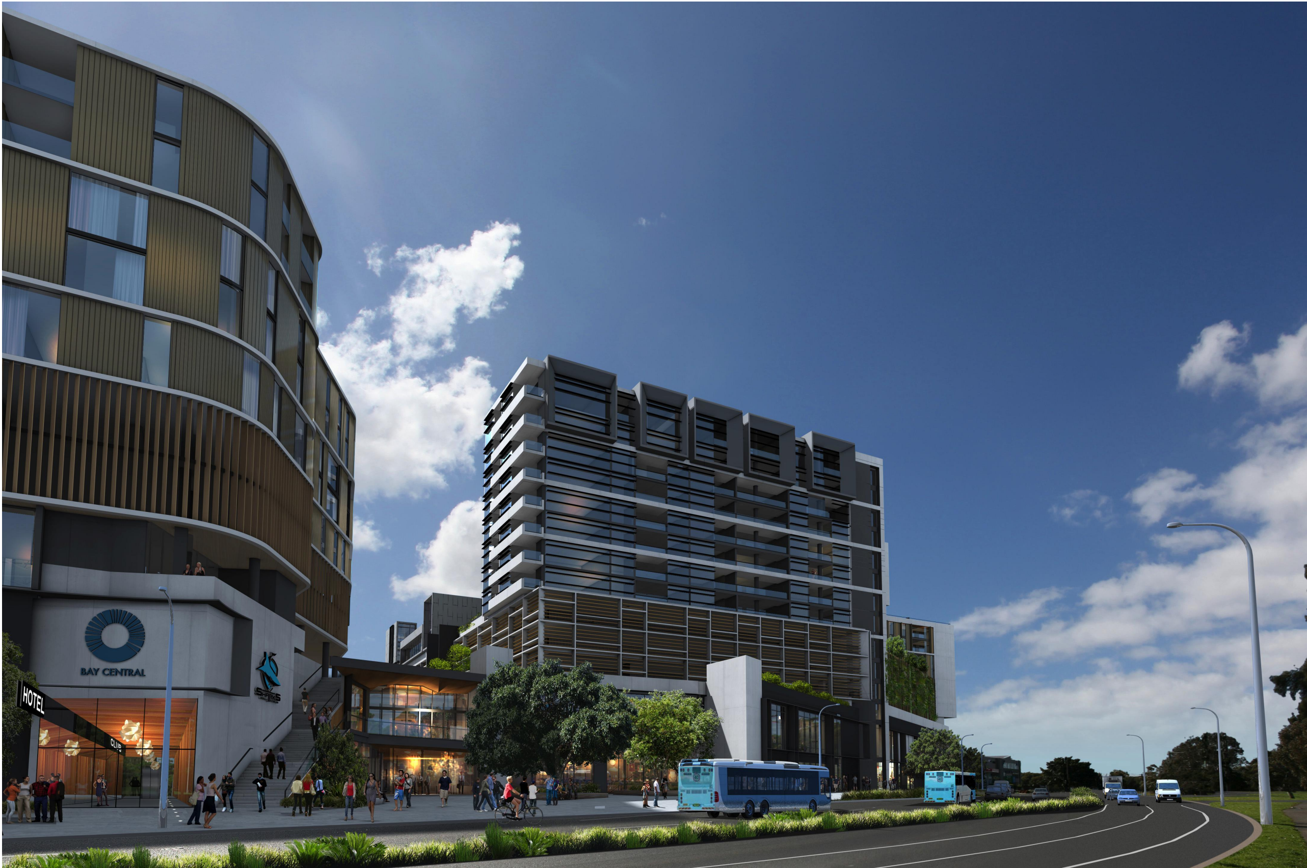
VIEW LOOKING EAST ALONG CAPTAIN COOK DRIVE, WITH THE PROPOSED HOTEL AND BUILDING A BEYOND.

NOTES THIS DRAWING IS THE COPYRIGHT © OF TURNER. NO REPRODUCTION WITHOUT PERMISSION. UNLESS NOTED OTHERWISE THIS DRAWING IS NOT FOR CONSTRUCTION. ALL DIMENSIONS AND LEVELS ARE TO BE CHECKED ON SITE PRIOR TO THE COMMENCEMENT OF WORK. BEFORE TURNER OF ANY DISCREPANCIES FOR CLARIFICATION BEFORE PROCEEDING WITH WORK. CHANGES ARE NOT TO BE SCALED. USE ONLY PLOTTED DRAWINGS. REFER TO CONSULTANT DOCUMENTATION FOR FURTHER INFORMATION. DWG, PC AND BAA FILES ARE UNCONTROLLED DOCUMENTS AND ARE ISSUED FOR INFORMATION ONLY.