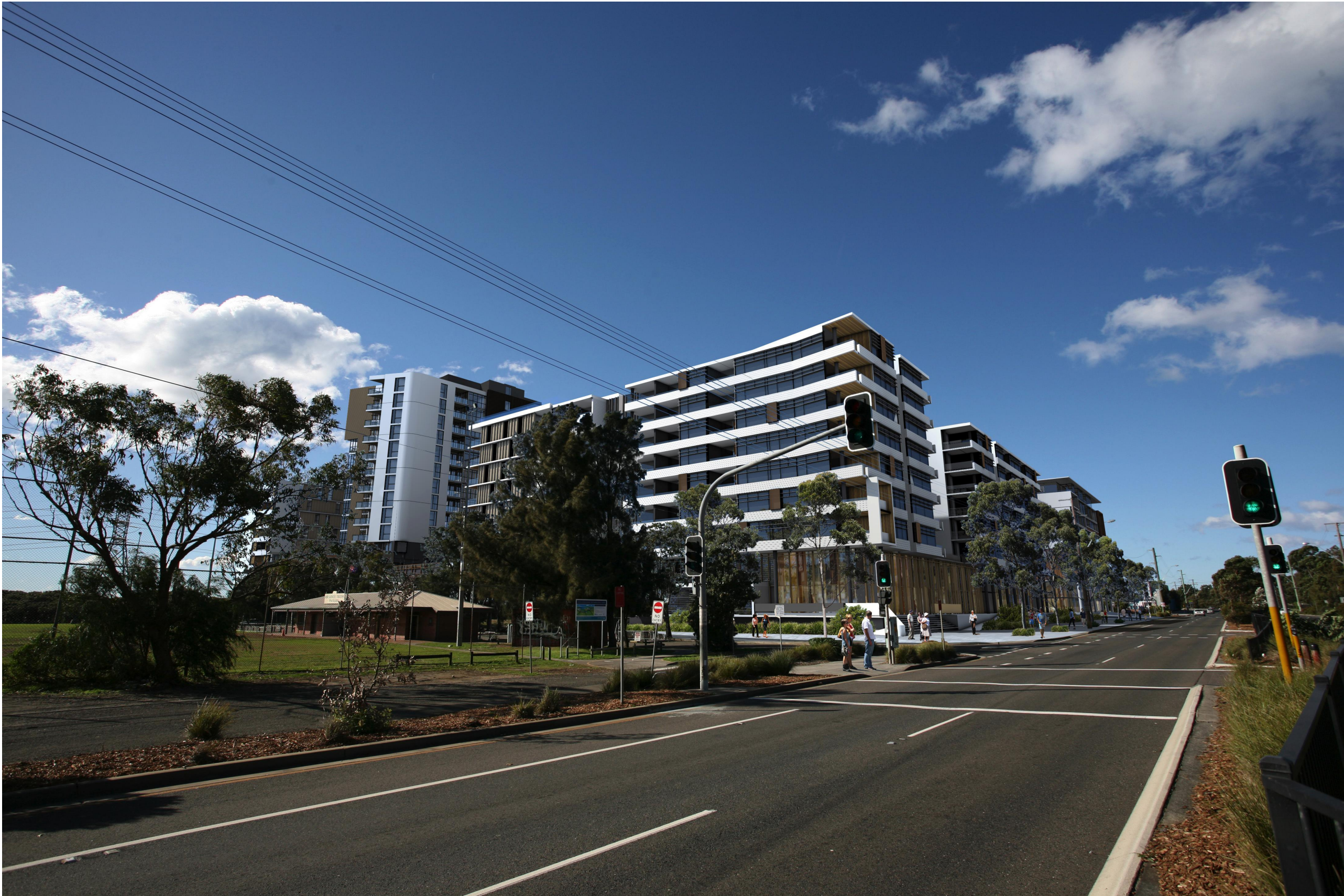
VIEW LOOKING EAST ALONG CAPTAIN COOK DRIVE WITH STAGE 1 IN THE FOREGROUND.

NOTES THIS DRAWING IS THE COPYRIGHT © OF TURNER. NO REPRODUCTION WITHOUT PERMISSION. UNLESS NOTED OTHERWISE THIS DRAWING IS NOT FOR CONSTRUCTION. ALL DIMENSIONS AND LEVELS ARE TO BE CHECKED ON SITE PRIOR TO THE COMMENCEMENT OF WORK. BEFORE TURNER OF ANY DISCREPANCIES FOR CLARIFICATION BEFORE PROCEEDING WITH WORK. CHANGES ARE NOT TO BE SCALED. USE ONLY PLOTTED DRAWINGS. REFER TO CORRESPONDING DOCUMENTATION FOR FURTHER INFORMATION. DWG, PC AND BAA FILES ARE UNCONTROLLED DOCUMENTS AND ARE ISSUED FOR INFORMATION ONLY.