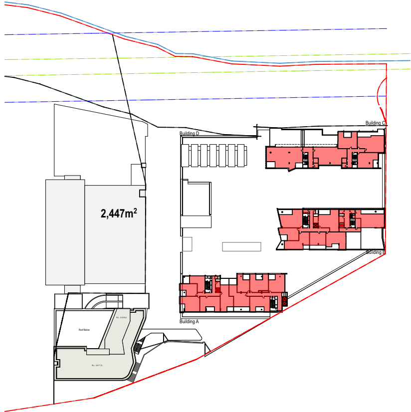
01 GFA Diagram Level 11 1:1000