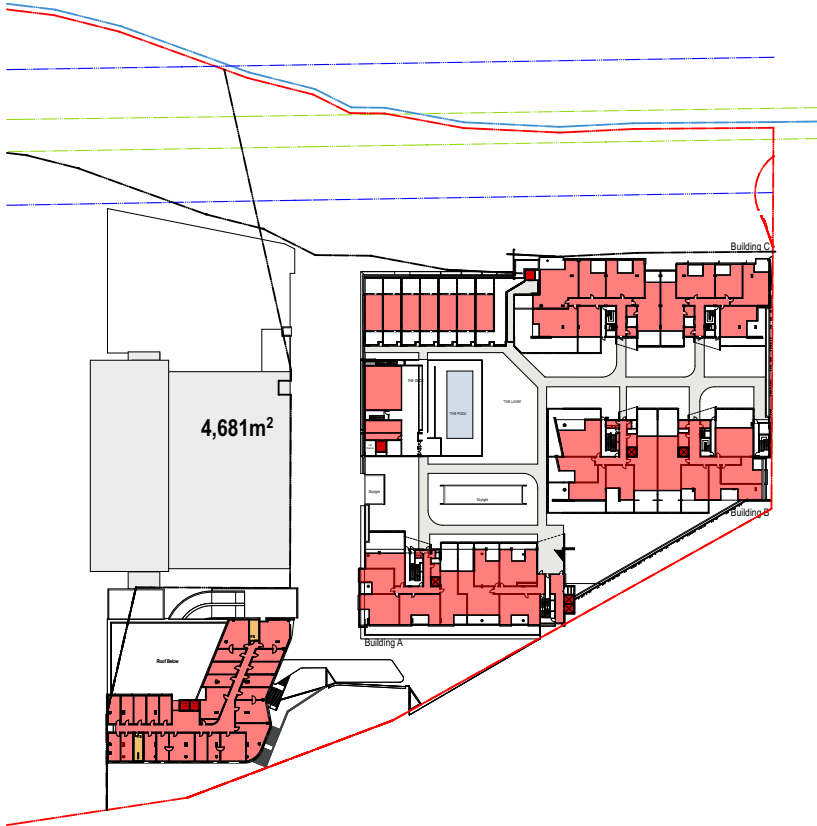
03 GFA Diagram Level 7 1:1000