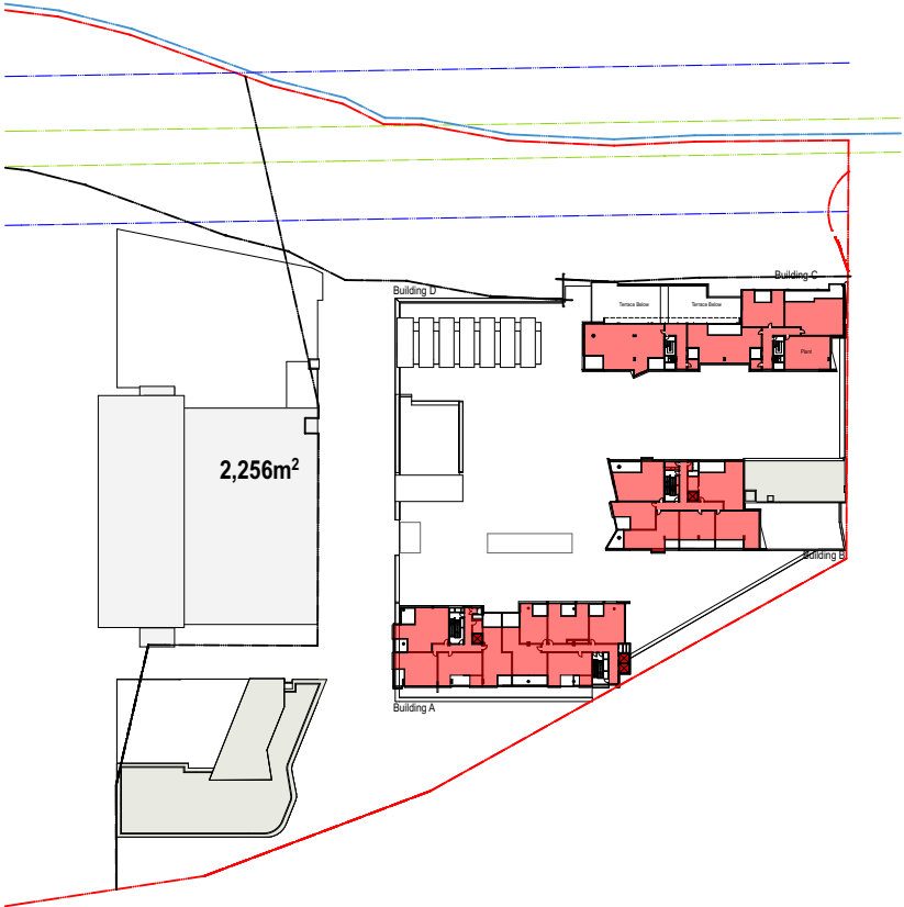
02 GFA Diagram Level 12 1:1000