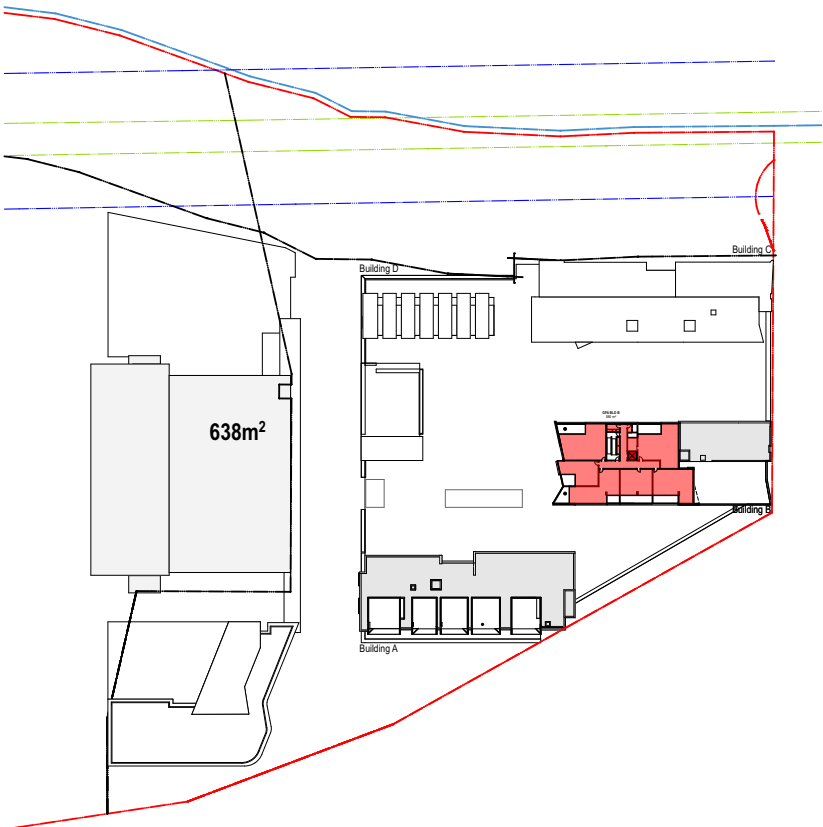
05 GFA Diagram Level 15 1:1000

NOTES THIS DRAWING IS THE COPYRIGHT © OF TURNER. NO REPRODUCTION WITHOUT PERMISSION. UNLESS NOTED OTHERWISE THIS DRAWING IS NOT FOR CONSTRUCTION. ALL DIMENSIONS AND LEVELS ARE TO BE CHECKED ON SITE PRIOR TO THE COMMENCEMENT OF WORK. REPORT TURNER OF ANY DISCREPANCIES FOR CLARIFICATION BEFORE PROCEEDING WITH WORK. CHANGES ARE NOT TO BE SCALED. USE ONLY PLOTTED DIMENSIONS. REFER TO CONSULTANT DOCUMENTATION FOR FURTHER INFORMATION. DWG, PC AND BAA FILES ARE UNCONTROLLED DOCUMENTS AND ARE ISSUED FOR INFORMATION ONLY.