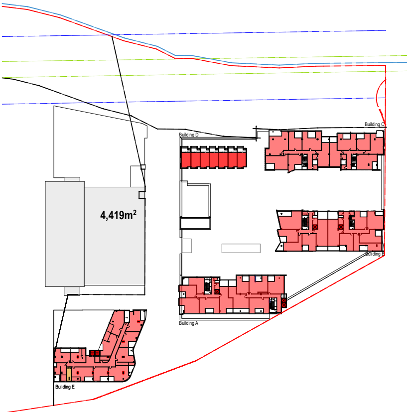
05 GFA Diagram Level 9 1:1000