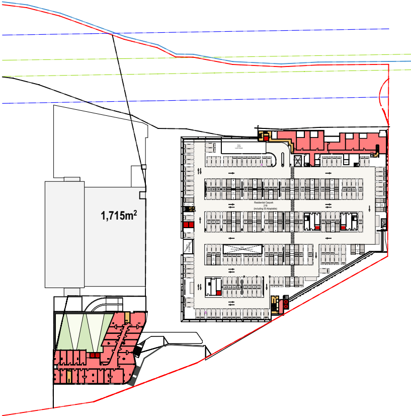
02 GFA Diagram Level 6 1:1000