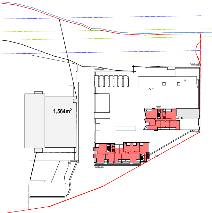
04 GFA Diagram Level 14 1:1000