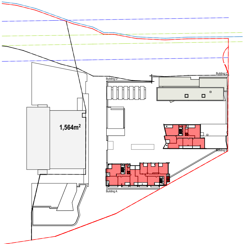
03 GFA Diagram Level 13 1:1000