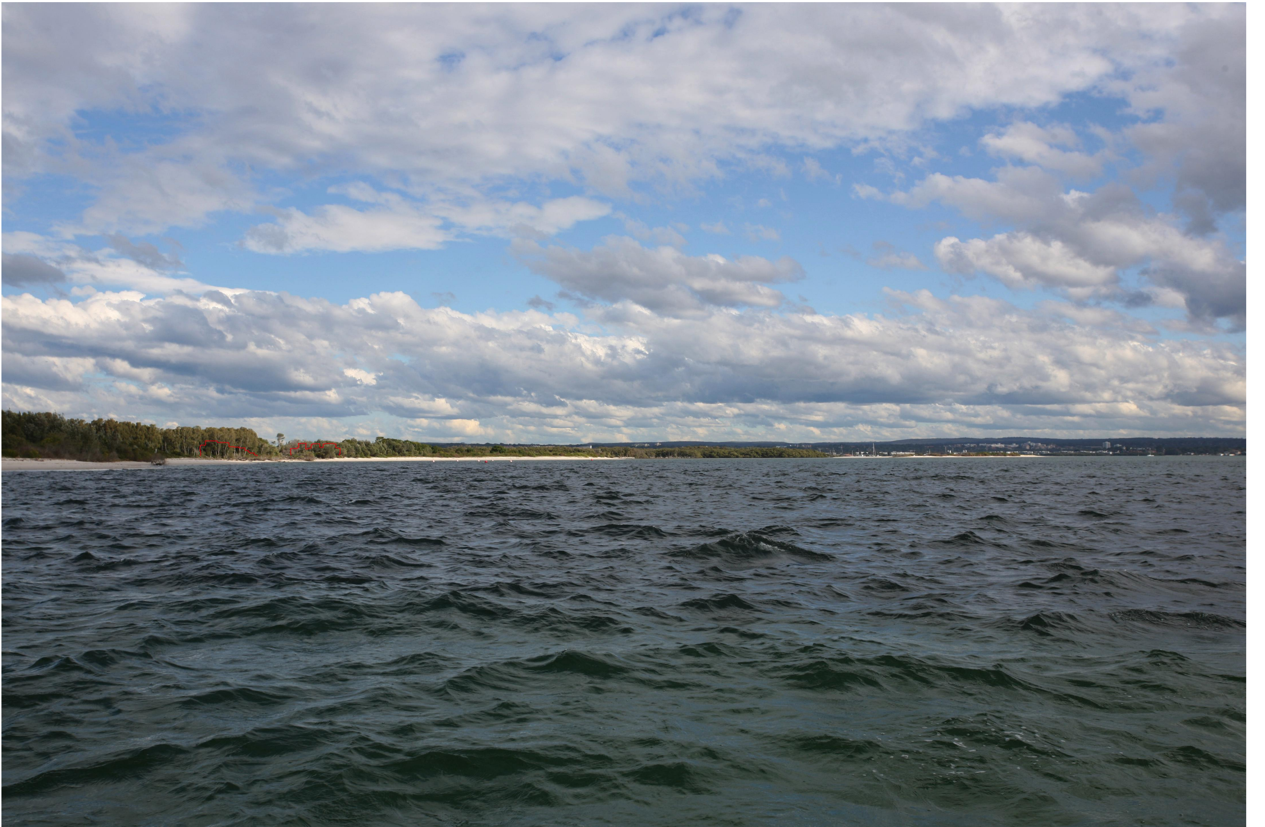
VIEW LOOKING SOUTH, CLOSE TO BEACH AT TOWRA POINT RESERVE. STAGES 1 - 4 DEVELOPMENTS (OUTLINES IN RED) BEYOND.