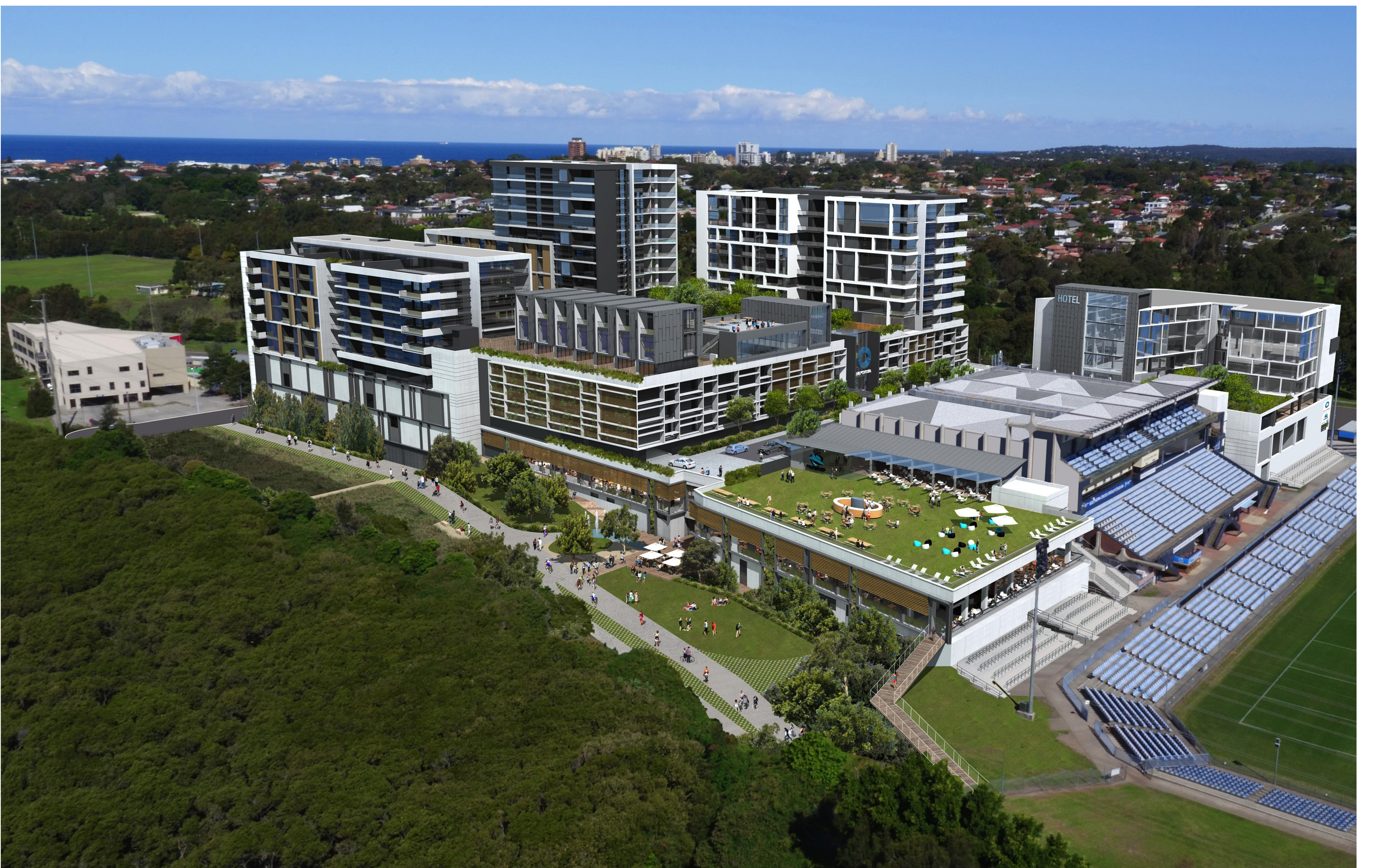
AERIAL VIEW LOOKING SOUTH EAST TOWARD STAGE 4 DEVELOPMENT (L) WITH THE HOTEL AND SHARKS CLUB AND RUGBY STADIUM (R).