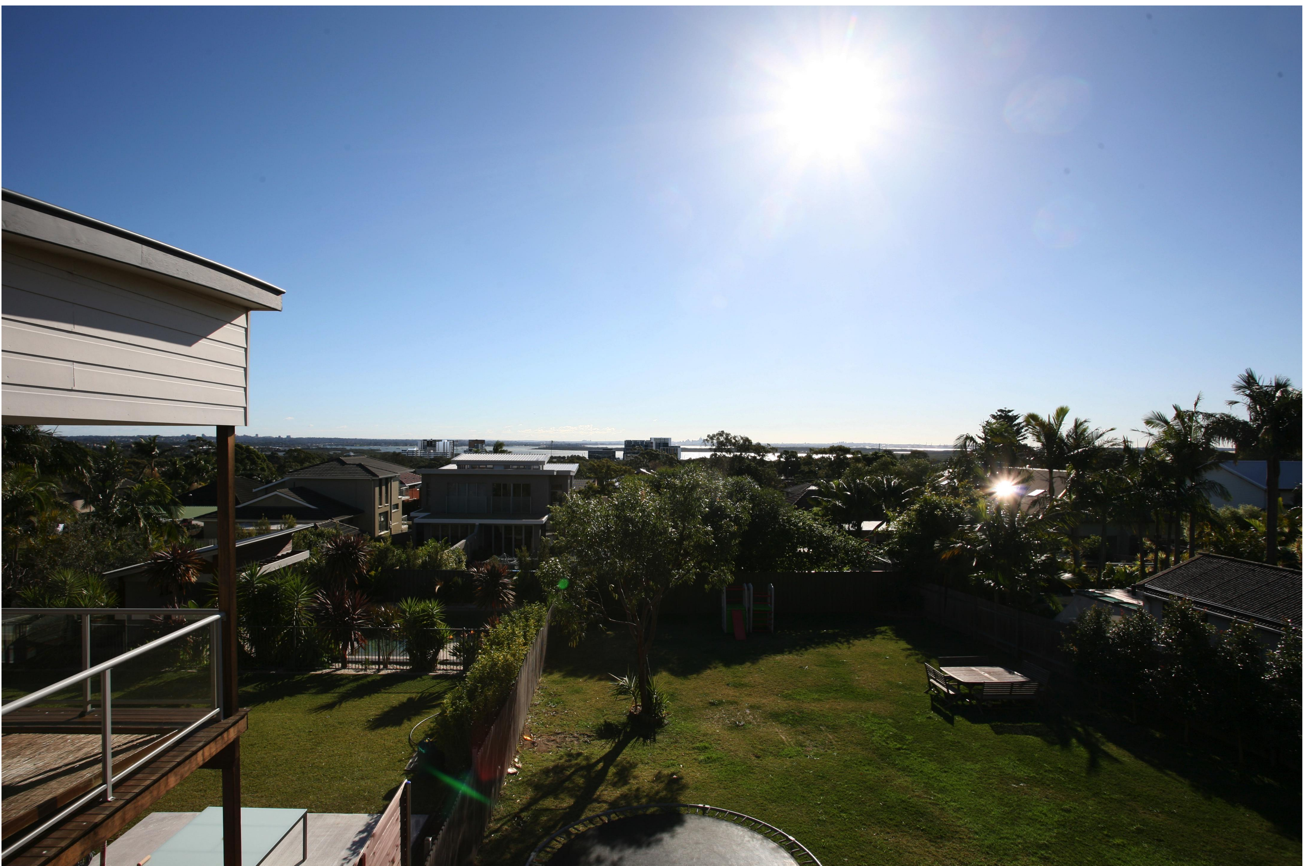
VIEW LOOKING NORTH FROM CASTLEWOOD AVE TOWARD STAGE 4 (R) AND STAGES 1-3 (L) IN THE BACKGROUND.