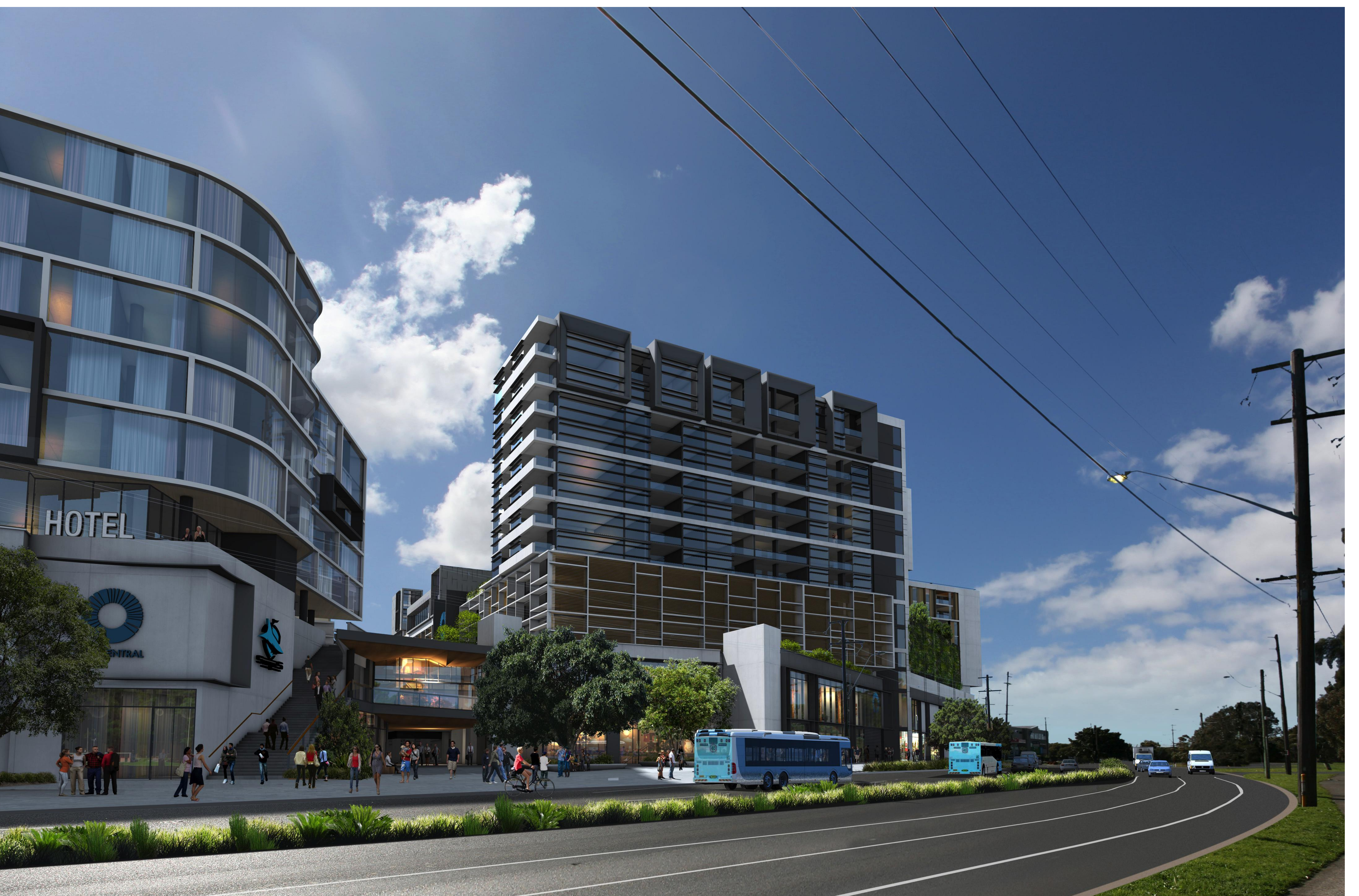
VIEW LOOKING EAST ALONG CAPTAIN COOK DRIVE, WITH THE PROPOSED HOTEL AND BUILDING A BEYOND.

NOTES THIS DRAWING IS THE COPYRIGHT © OF TURNER. NO REPRODUCTION WITHOUT PERMISSION. UNLESS NOTED OTHERWISE THIS DRAWING IS NOT FOR CONSTRUCTION. ALL DIMENSIONS AND LEVELS ARE TO BE CHECKED ON SITE PRIOR TO THE COMMENCEMENT OF WORK. INFORM TURNER OF ANY DISCREPANCIES FOR CLARIFICATION BEFORE PROCECEDING WITH WORK DRAWINGS ARE NOT TO BE SCALED. USE ONLY FIGURED DIMENSIONS. REFER TO CONSULTANT DOCUMENTATION FOR FUTTHER INFORMATION. DWG, IFC AND BIMX FILES ARE UNCONTROLLED DOCUMENTS AND ARE ISSUED FOR INFORMATION ONLY.