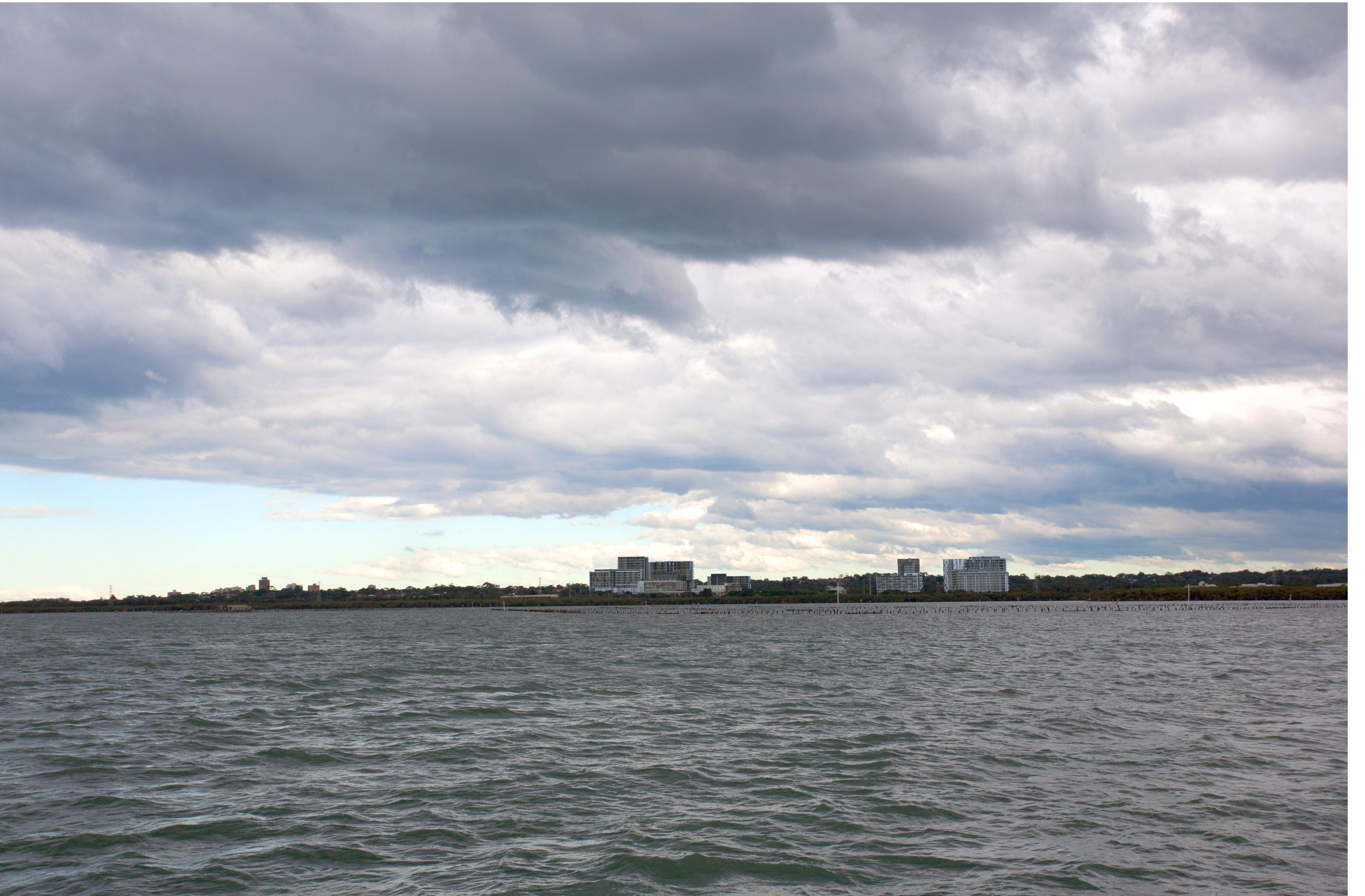
VIEW LOOKING SOUTH FROM WOOLOOWARE BAY, TOWARD STAGE 4 DEVELOPMENT (L) WITH STAGES 1 - 3 (R) BEYOND.

DLCS Quality Endorsed Company ISO 9001:2008, Licence Number 4168 Nominated Architect: Nicholas Turner 6695, ABN 86 064 084 911