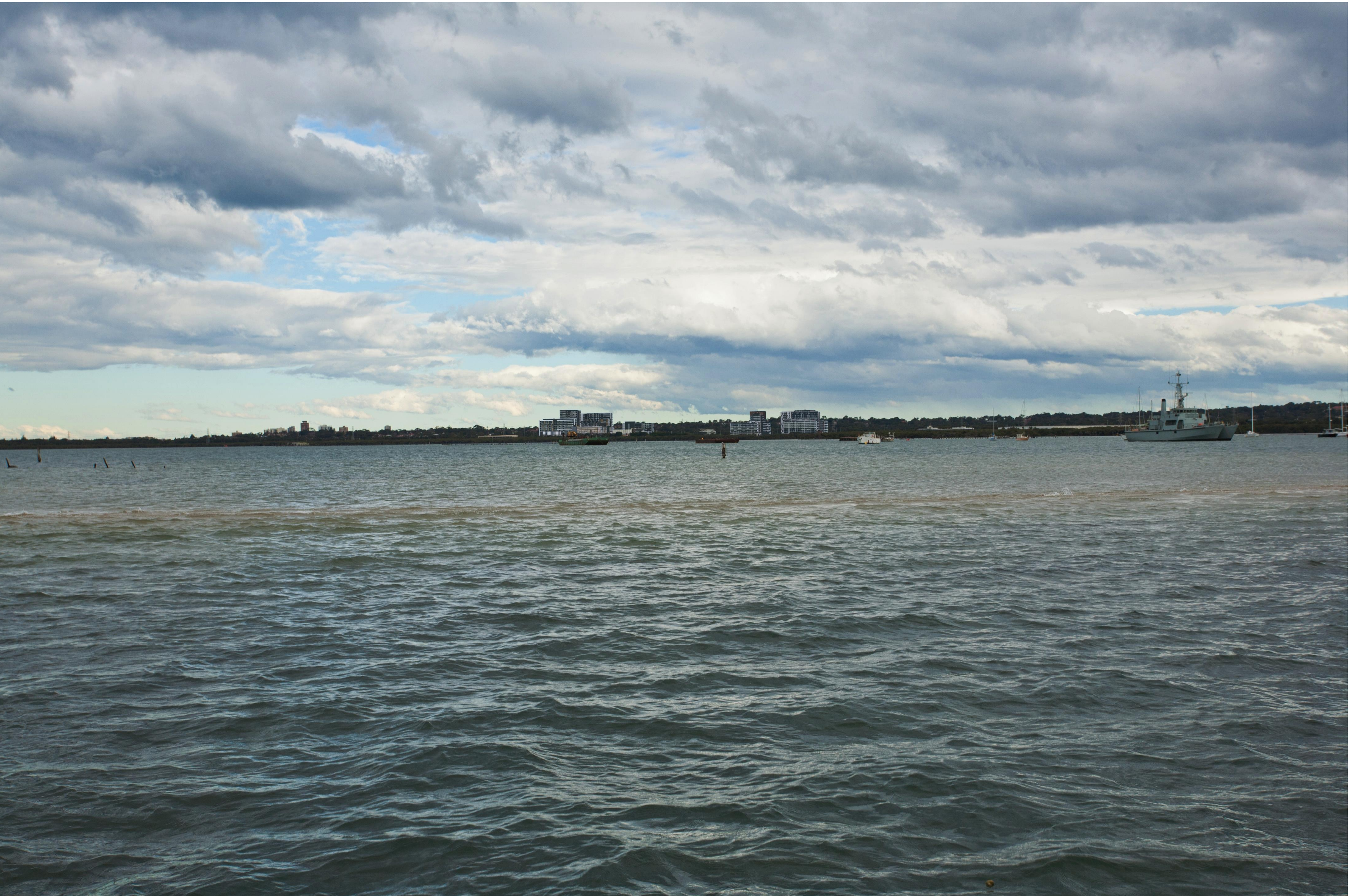
VIEW LOOKING SOUTH FROM WOOLOOWARE BAY, TOWARD STAGE 4 DEVELOPMENT (L) WITH STAGES 1 - 3 (R).