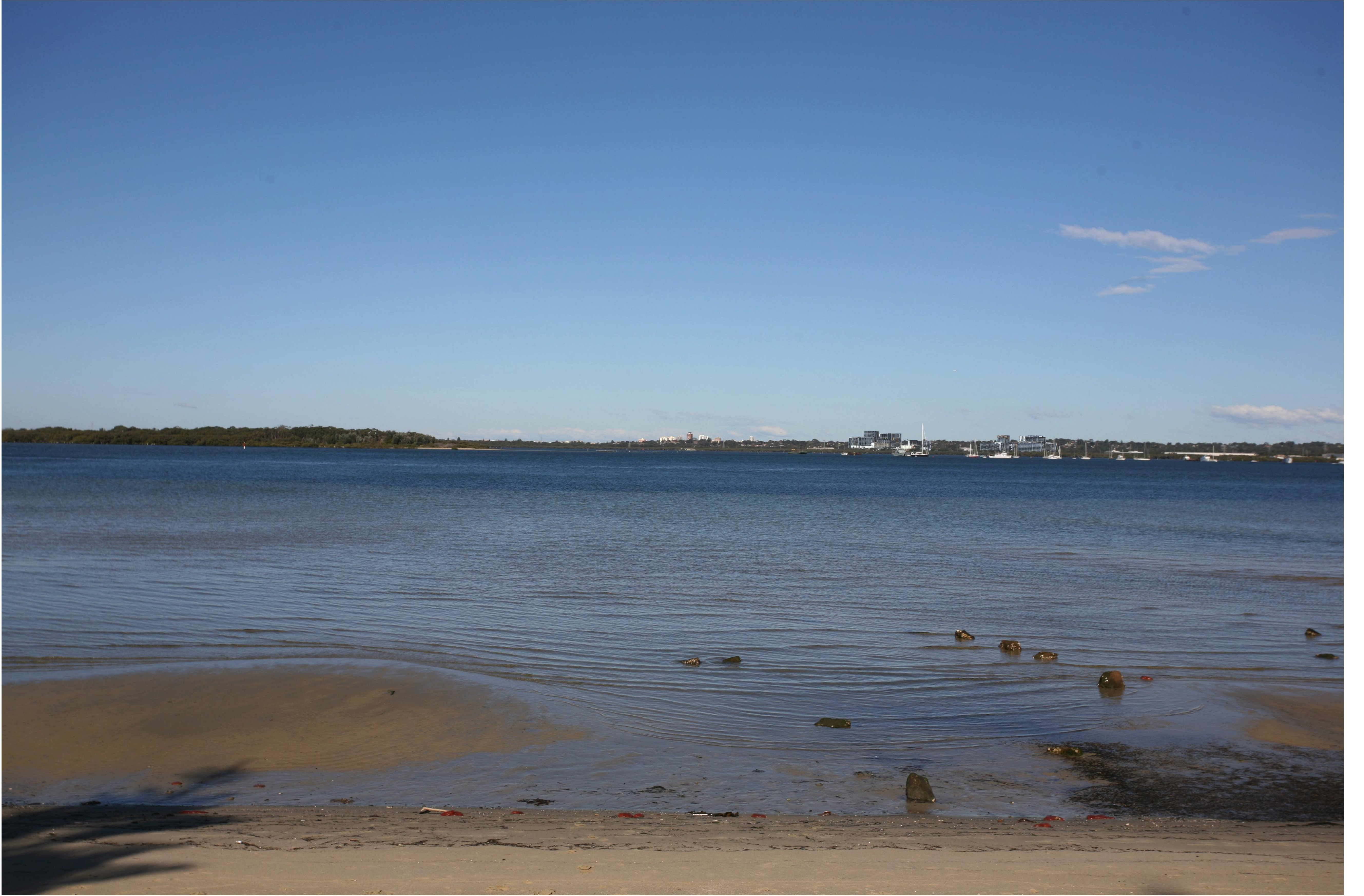
VIEW LOOKING SOUTH FROM DOLLS POINT, TOWARD STAGE 4 DEVELOPMENT WITH STAGES 1 - 3 BEYOND.