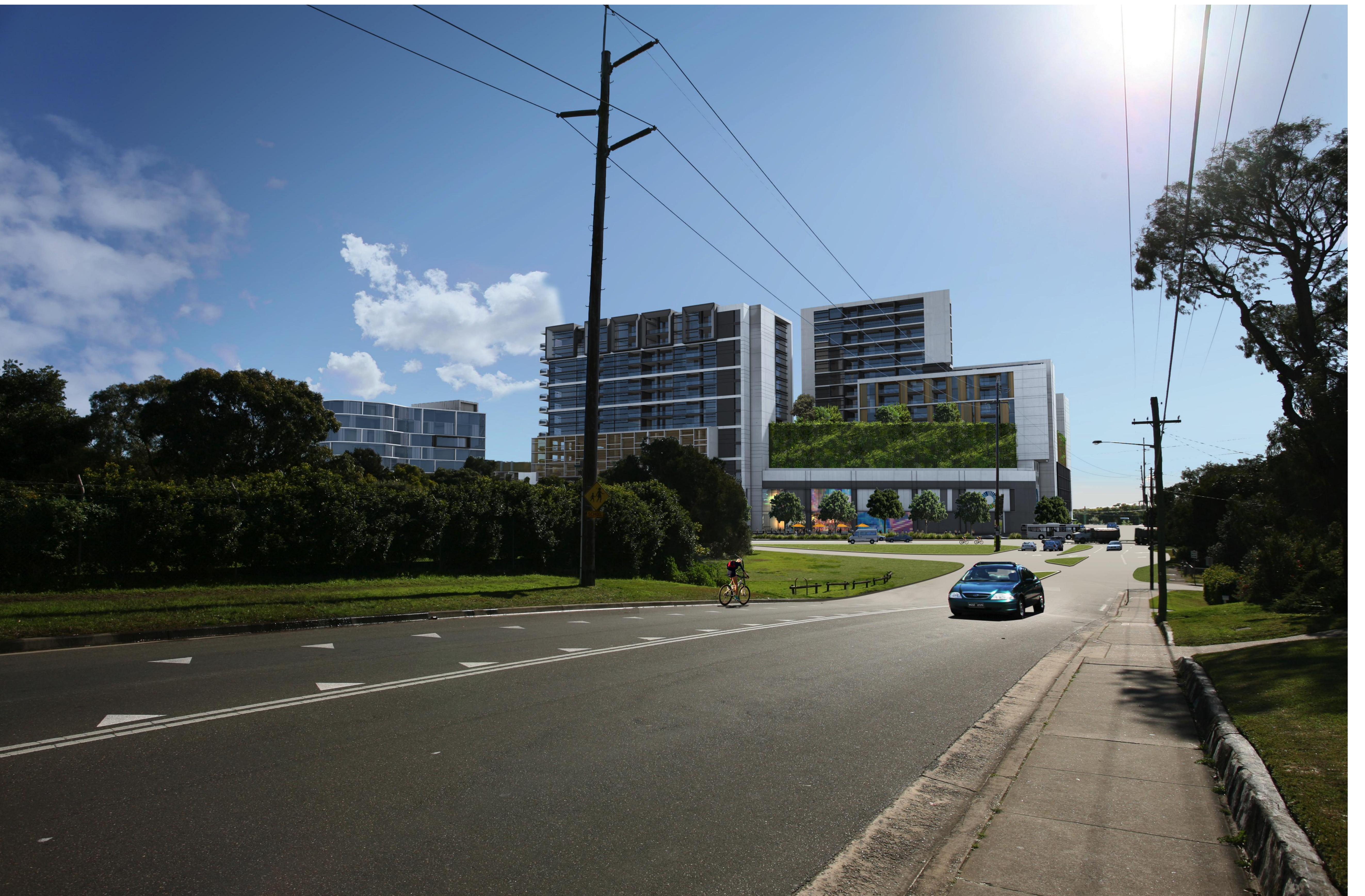
VIEW LOOKING NORTH ALONG GANNONS ROAD WITH STAGE 4 UPLIFT DEVELOPMENT BEYOND.