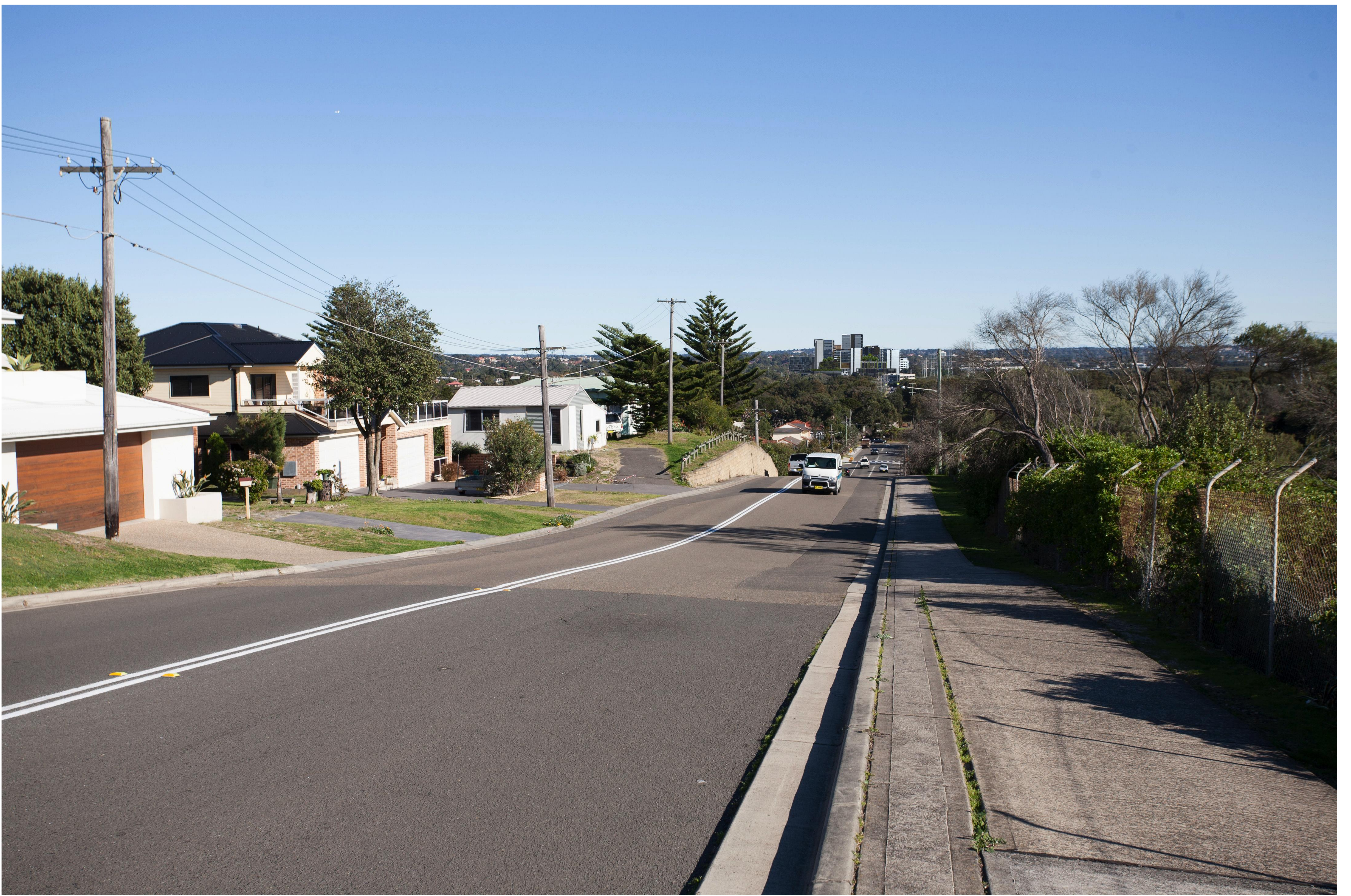
VIEW LOOKING WEST FROM BATE BAY ROAD TOWARD STAGE 4 DEVELOPMENT BEYOND.