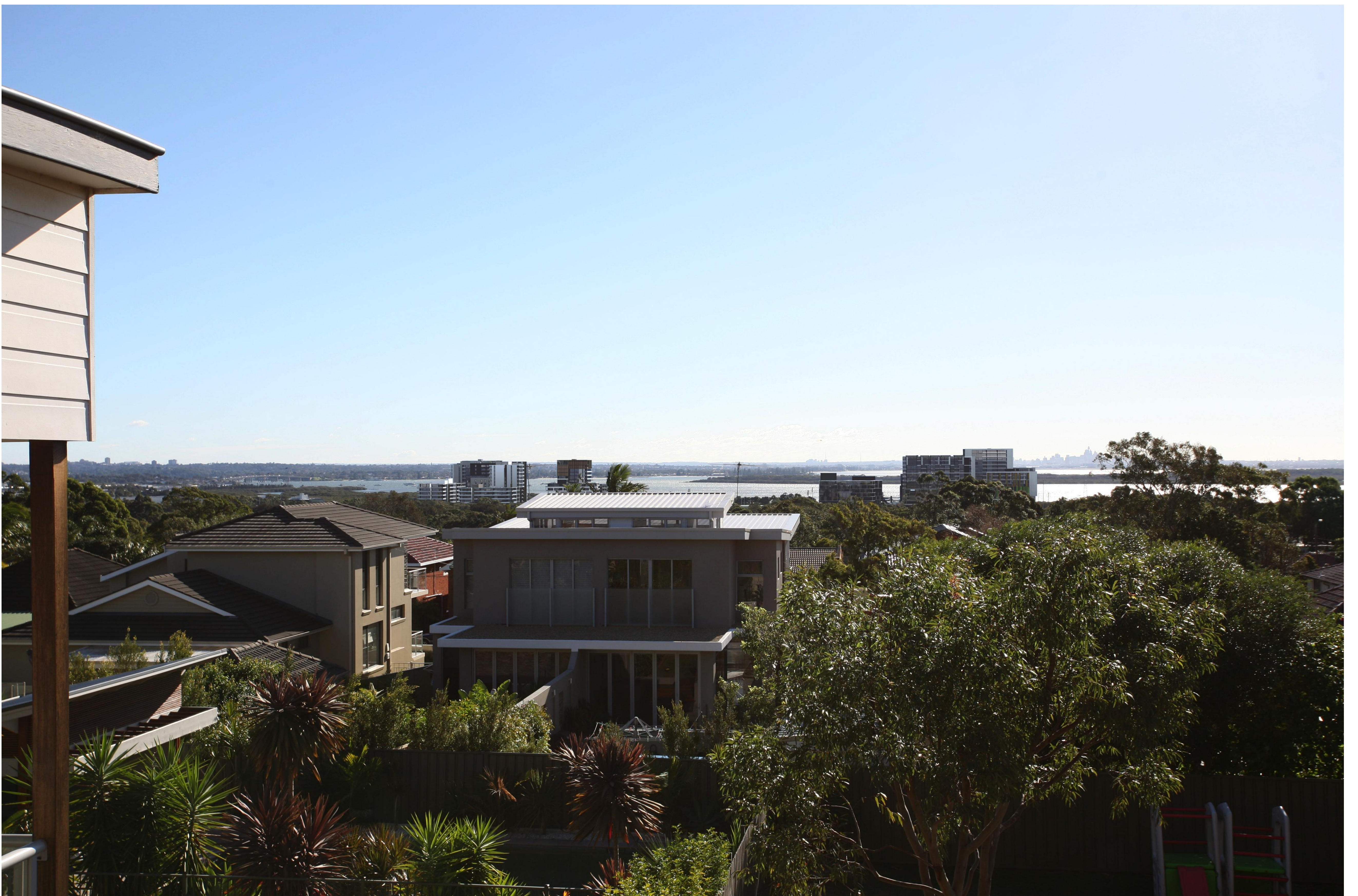
VIEW LOOKING NORTH FROM CASTLEWOOD AVE TOWARD STAGE 4 (R) AND STAGES 1-3 (L) IN THE BACKGROUND.

THIS DRAWING IS THE COPYRIGHT @ OF TURNER. NO REPRODUCTION WITHOUT PERMISSION. UNLESS NOTED OTHERWISE THIS DRAWING IS NOT FOR CONSTRUCTION. ALL DIMENSIONS AND LEVELS ARE TO BE CHECKED ON SITE PRIOR TO THE COMMENCEMENT OF WORK. INFORM TURNER OF ANY DISCREPANCIES FOR CLARRICATION BEFORE PROCEEDING WITH WORK, DRAWINGS ARE NOT TO BE SCALED. USE ONLY FIGURED DIMENSIONS. REFER TO CONSULTANT DOCUMENTATION FOR FURTHER INFORMATION. DWG, IFC AND BIMX FILES ARE UNCONTROLLED DOCUMENTS AND ARE ISSUED FOR INFORMATION ONLY.