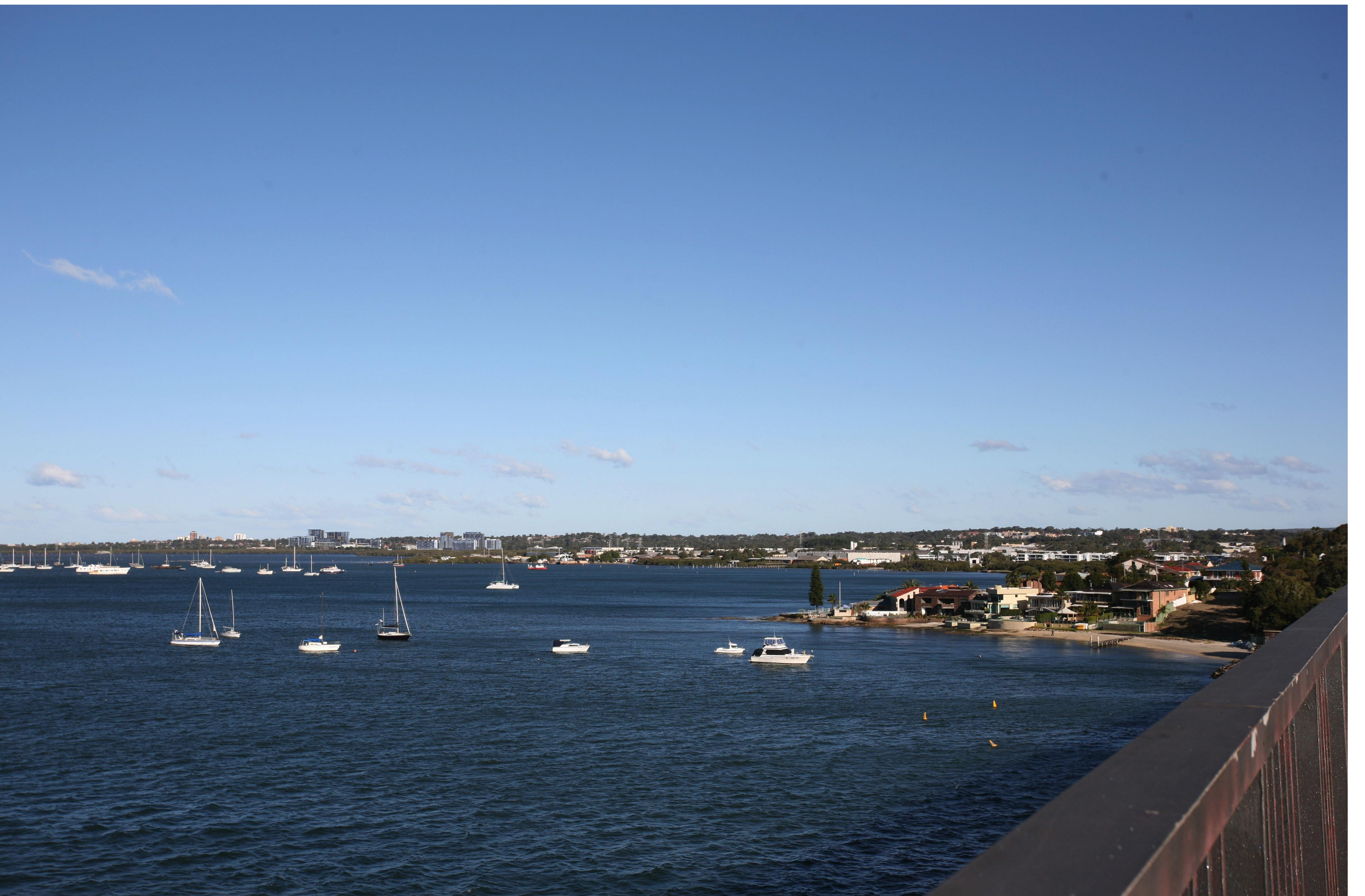
VIEW LOOKING SOUTH EAST FROM ROCKY POINT ROAD BRIDGE ACROSS WOOLOOWARE BAY, TOWARD STAGE 4 DEVELOPMENT WITH STAGES 1 - 3 BEYOND.