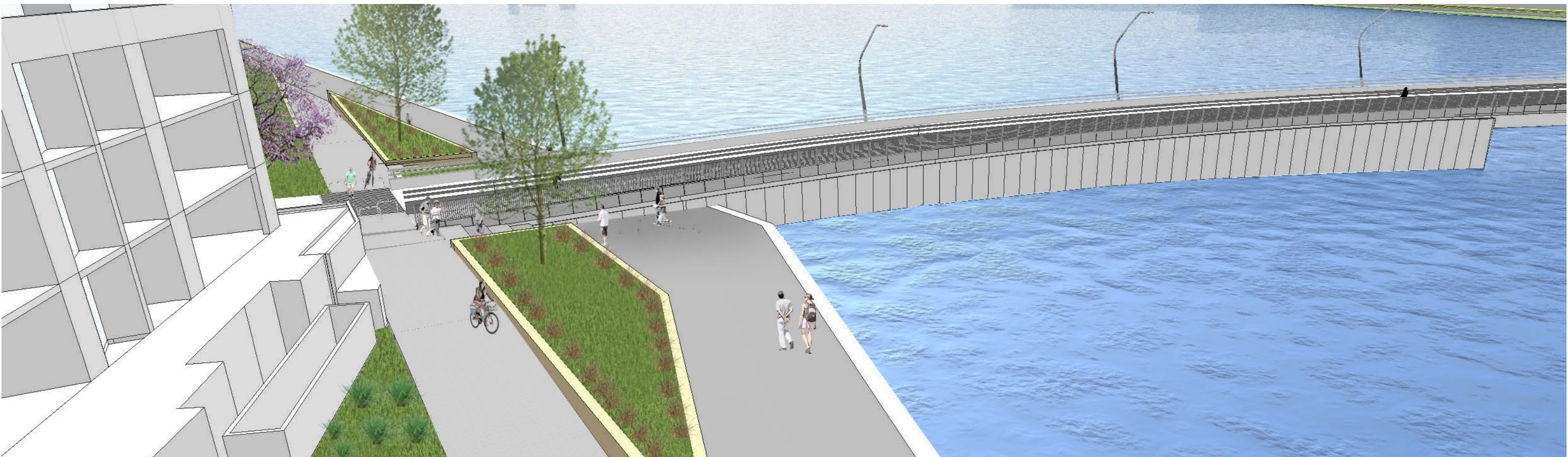
2012 EA BRIDGE