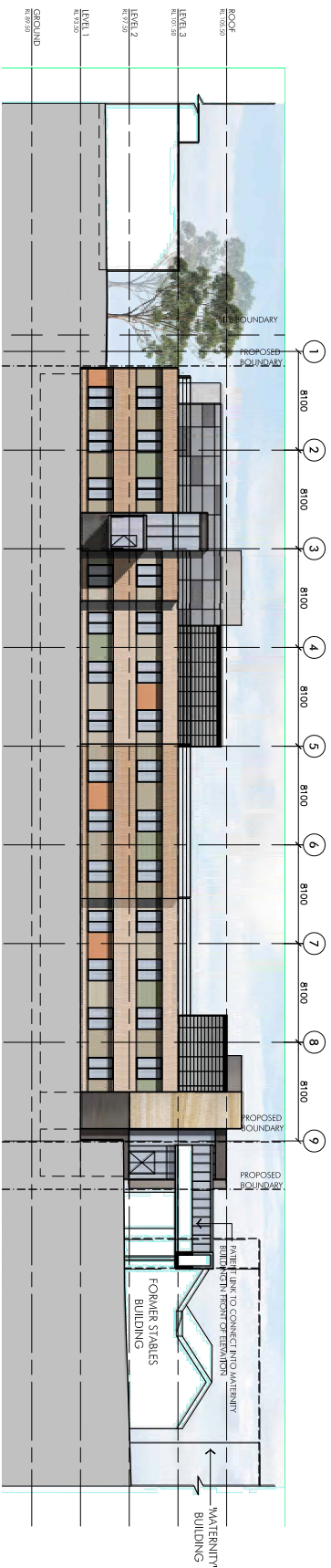
01 SOUTH ELEVATION SCALE 1:200