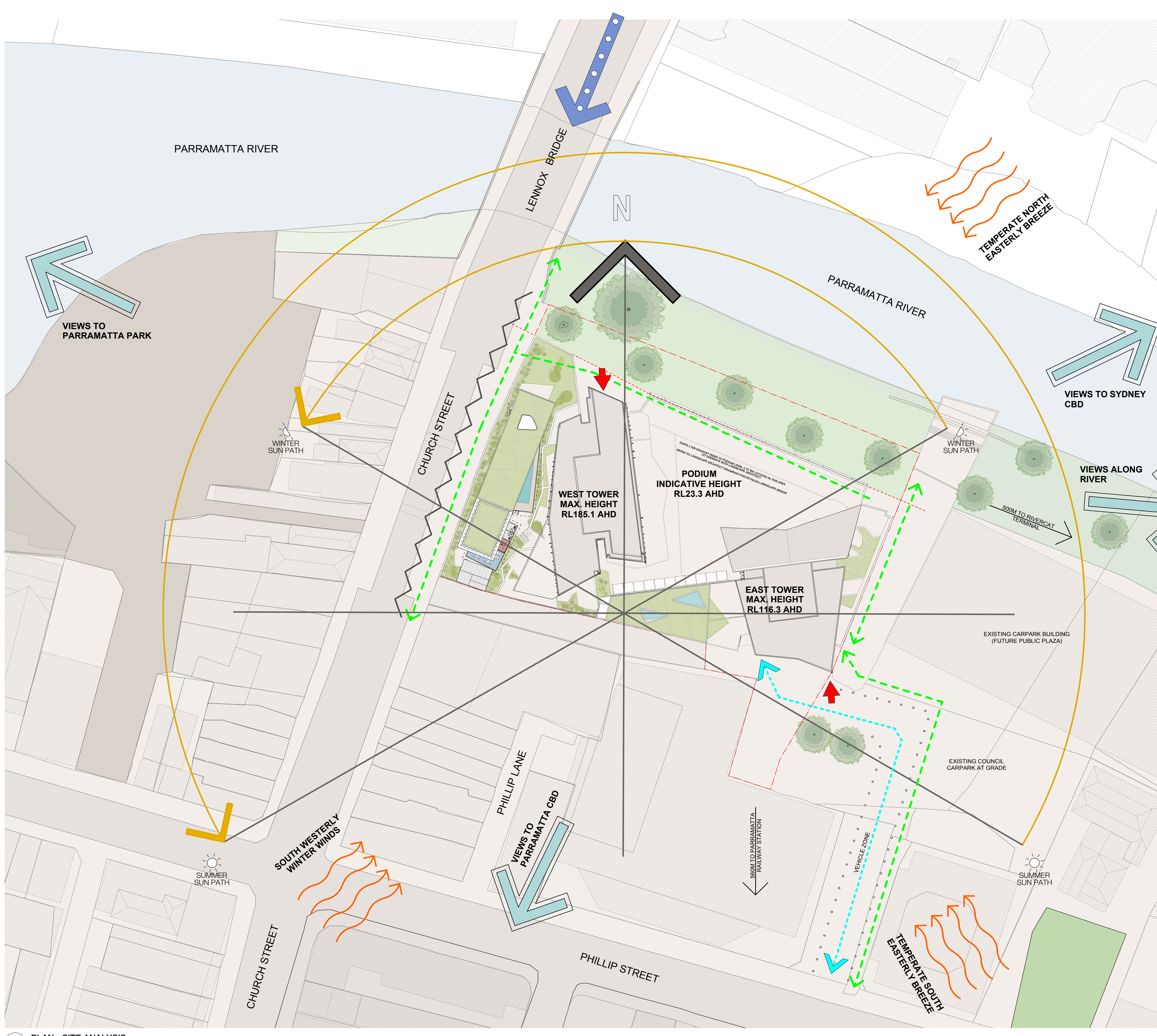
01 PLAN - SITE ANALYSIS 1:500 @A1