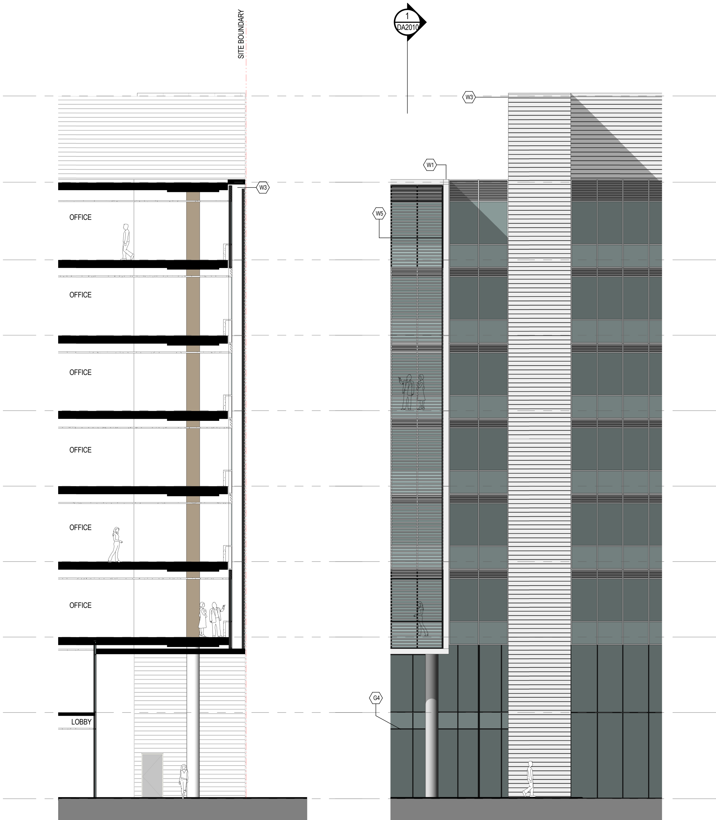
1 SECTION DETAIL 1-1 DA2010 Scale: 1 : 100