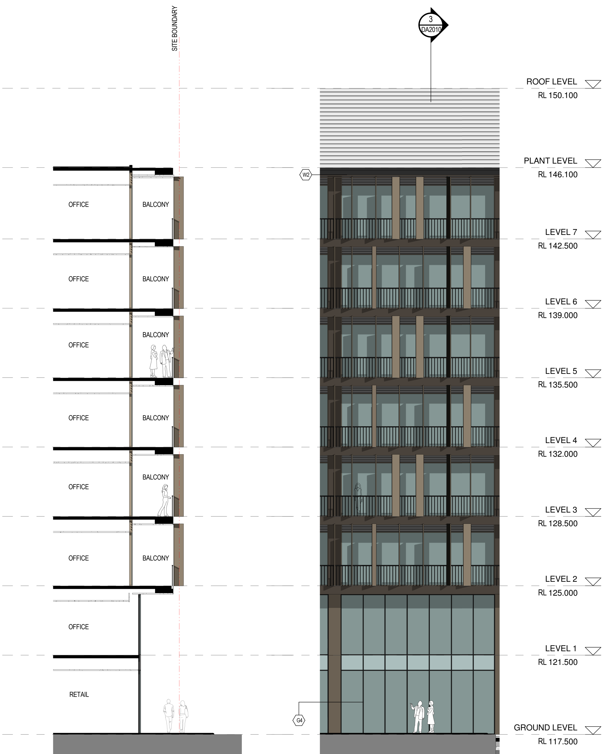
3 SECTION DETAIL 2-2 DA2010 Scale: 1 : 100