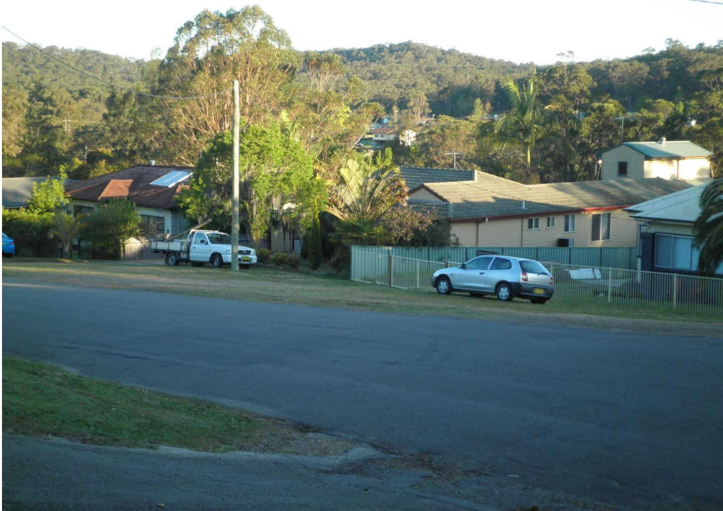
This photo above is the view of the mountain from the school entrance at the 40km sign.