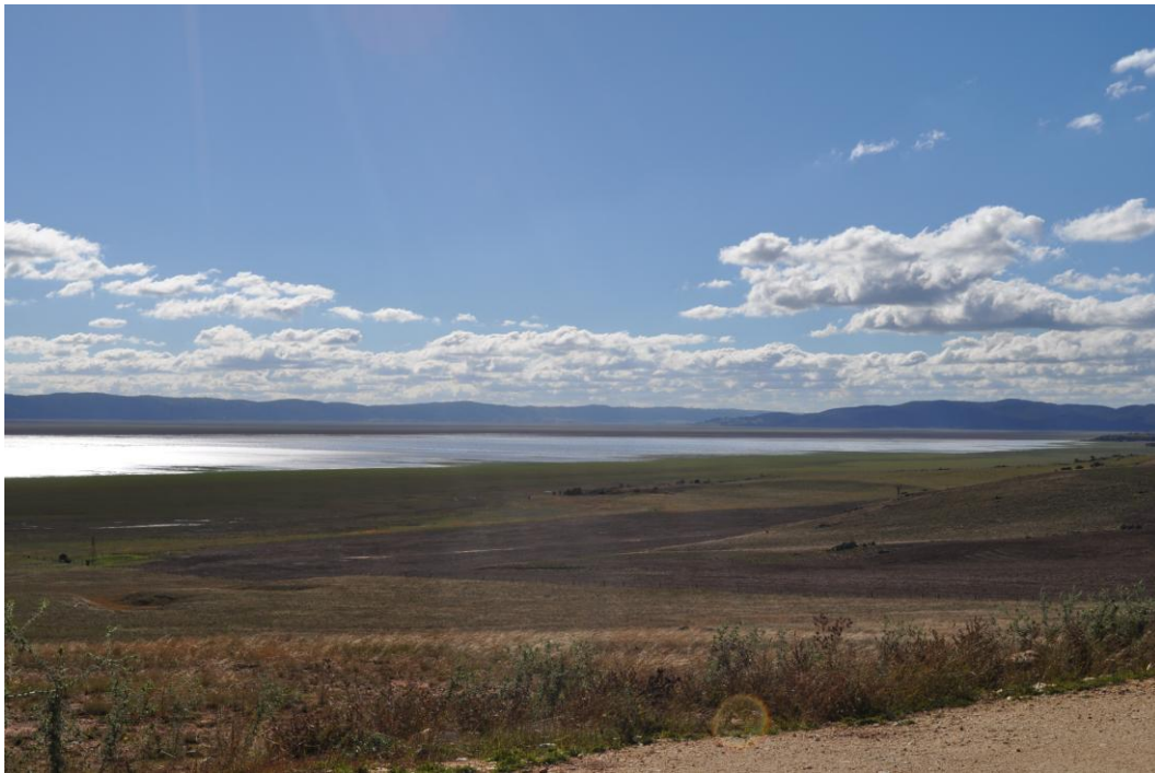
Figure 4: General landscape of the Capital Wind Farm II project area, showing the lack of bat habitat.

The area destined for turbines is completely open pasture land, devoid of any trees at all (Figure 4).