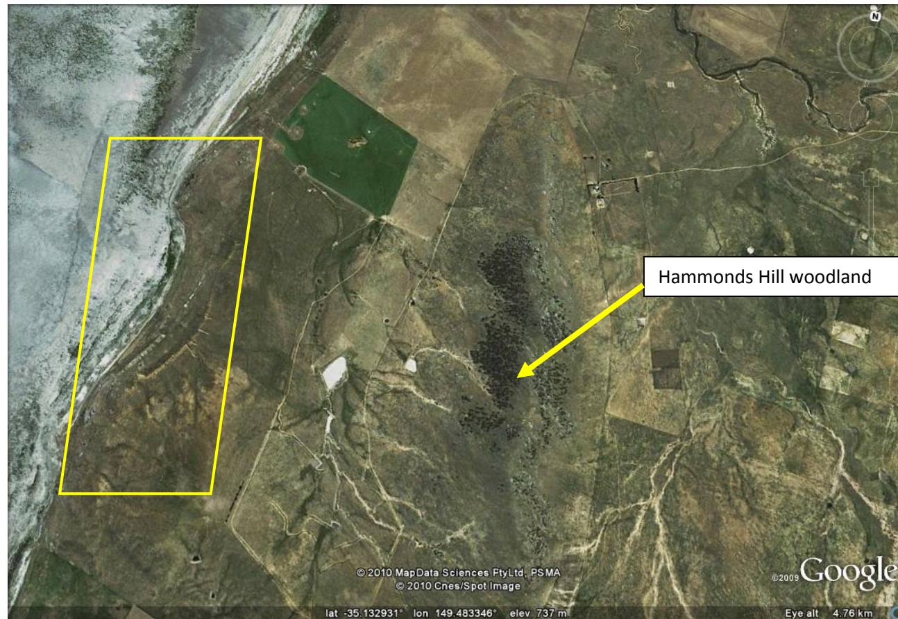
Figure 3: Southern portion of the Capital Wind Farm project area, showing the tract of woodland on Hammonds Hill surrounded by cleared open pasture. A new area of turbines that may be of concern is also highlighted.