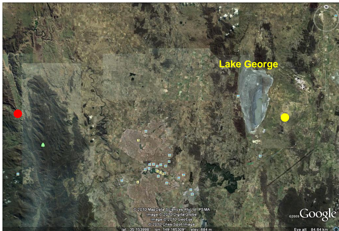
Figure 2: Approximate location of the Eastern Bentwing Bat breeding cave at Wee Jasper (red dot) and a staging or overwintering cave at Mount Fairy (yellow dot) in relation to the Capital II Wind Farm on the eastern edge of Lake George.

Until recently, it has not been known whether migration occurs in large groups or whether small numbers of individuals leave each night over a longer period, but there is some indication (based on around 7000 departing in a one week period 2 ) that large groups leave in roughly the same time period.