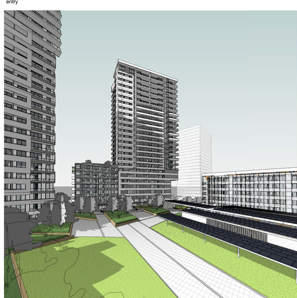
View of Public Park looking towards building D