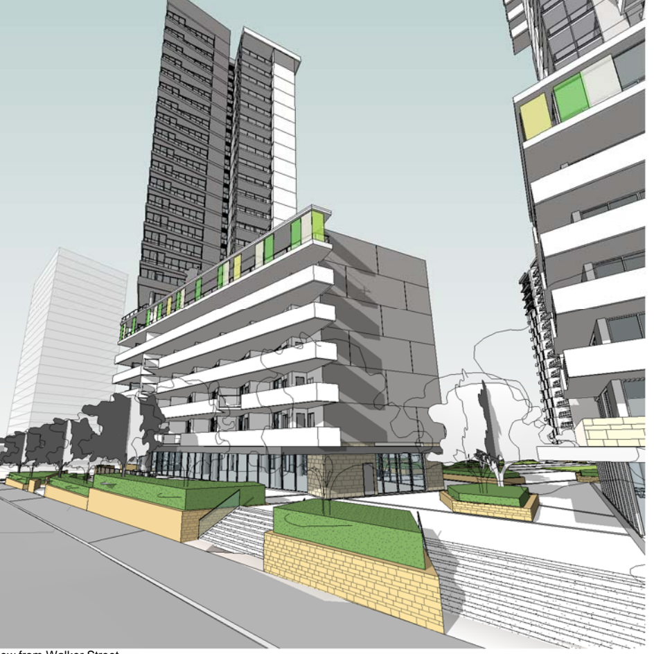
View from Walker Street looking towards public park entry