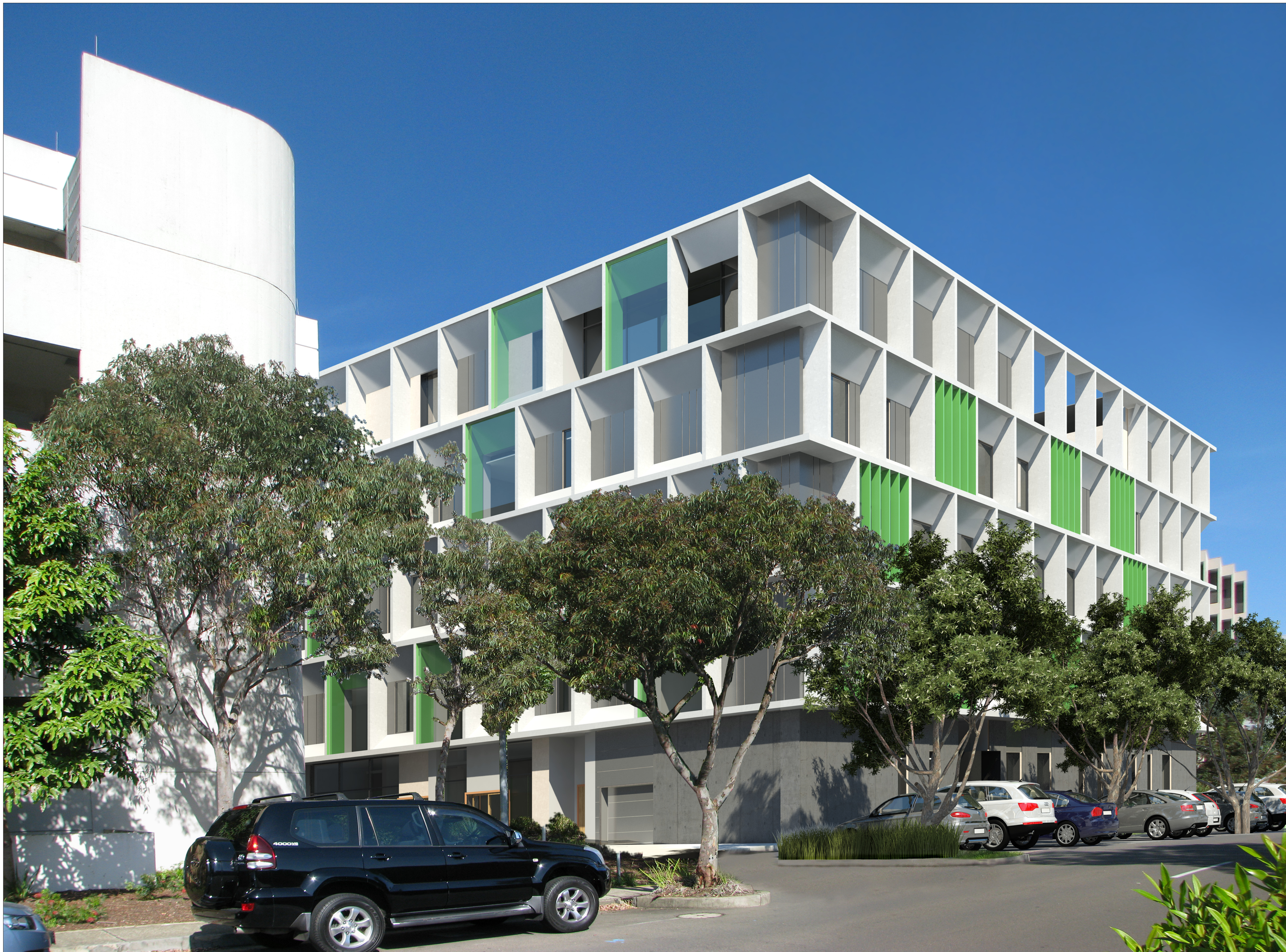
VIEW FROM HOSPITAL ROAD