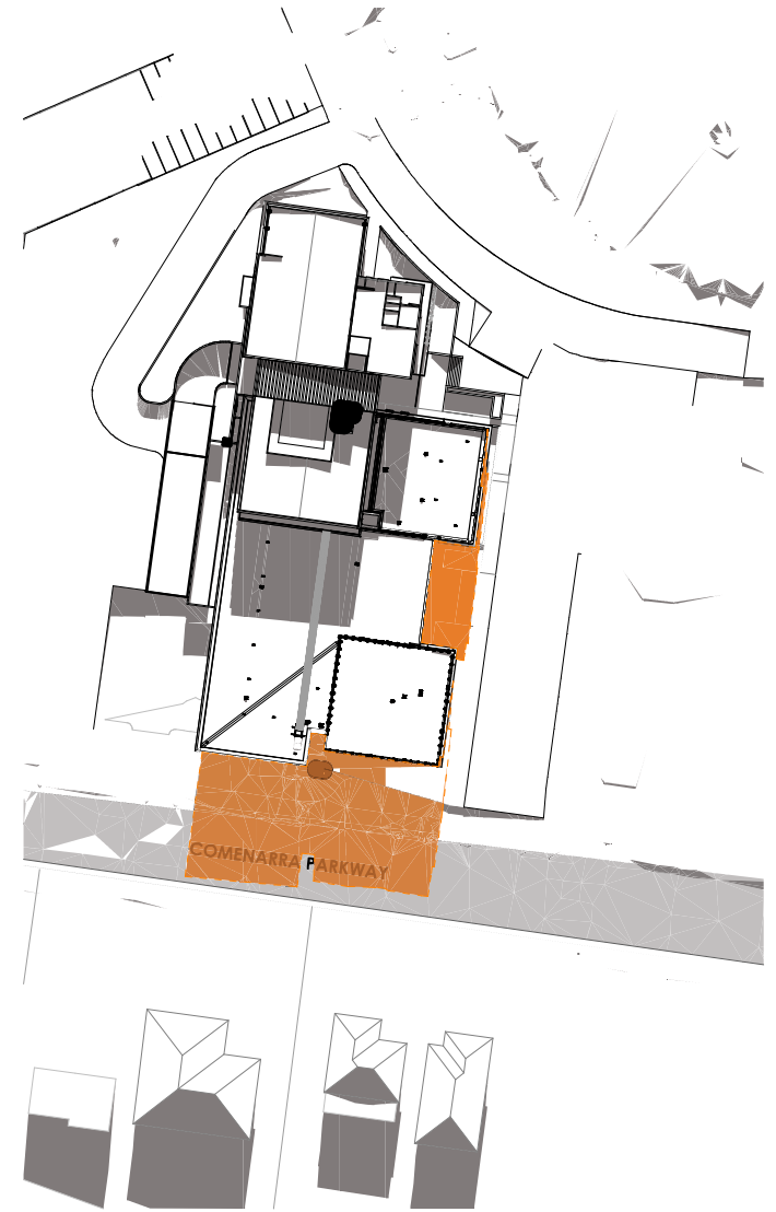
6 STAGE 1 + STAGE 2 - MARCH 21 - 2pm 12017 DA 01c.pln