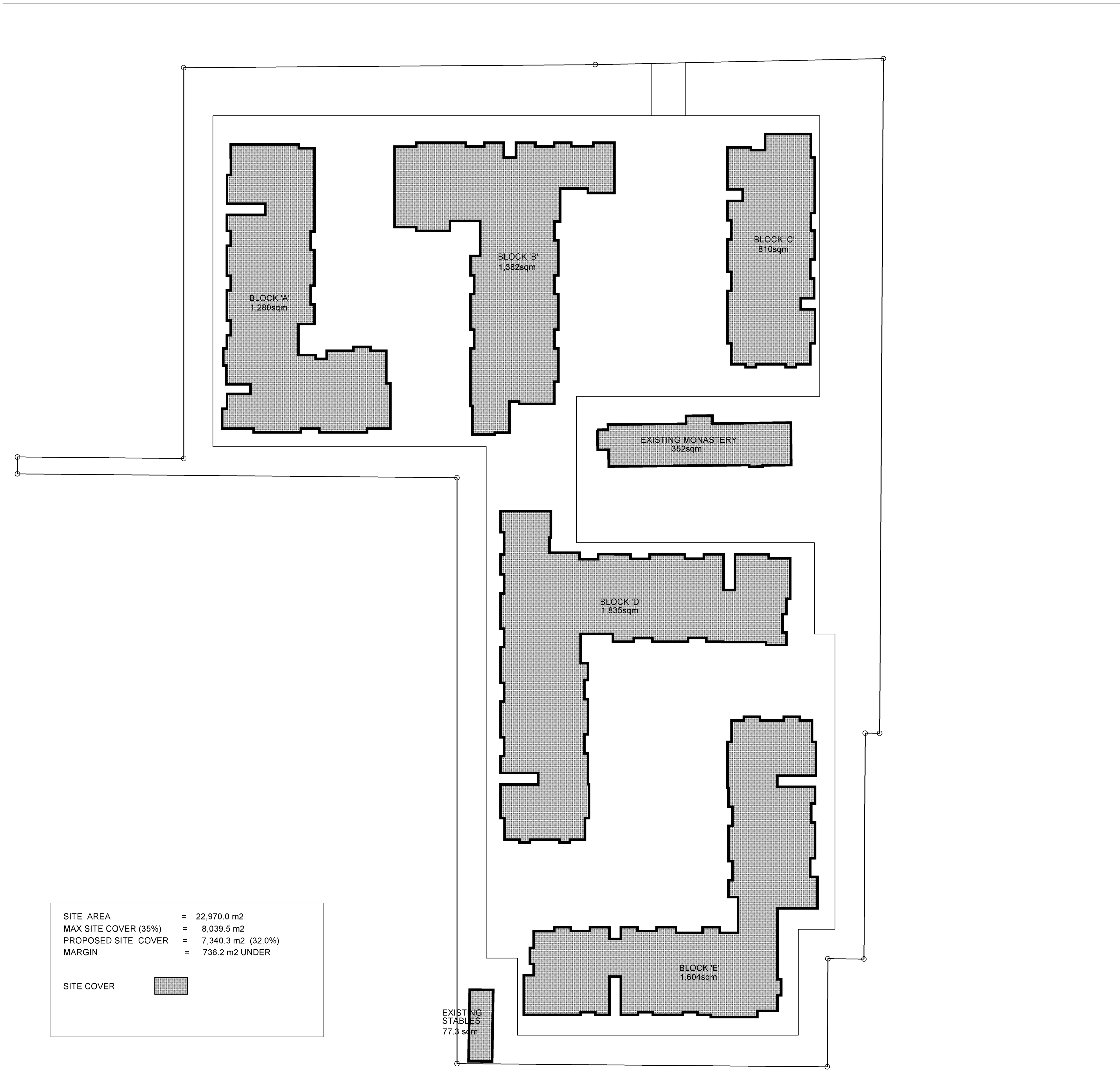
BUILDING SITE COVER