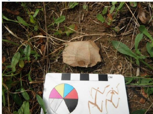
Figure 3: GT OS2 artefact.