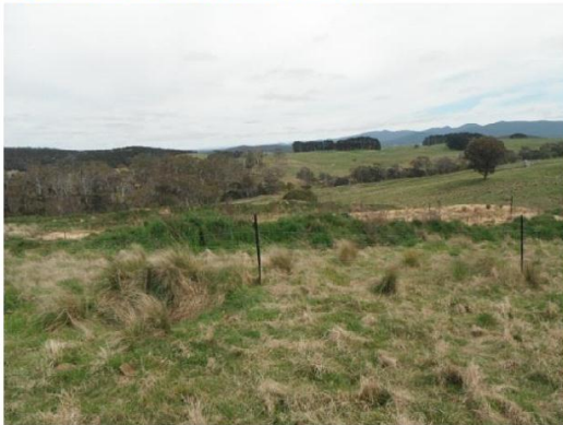
Figure 1: GT OS1 (north) location.