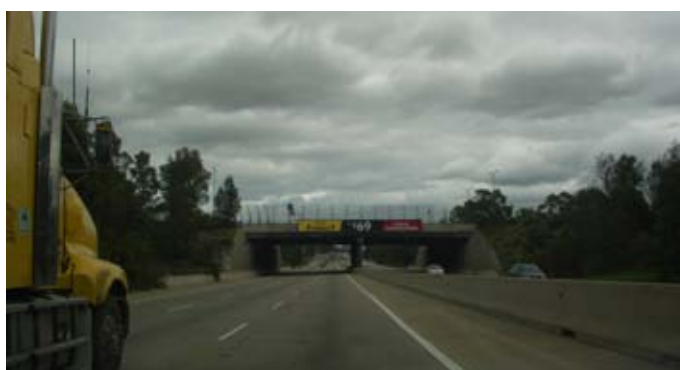
Illustrations 49 - 51:

Character images of the Heathcote Road to Moorebank Avenue precinct: Cumberland Plain Woodland vegetation adjacent to the southern Milperra commercial area, view west showing the concrete carriageway, and view west to Moorebank Avenue