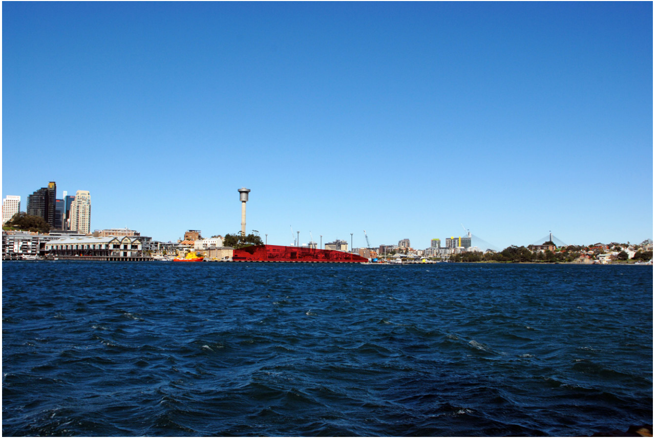
View from Blues Point with an approximation of the proposed landform in red