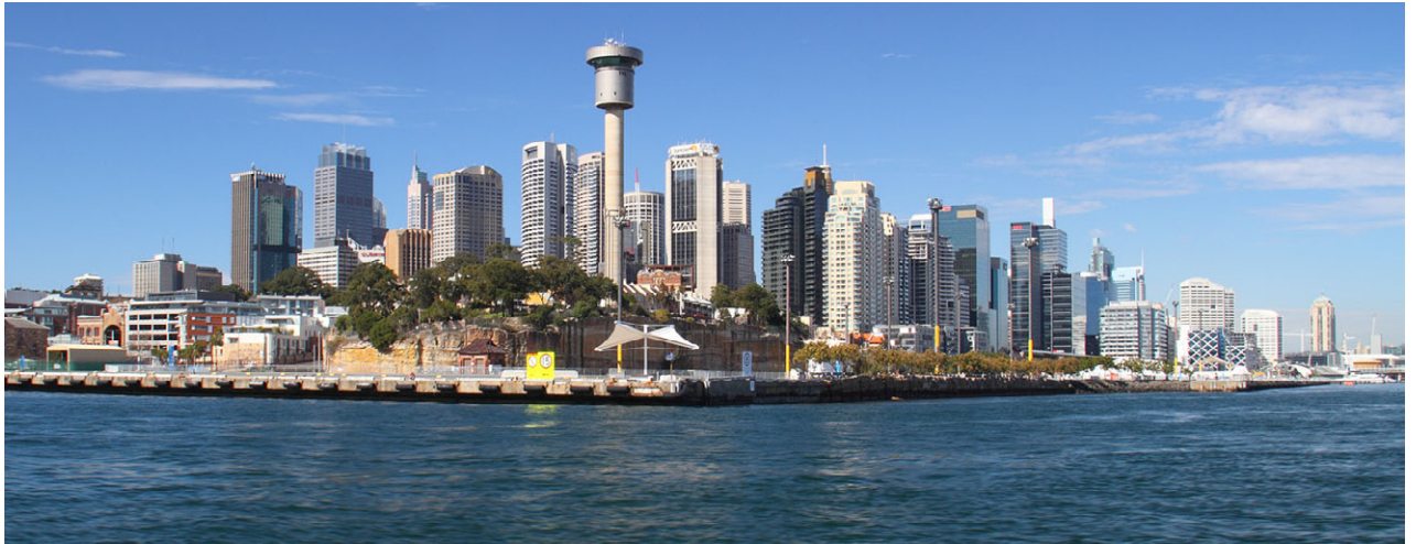
Image showing existing view from water level of Sydney Harbour looking south to the Headland Park with the City Centre behind