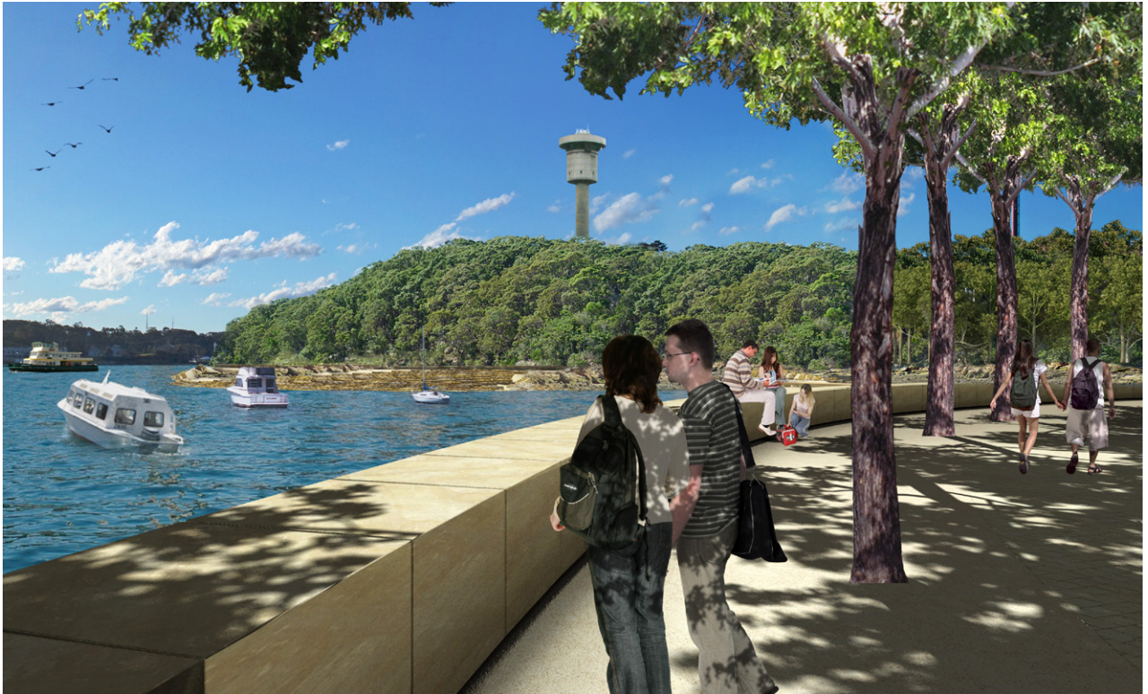
Image showing proposed view from Barangaroo Central Foreshore Walk looking north to Headland