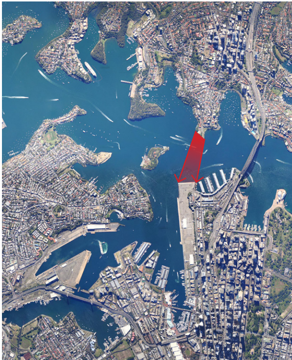
Approximate viewshed from Blues Point