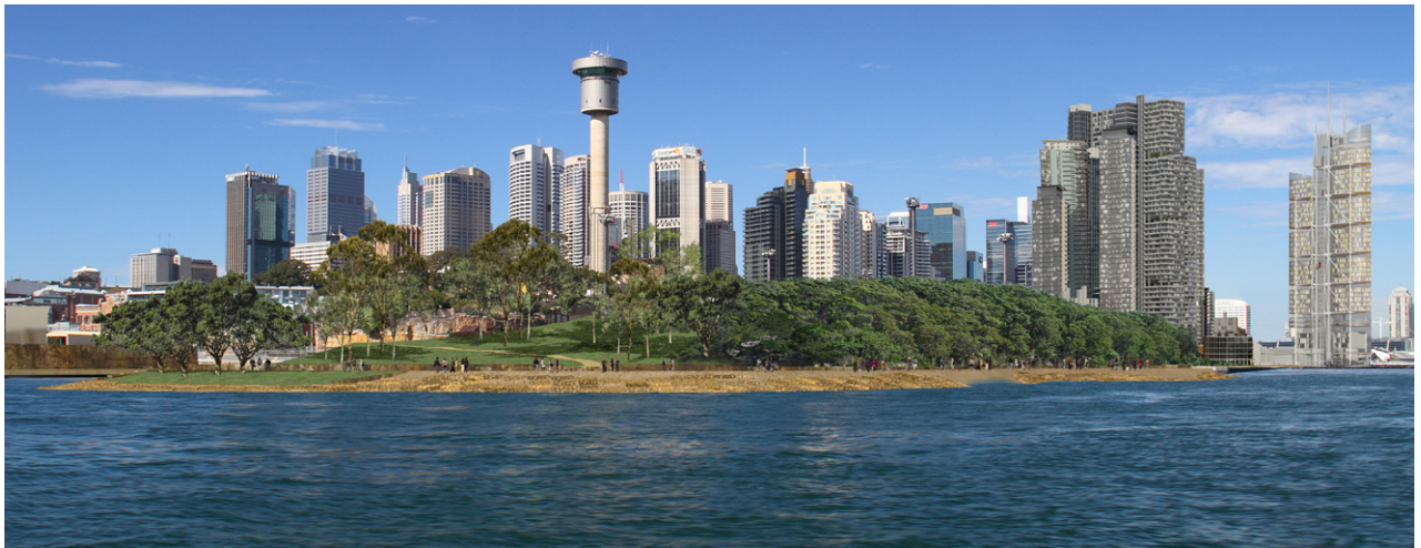
Image showing proposed view from water level of Sydney Harbour looking south to the Headland Park with the City Centre behind Note: Image shown for Barangaroo South is subject to planning determination.