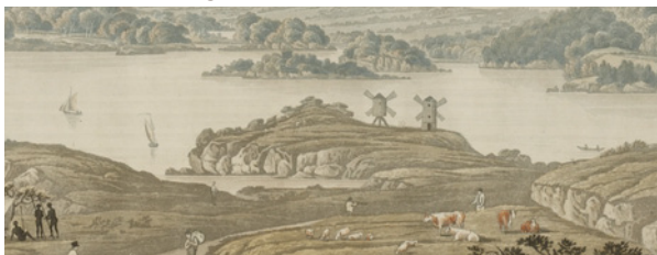
Panoramic Views of Port Jackson (Detail of Panel 3 of 3). Major James Taylor. ca. 1821. The steeper southern slopes of the headland are shown