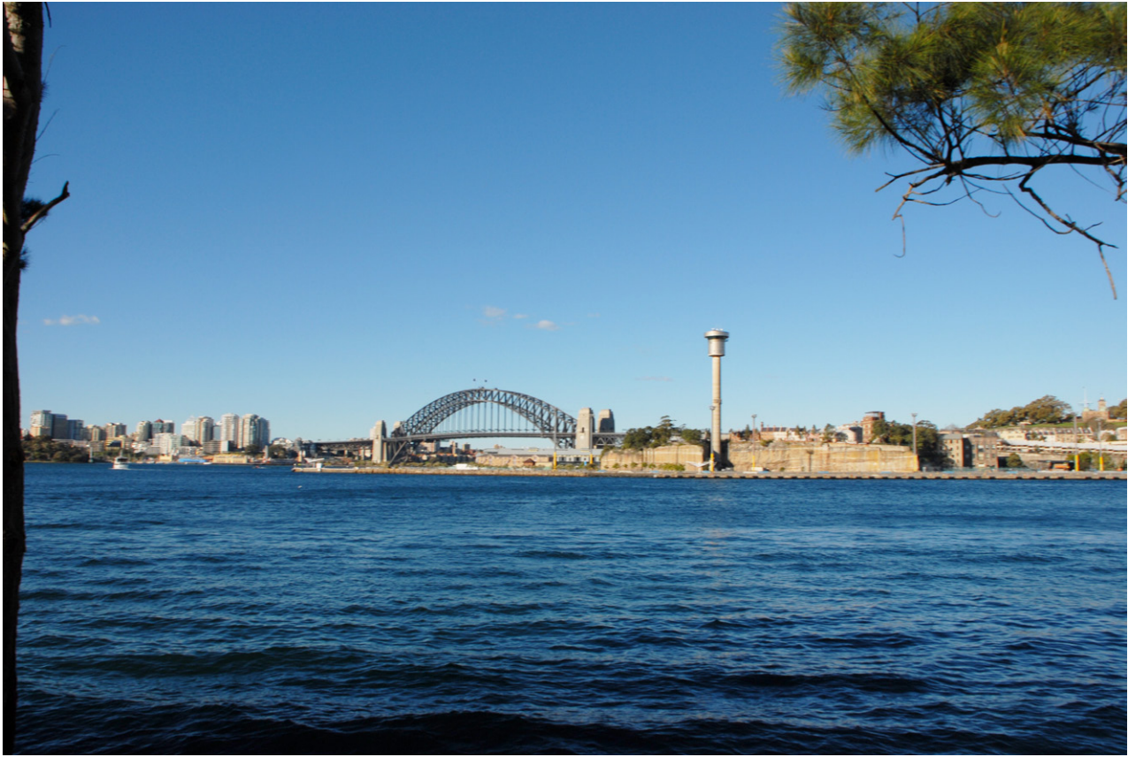
Existing view from Balmain East