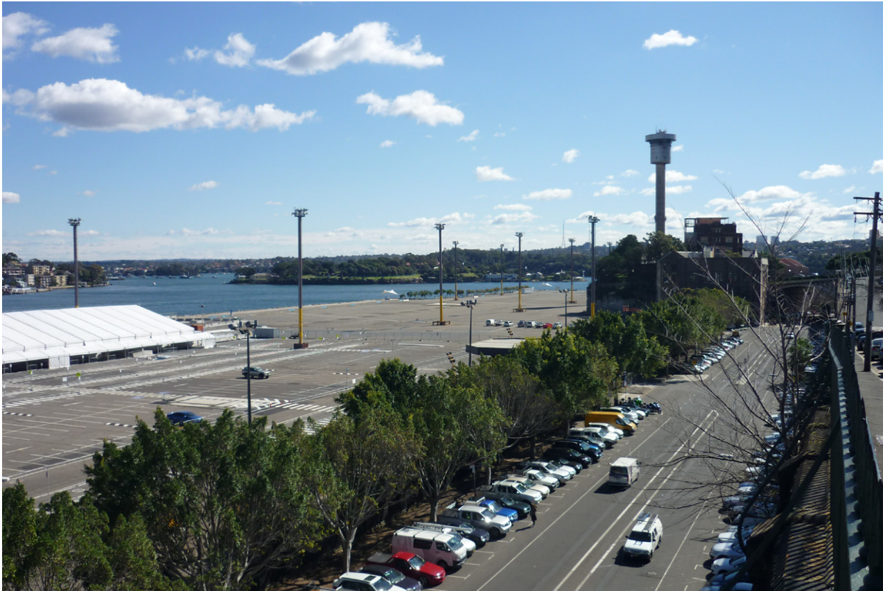
View from High Street looking north west across the site