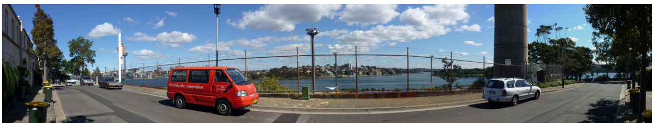
The existing 180° view from the high-point of Merriman St