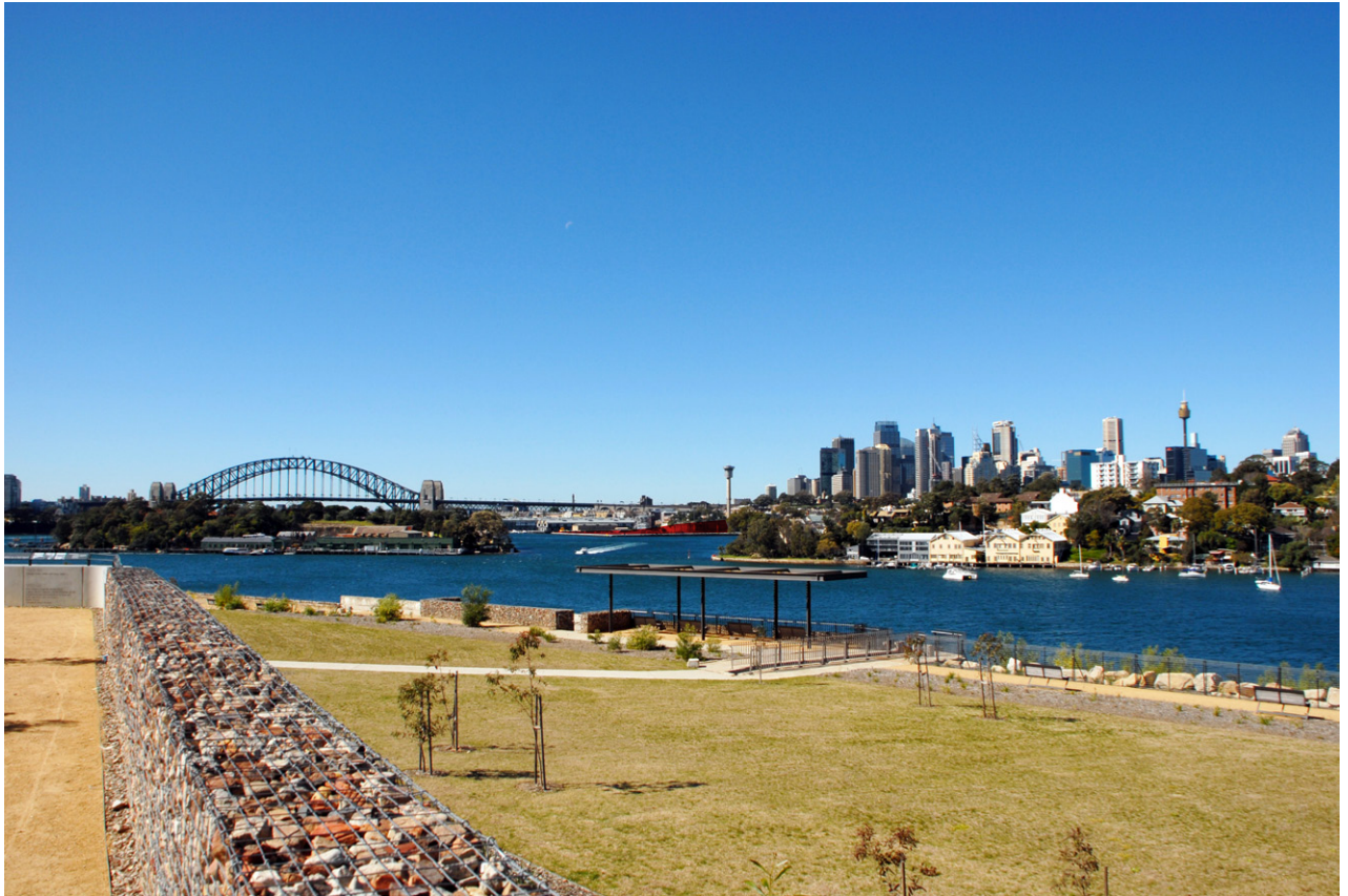
View from Ballast Point with an approximation of the proposed landform in red