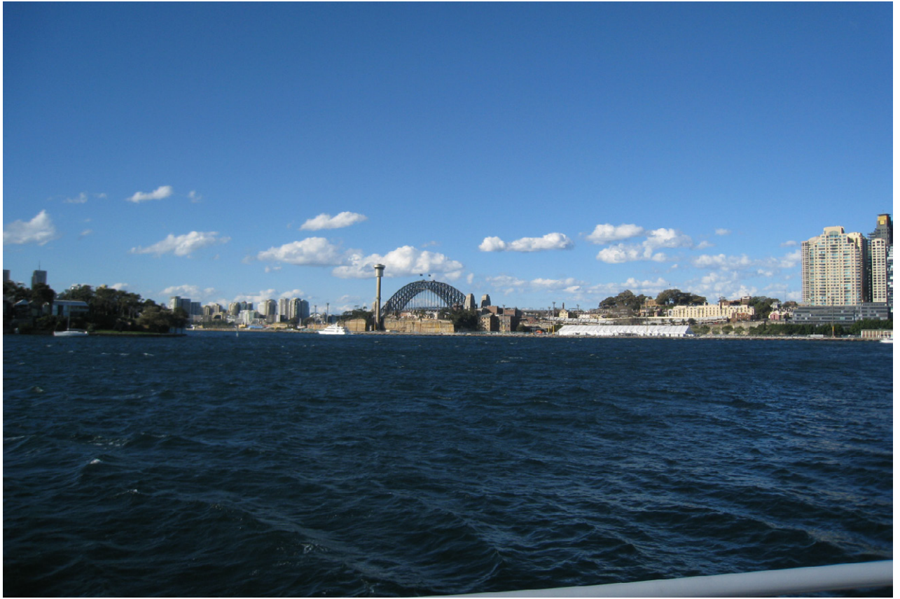
Existing view from Pyrmont