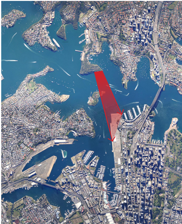
Approximate viewshed from Balls Head