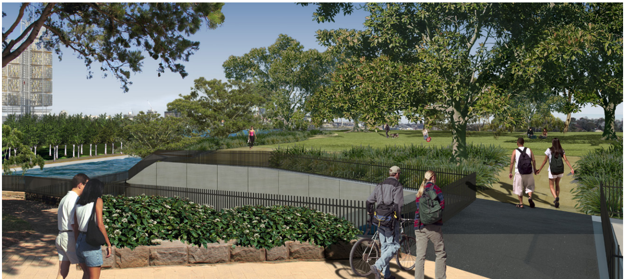
Image showing proposed view from Merriman Street to the southwest Note: Image shown for Barangaroo South is subject to planning determination.