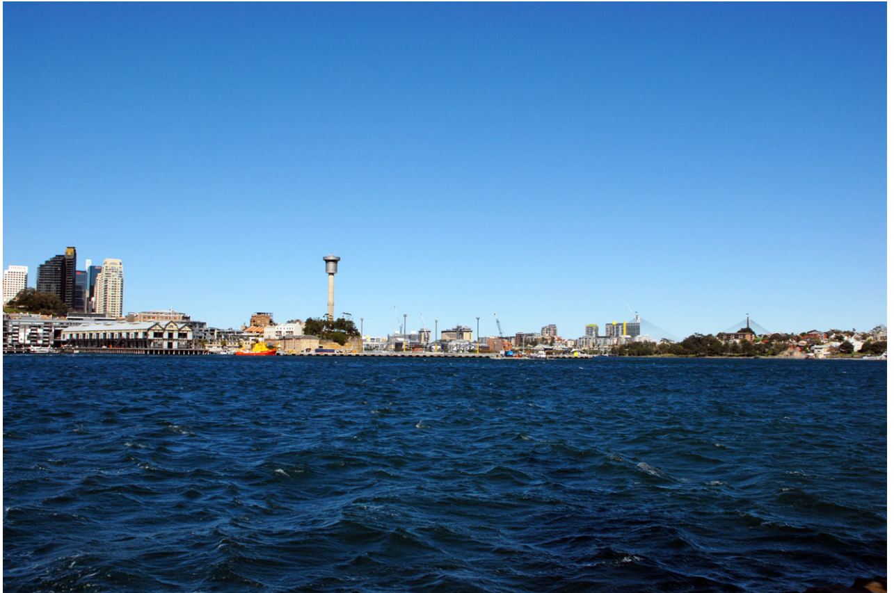
Existing view from Blues Point