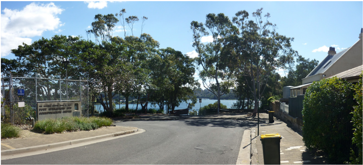
The existing view from the northern end of Merriman St looking north