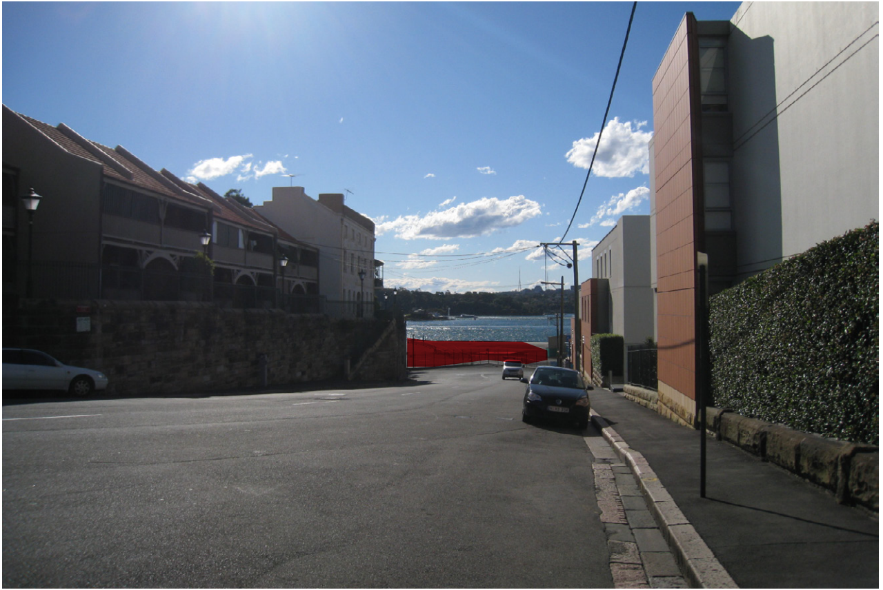
Existing vista looking northwest down Dalgety Road. The entry to the park, the car park and the extreme north of the site will be visible in this view.