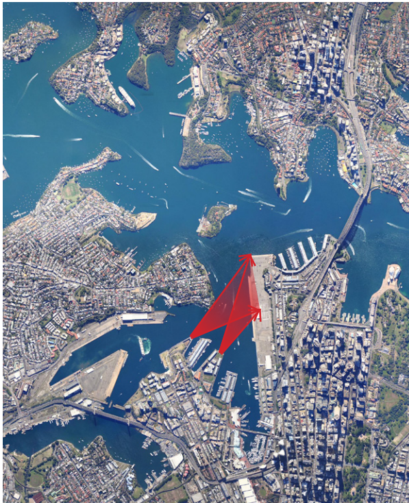
Example views from Pyrmont