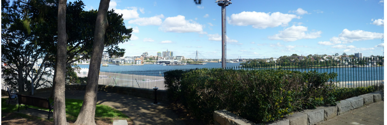
The existing view southwest from the corner of Merriman St and Bettington St.