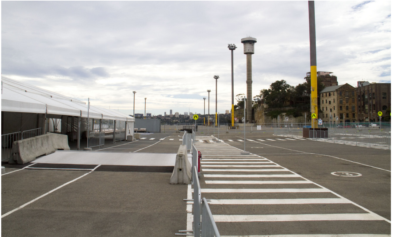
Image showing existing view from Barangaroo Central Foreshore Walk looking north to Headland