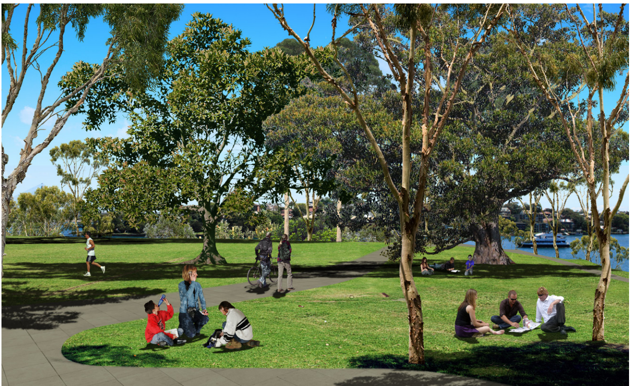
Image showing proposed view from Clyne Reserve looking west across Headland Park