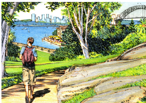
Artists impression of the view to the north from the north-facing slopes of the Headland Park

There will also be framed views to the north from the highest point of the upper bluff and all the way down the gentle north-facing slope. From the rest of the path system around the upper bluff views to the harbour will be filtered through the trees in a similar manner to the views presently obtained from Balls Head.