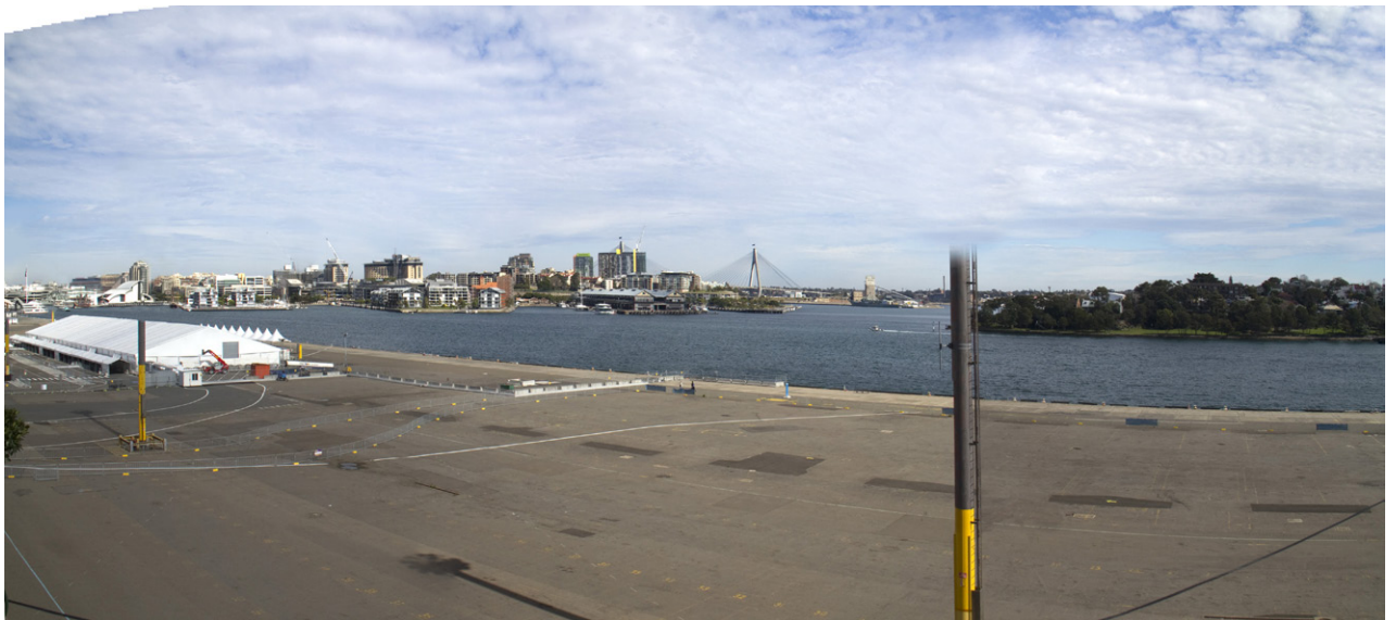
Image showing existing view from Merriman Street to the southwest