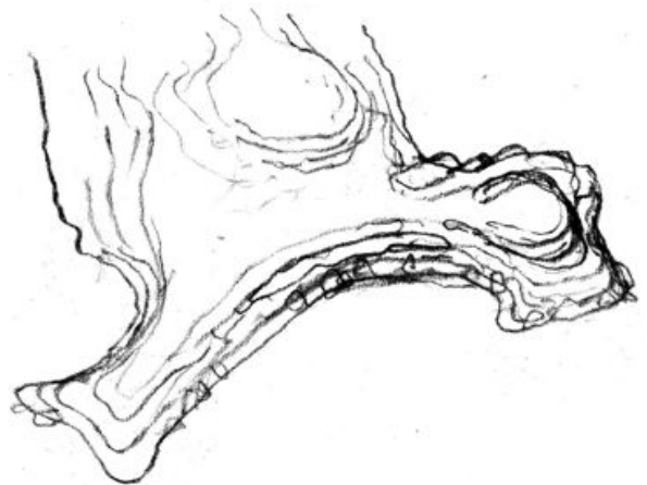
Sketch interpretation of landform prior to European settlement. Plan. Source: Barangaroo Headland and Cove : Nature of Place Draft Report. Cabconsulting December 2009

The illustrations below show a painting of the site in 1821 (the site is to the left of the painting of the windmills) and in 1820 (showing the site from the north) as well as a modern interpretation of the original landform by CAB Consulting.