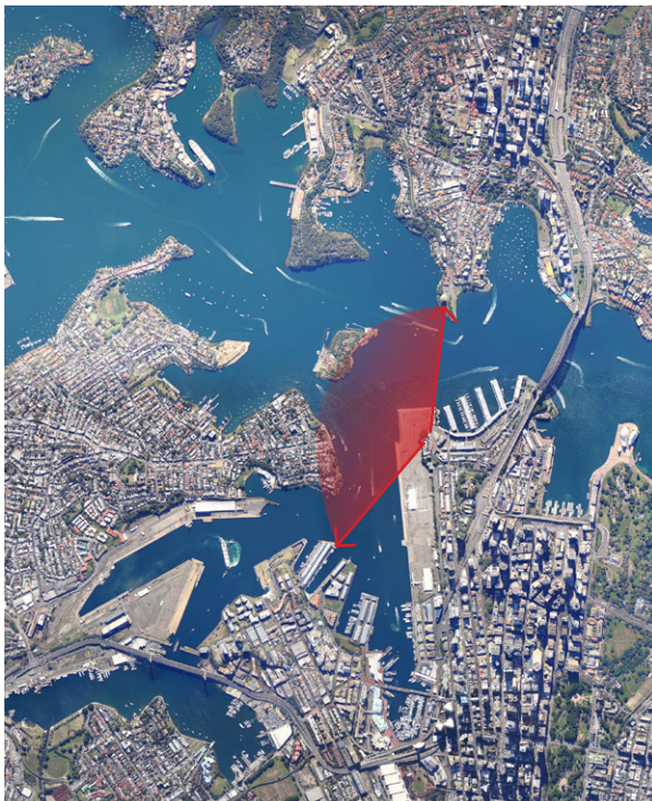
Diagram showing existing indicative view from Millers Point with Harbour context