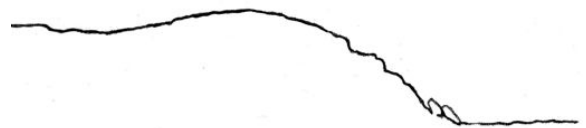
Sketch interpretation of landform prior to European settlement. Section East-West.