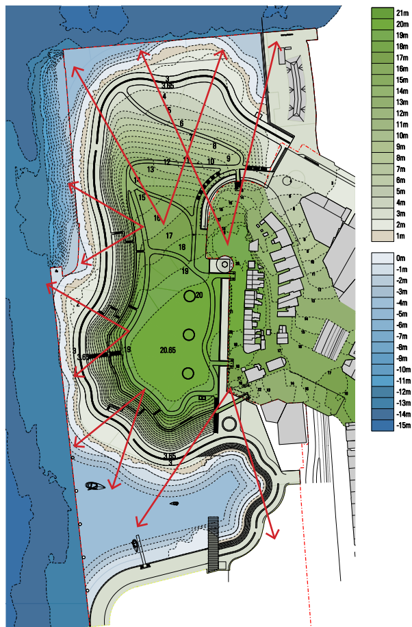
Diagram showing proposed views from the Park

The views from directly north (i.e McMahon's Point and surrounds) will include views of the long grassy slope populated by native shade trees. These views will have some similarity to views of the domain and Lady Macquarie's Chair.