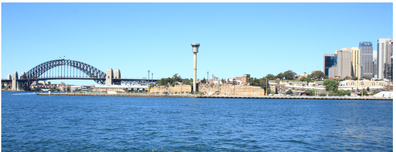
Image showing existing view from Balmain looking east to the Headland Park with the City Centre and Sydney Harbour Bridge behind