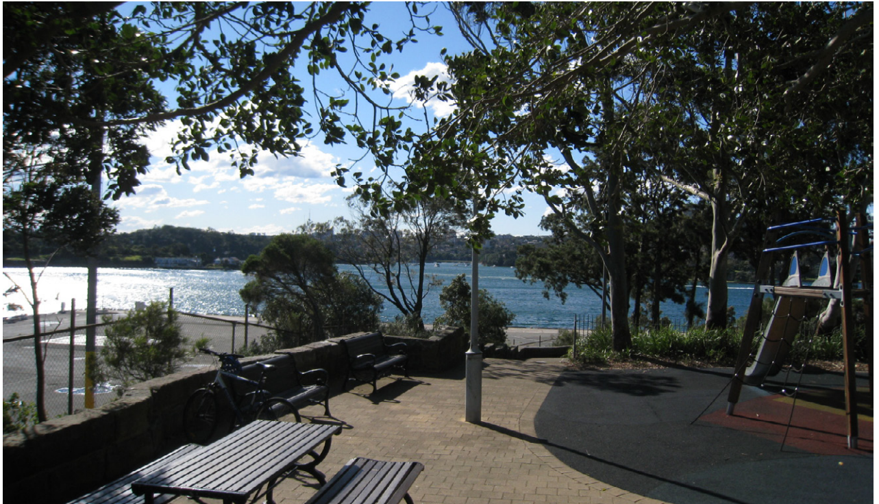
Existing view from Clyne Reserve looking north