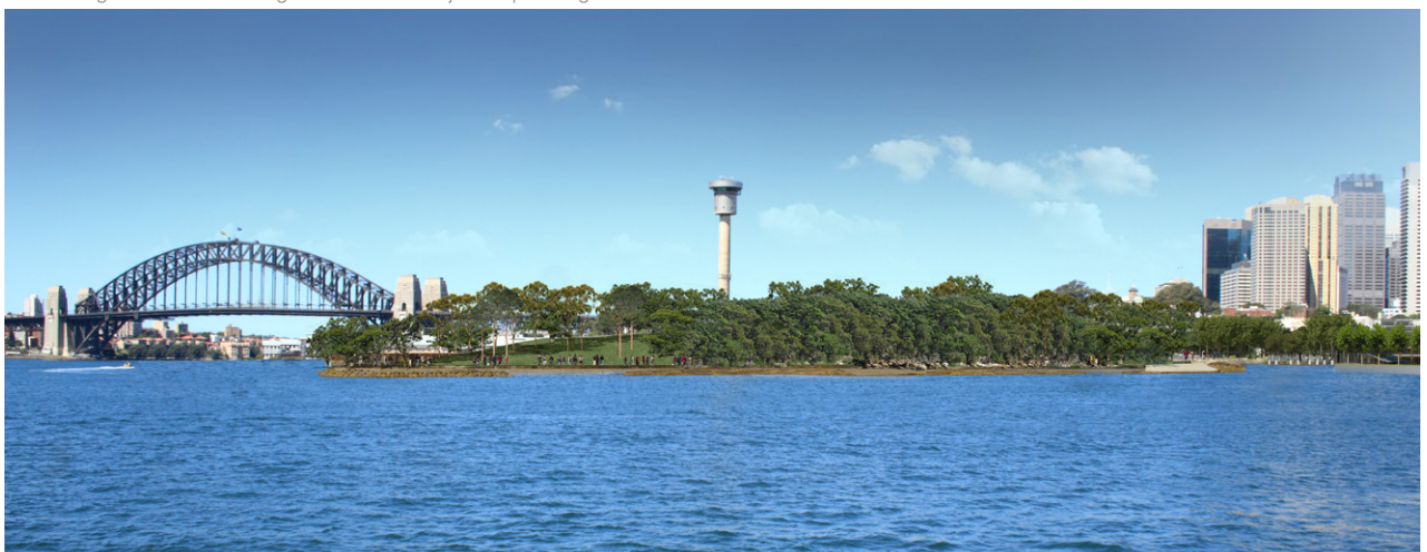
Image showing proposed view from Balmain looking east to the Headland Park with the City Centre and Sydney Harbour Bridge behind Note: Image shown for Barangaroo South is subject to planning determination.