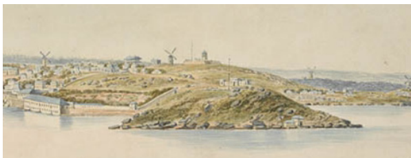
North View of Sydney (Detail). Joseph Lycett. 1820. The gentle slope on the north of the Barangaroo headland is evident.