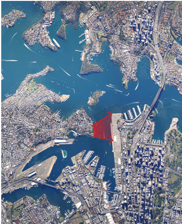
View from Balmain East