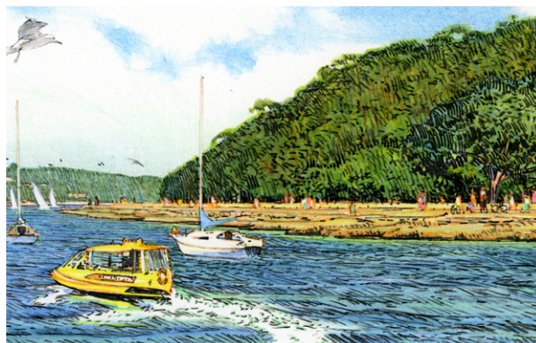
Artists impression of the view of the Headland Park, with vegetated slopes and rock pools

The views from directly north (i.e McMahon's Point and surrounds) will include views of the long grassy slope populated by native shade trees. These views will have some similarity to views of the domain and Lady Macquarie's Chair.