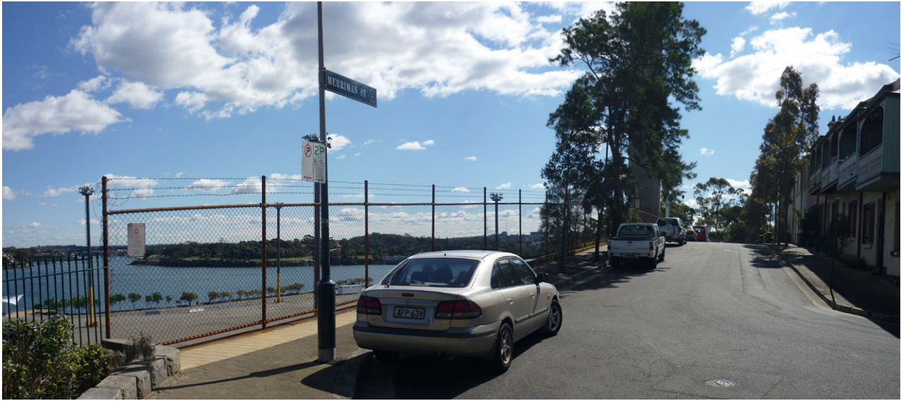
Existing view from the southern end of Merriman St looking northwest