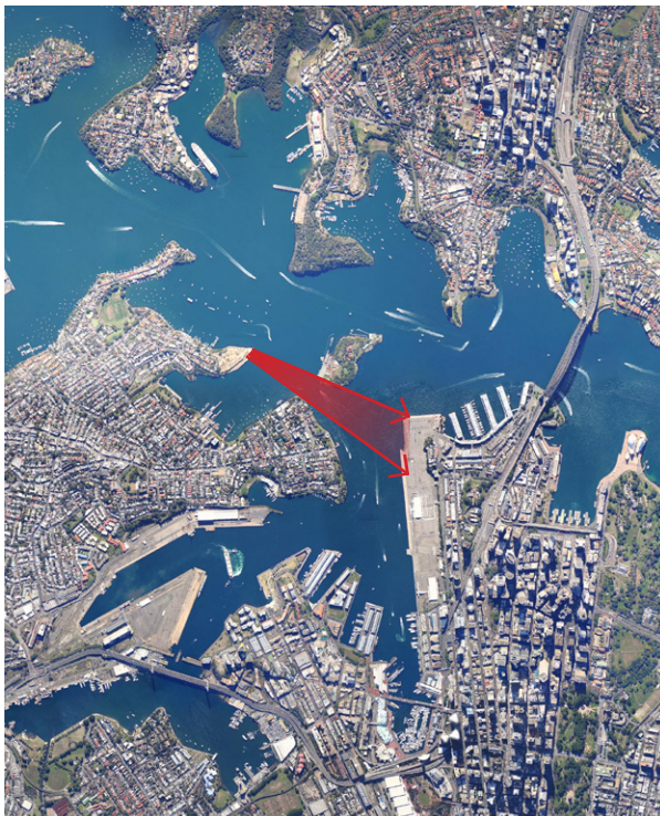
Approximate viewshed from Ballast Point Park