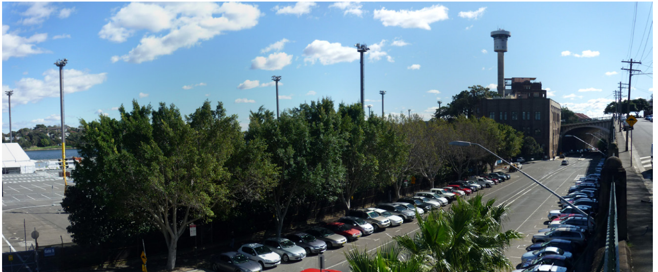
The existing view from High Street