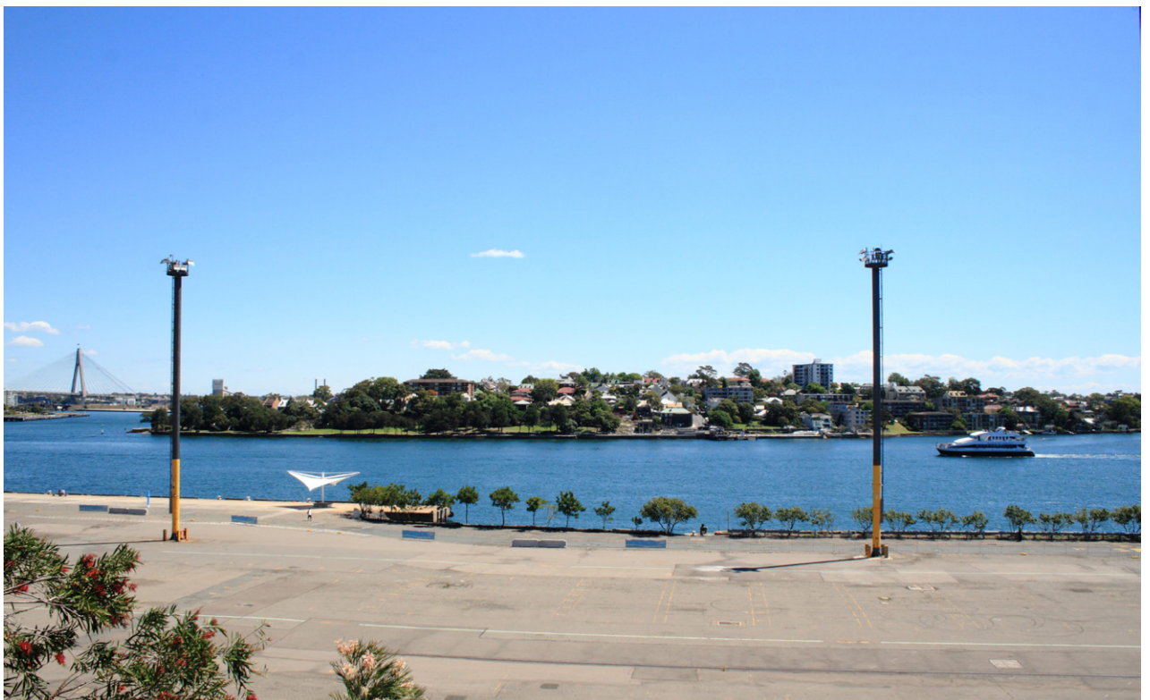
Image showing existing view from Clyne Reserve looking west across Headland Park