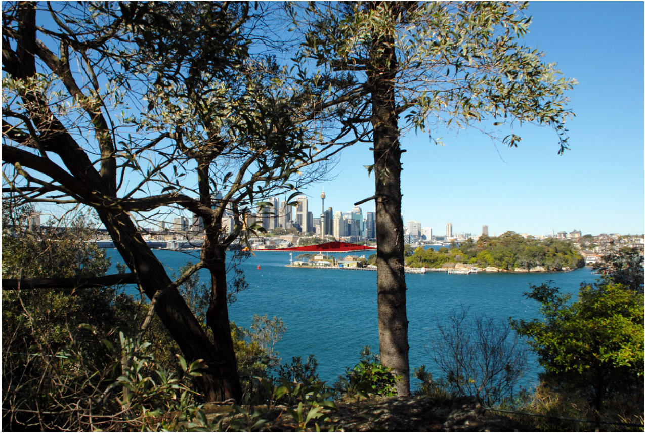
View from Balls Head with an approximation of the proposed landform in red