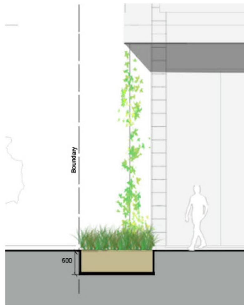
Setdown in the basement level provide soil volume for climbing plants

The southern extent of the Missenden Road frontage features a soft setback featuring a combination of groundcovers and climbers on a special wire trellis tensioned from the soffit of the building above. A setdown in the basement level will provide sufficient soil volume for plant growth. Minor retaining walls will be located immediately within the property boundary to maintain consistent footpath crossfalls.