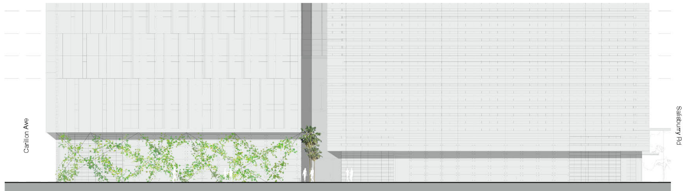
Eastern Elevation 1:400@A3