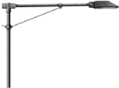
Bega outrigger luminaire