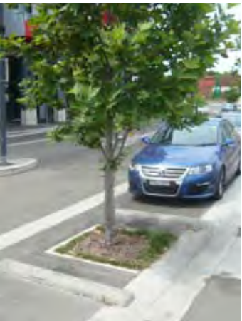
Existing Tree Pit Condition