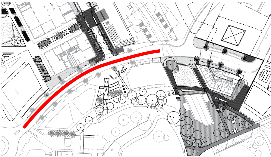
Key Plan - Brodie Spark Drive Stage 1