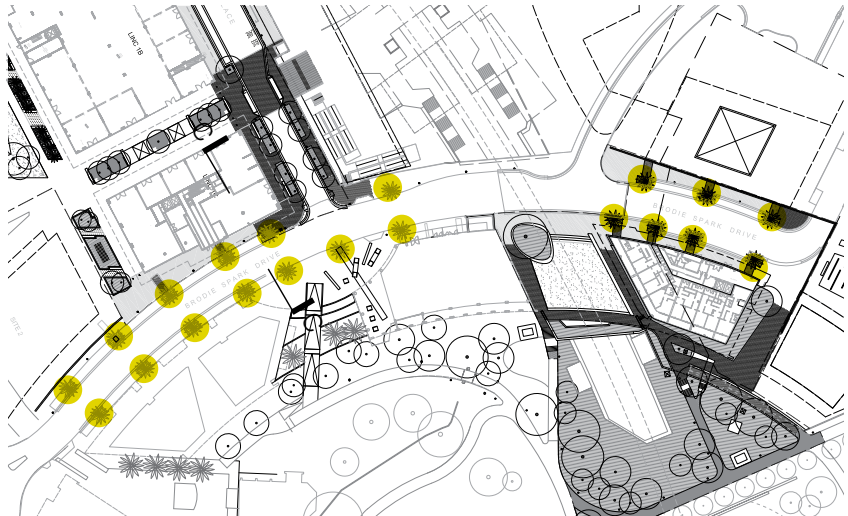
Key plan - Brodie Spark Drive