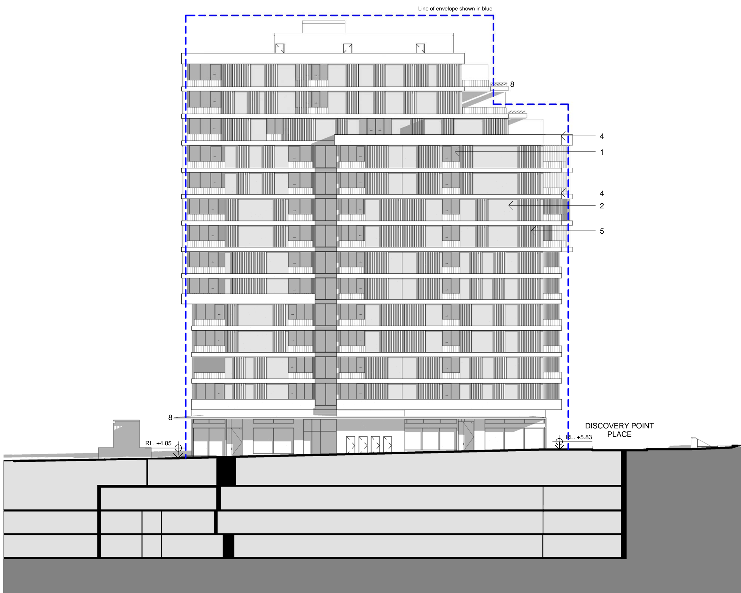
1 Section E - Building 1C East Elevation 1 : 250