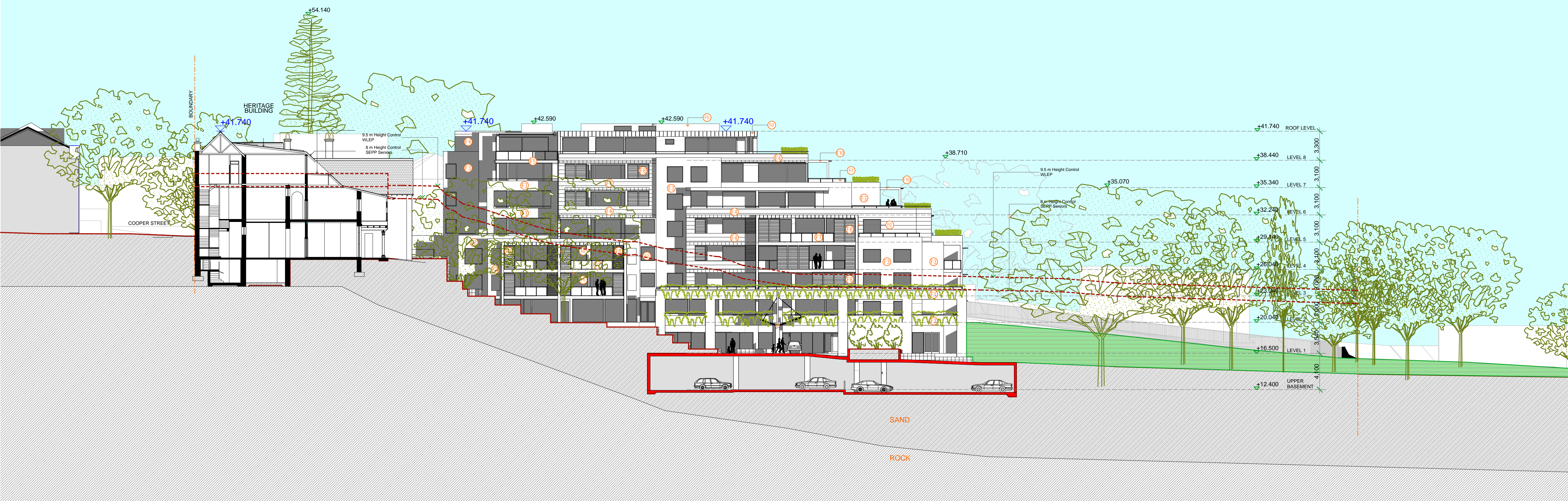
B Longitudinal Section 2- Looking West