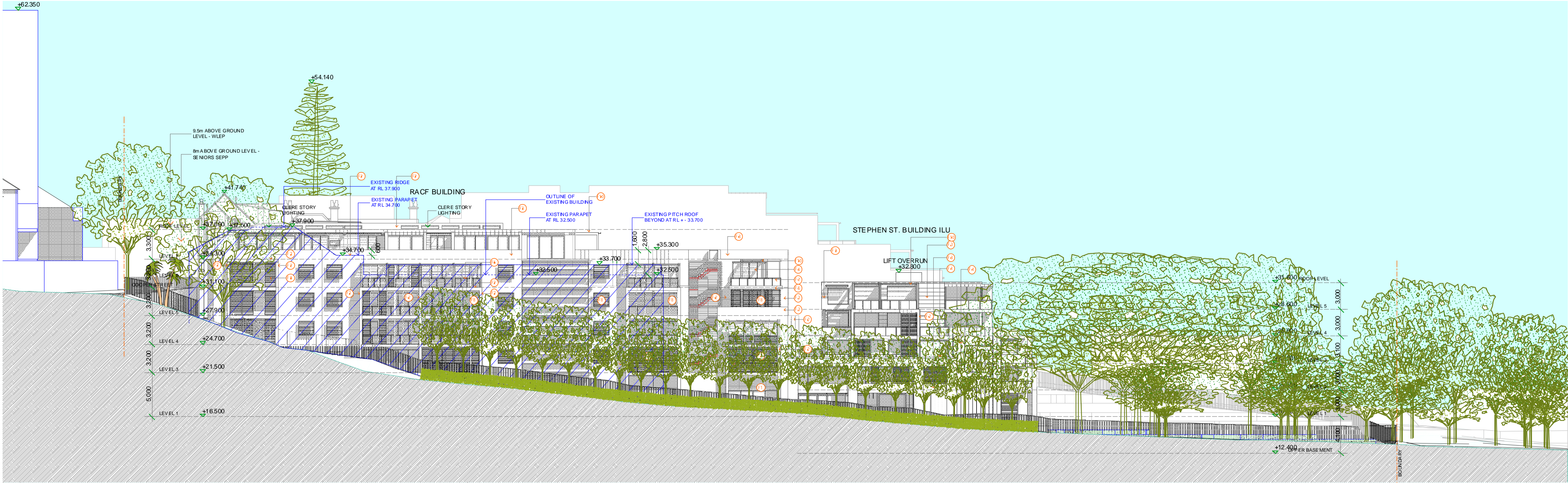
1 East Elevation- Stephen Street (With Trees) TECHNICAL ELEVATION