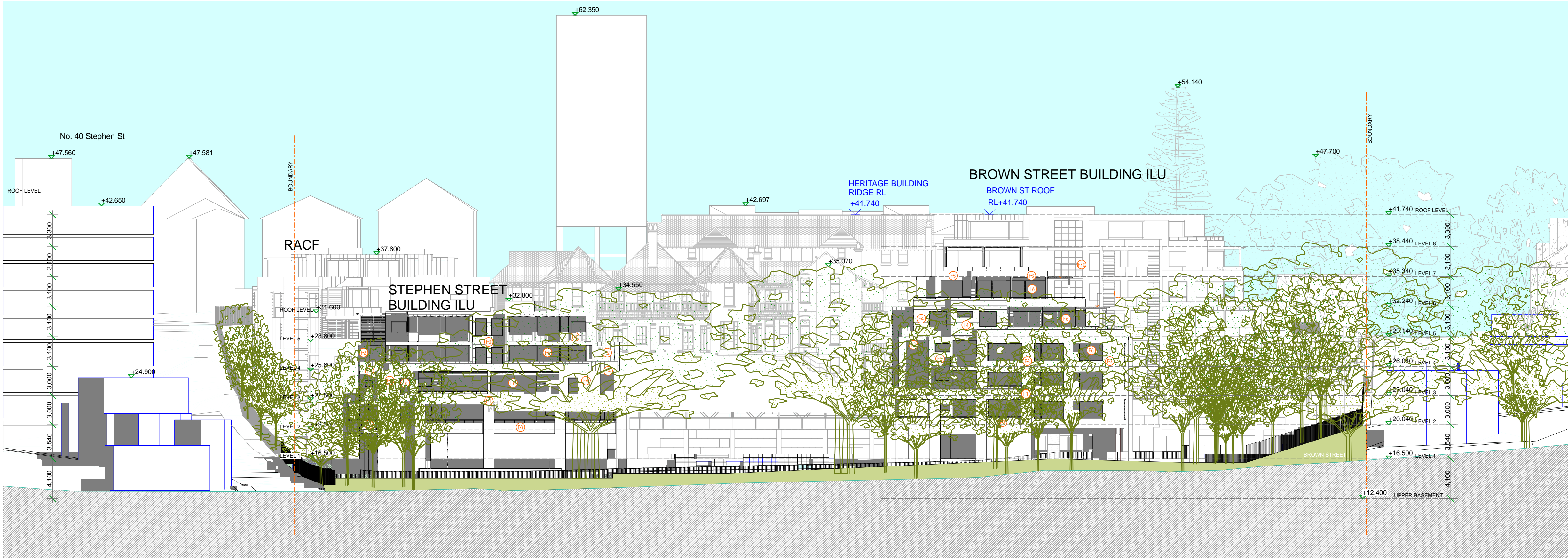
1 North Elevation- Dillon Reserve (With Trees) TECHNICAL ELEVATION