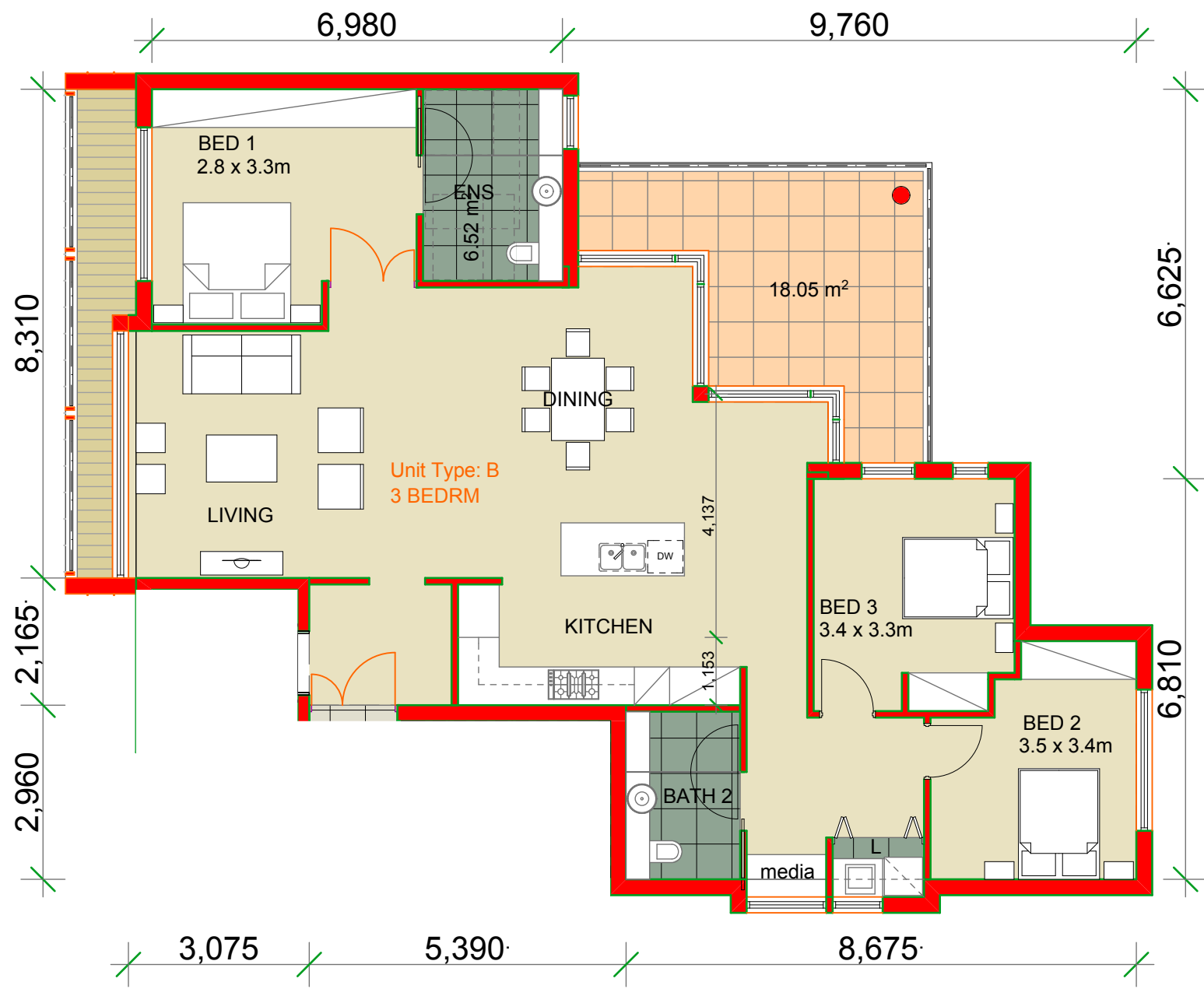
GATE KEEPERS LODGE - UNIT TYPE B

Copyright JPR Architects Pty Ltd. Reproduction of the whole or part of this document constitutes an infringement of copyright. The information, ideas and concepts contained in this document are confidential and the recipient of this document is prohibited from disclosing such information, ideas and concepts to any person without the prior written consent of JPR Architects Pty Ltd.