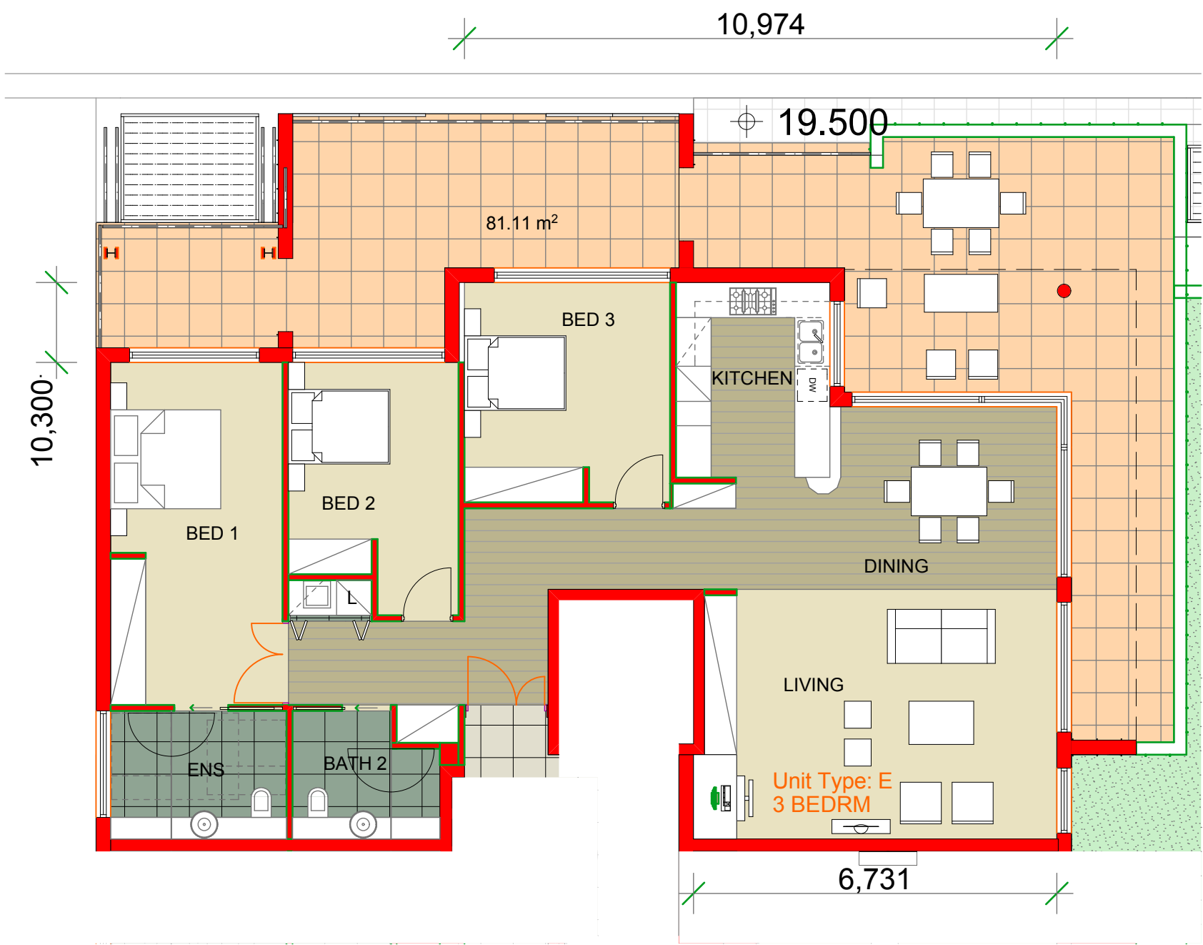
STEPHEN STREET - UNIT TYPE E

*Copyright JPR Architects Pty Ltd. Reproduction of the whole or part of this documents constitutes an infringement of copyright. The information, ideas and concepts contained in this document are confidential and the recipient of this document is prohibited from disclosing such information, ideas and concepts to any person without the prior written consent of JPR Architects Pty Ltd.*