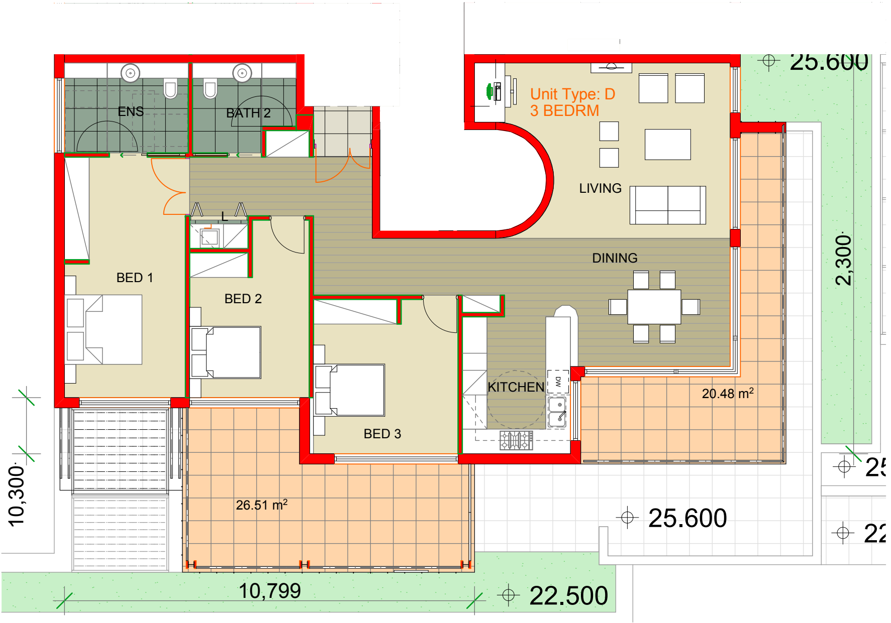
STEPHEN STREET - UNIT TYPE D

*Copyright JPR Architects Pty Ltd. Reproduction of the whole or part of this document constitutes an infringement of copyright. The information, ideas and concepts contained in this document are confidential and the recipient of this document is prohibited from disclosing such information, ideas and concepts to any person without the prior written consent of JPR Architects Pty Ltd.*