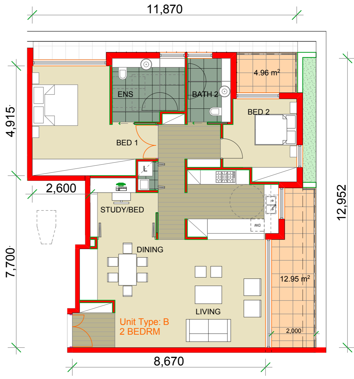
STEPHEN STREET - UNIT TYPE B

*Copyright JPR Architects Pty Ltd. Reproduction of the whole or part of this document constitutes an infringement of copyright. The information, ideas and concepts contained in this document are confidential and the recipient of this document is prohibited from disclosing such information, ideas and concepts to any person without the prior written consent of JPR Architects Pty Ltd.*