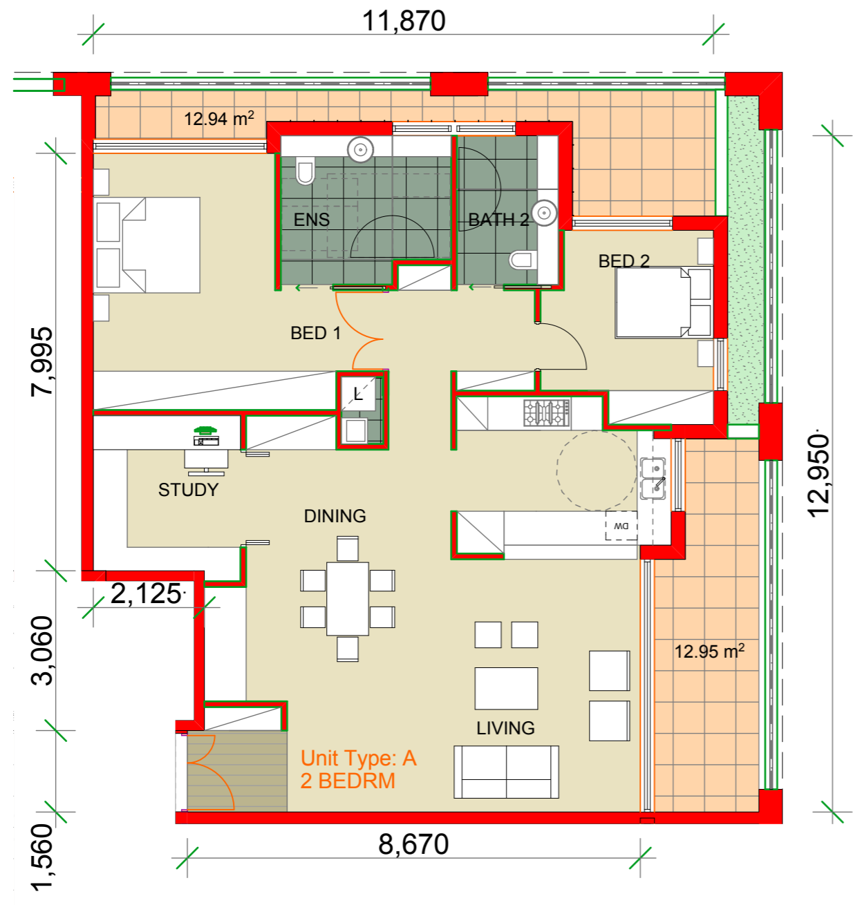
STEPHEN STREET - UNIT TYPE A