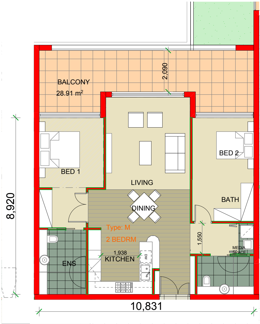
BROWN STREET - UNIT TYPE M