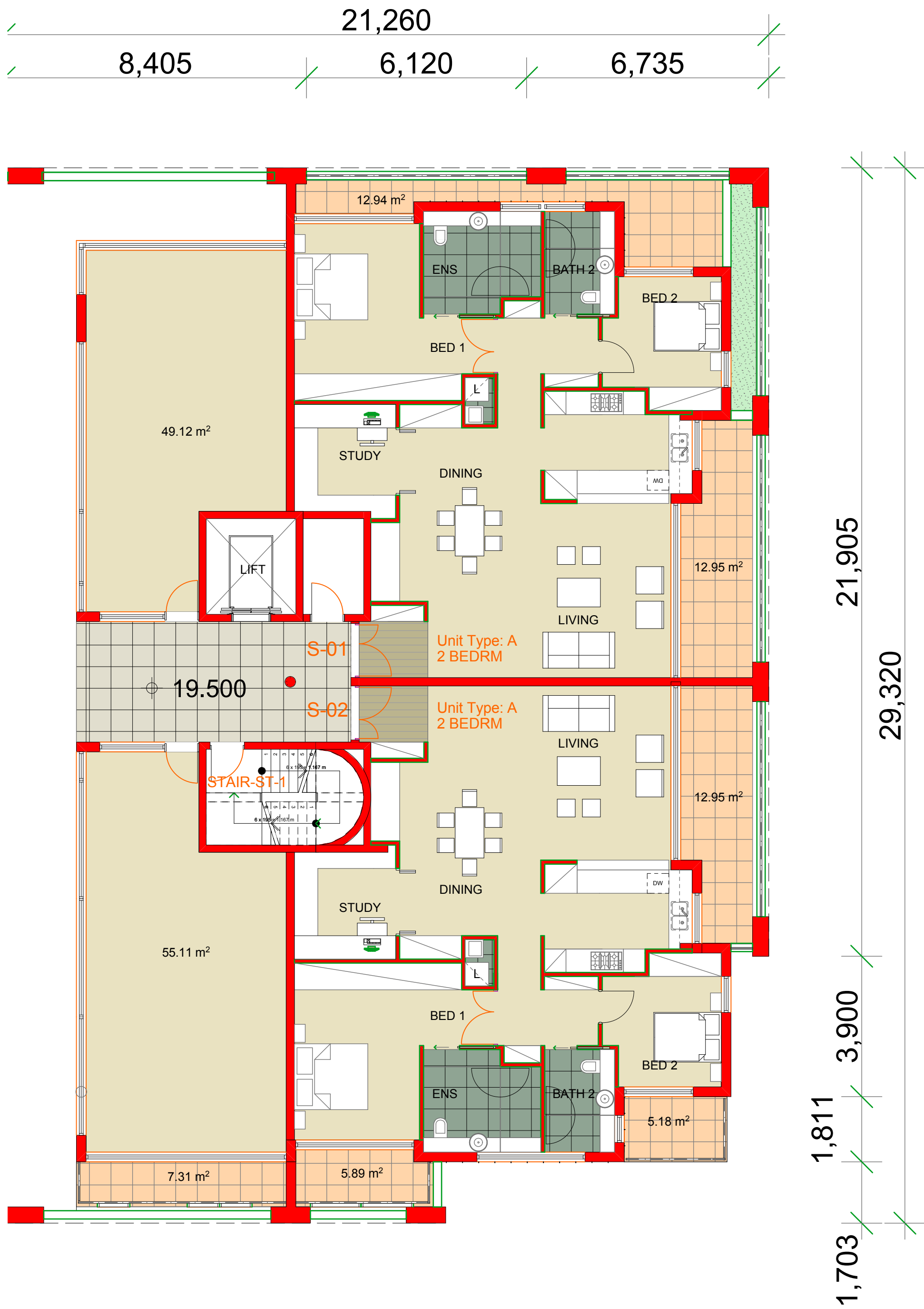
STEPHEN STREET ILU - LEVEL 2

"Copyright JPR Architects Pty Ltd. Reproduction of the whole or part of this documents constitutes an infringement of copyright. The information, ideas and concepts contained in this document are confidential and the recipient of this document is prohibited from disclosing such information, ideas and concepts to any person without the prior written consent of JPR Architects Pty Ltd."