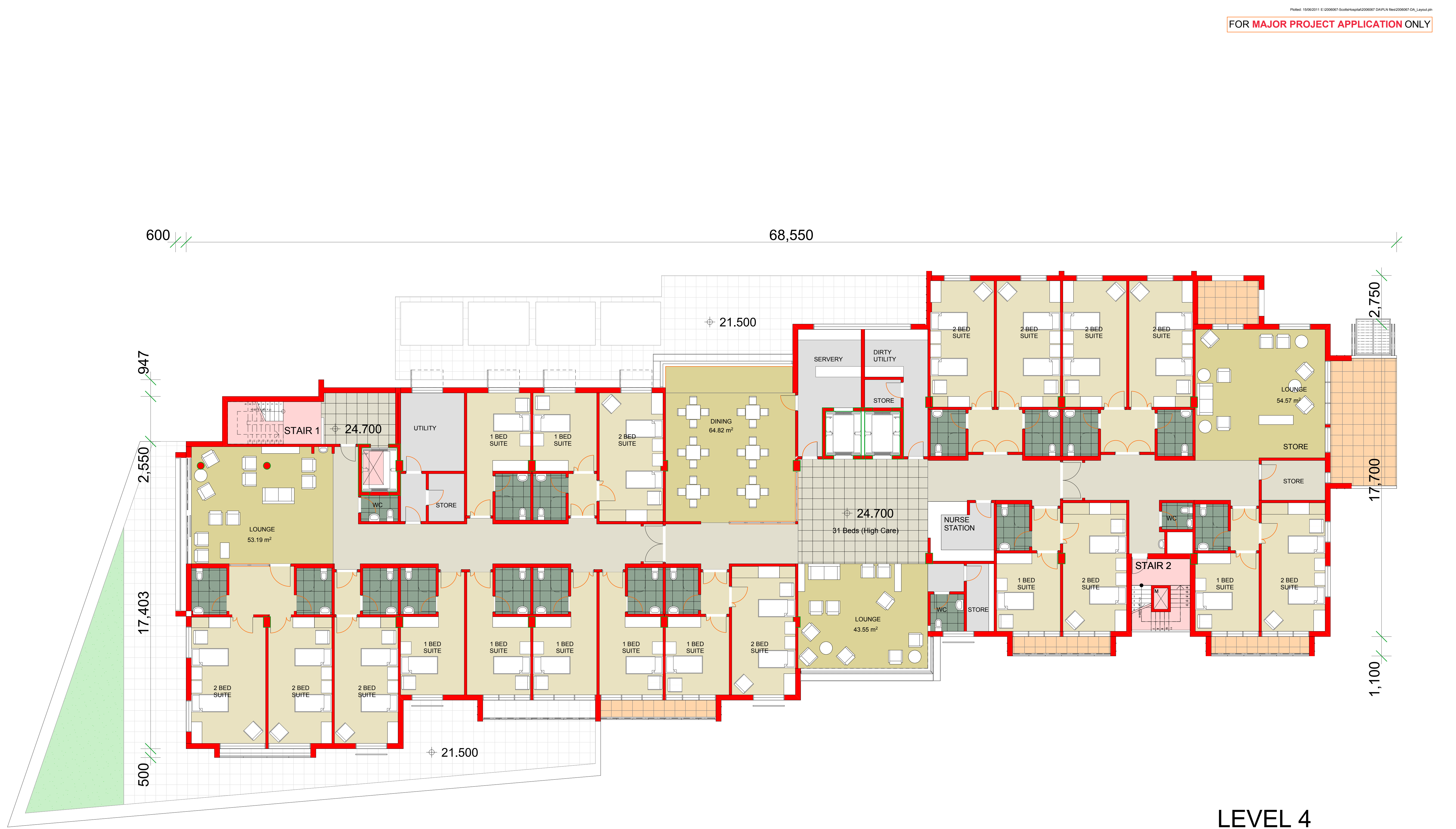
RACF Building - Level 4

"Copyright JPR Architects Pty Ltd. Reproduction of the whole or part of this documents constitutes an infringement of copyright. The information, ideas and concepts contained in this document are confidential and the recipient of this document is prohibited from disclosing such information, ideas and concepts to any person without the prior written consent of JPR Architects Pty Ltd."