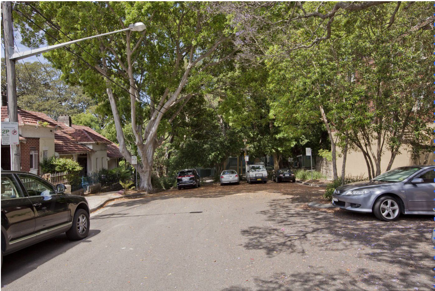
Proposed View 10 - Glenview St & Brown St