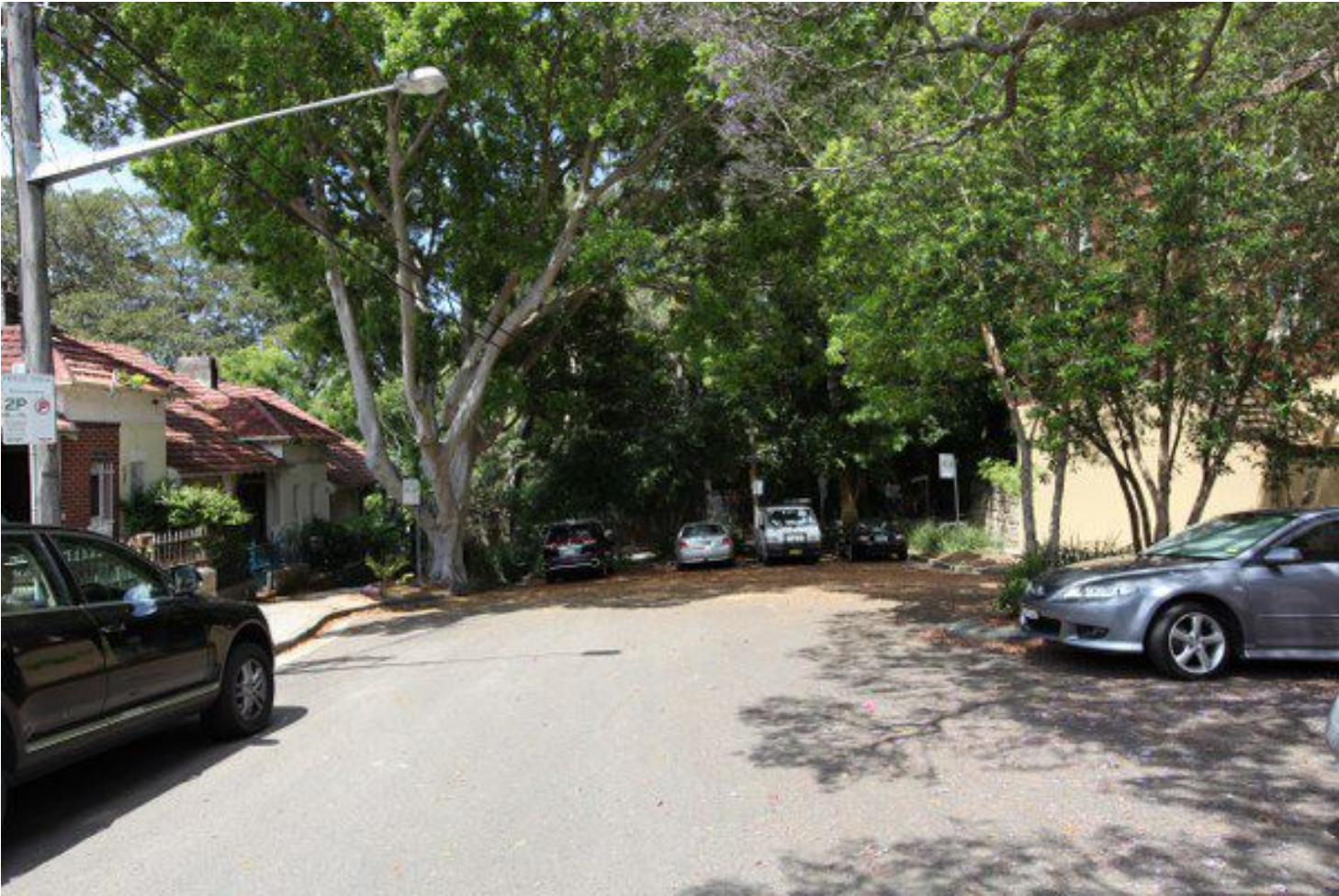
Existing View 10 - Glenview St & Brown St