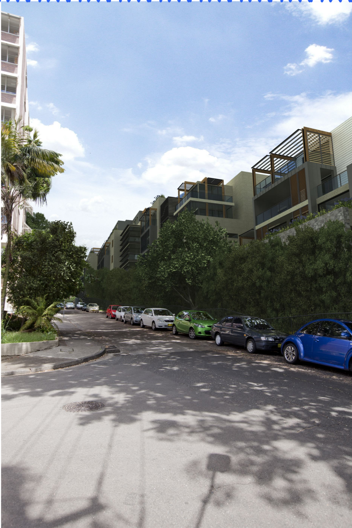
Proposed View 6 - Glenn St & Stephen St