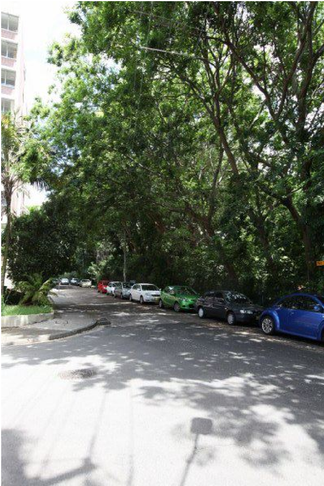
Existing View 6 - Glenn St & Stephen St