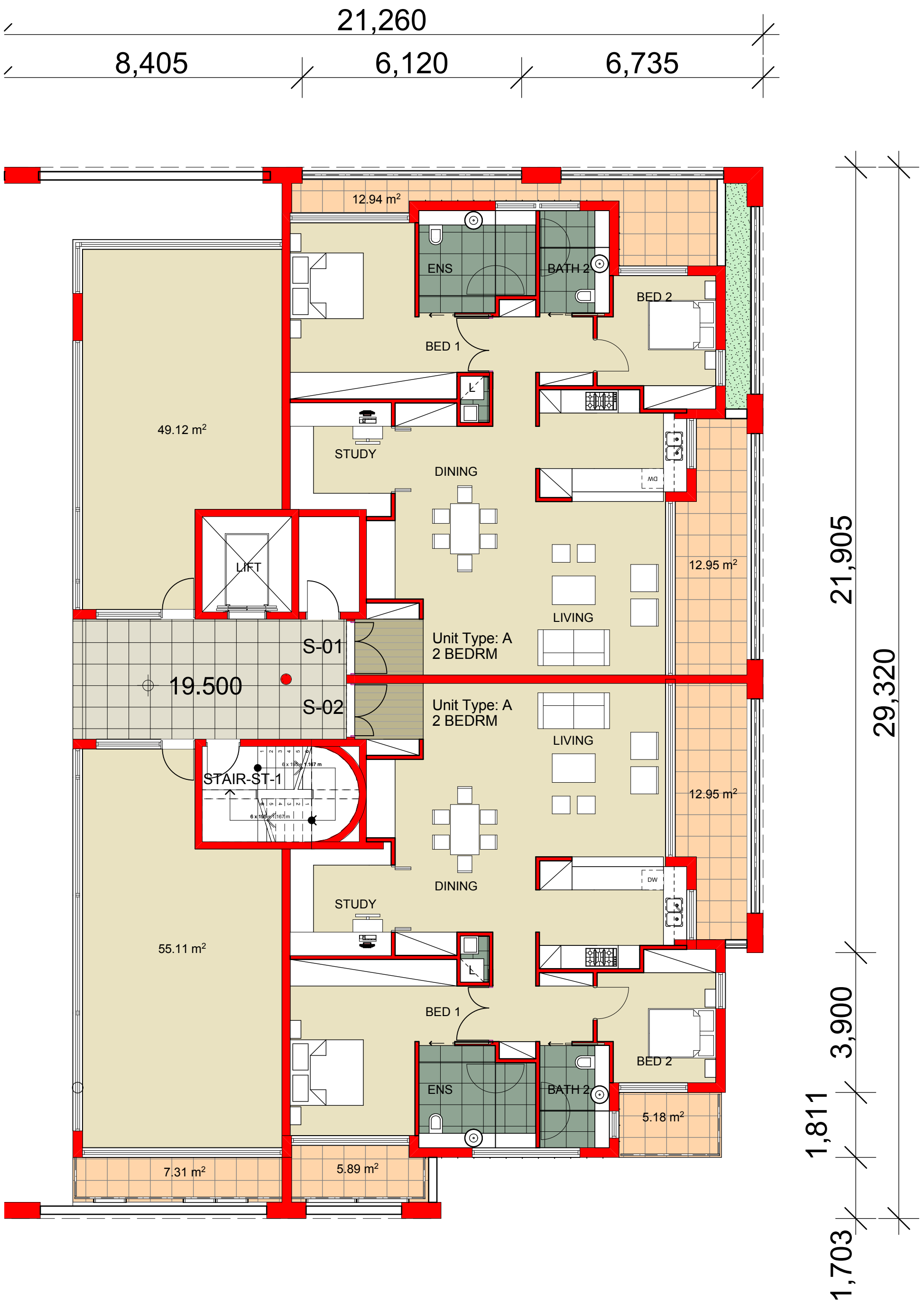
STEPHEN STREET ILU - LEVEL 2

"Copyright JPR Architects Pty Ltd. Reproduction of the whole or part of this documents constitutes an infringement of copyright. The information, ideas and concepts contained in this document are confidential and the recipient of this document is prohibited from disclosing such information, ideas and concepts to any person without the prior written consent of JPR Architects Pty Ltd."