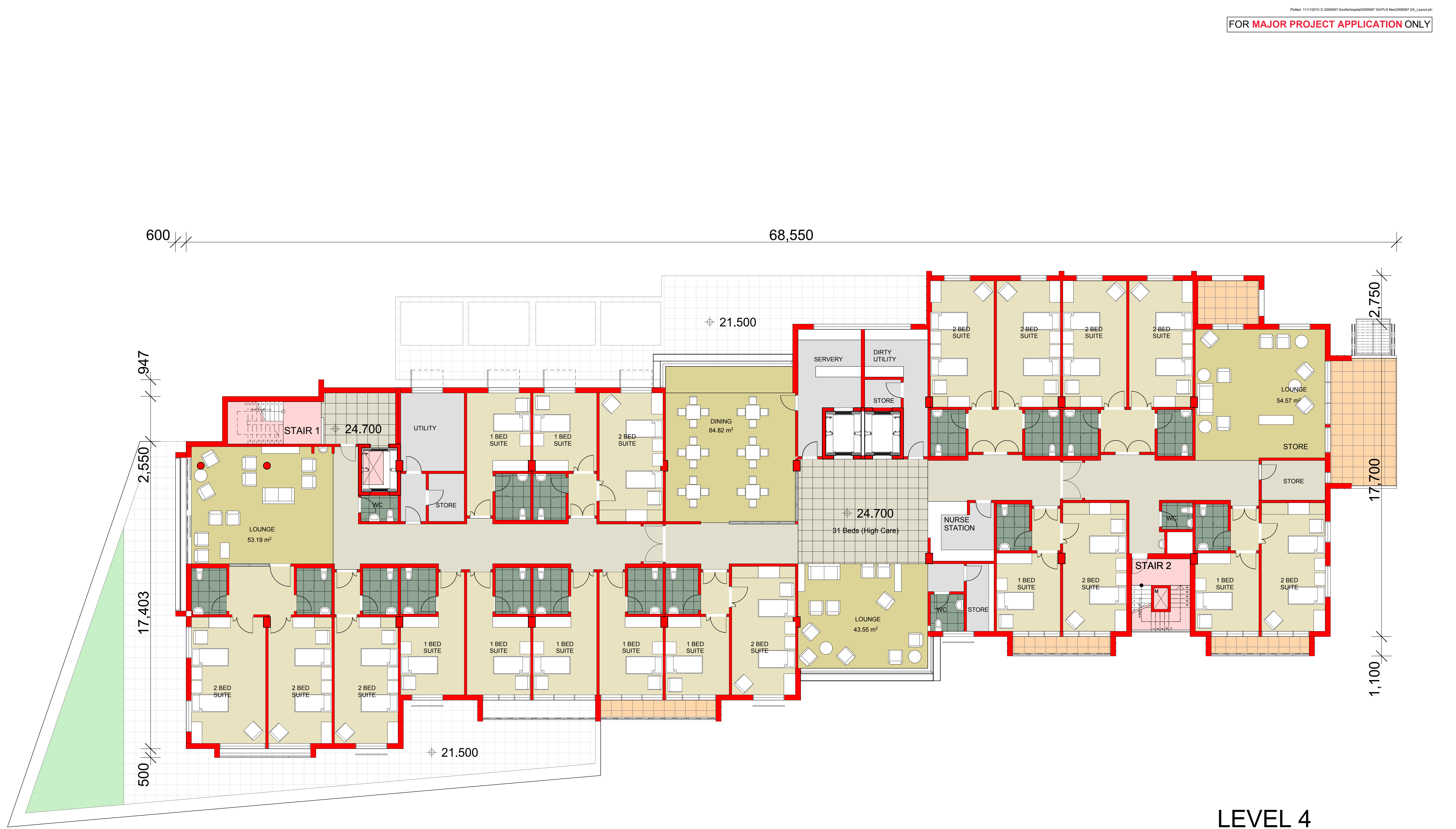
RACF Building - Level 4

"Copyright JPR Architects Pty Ltd. Reproduction of the whole or part of this documents constitutes an infringement of copyright. The information, ideas and concepts contained in this document are confidential and the recipient of this document is prohibited from disclosing such information, ideas and concepts to any person without the prior written consent of JPR Architects Pty Ltd."