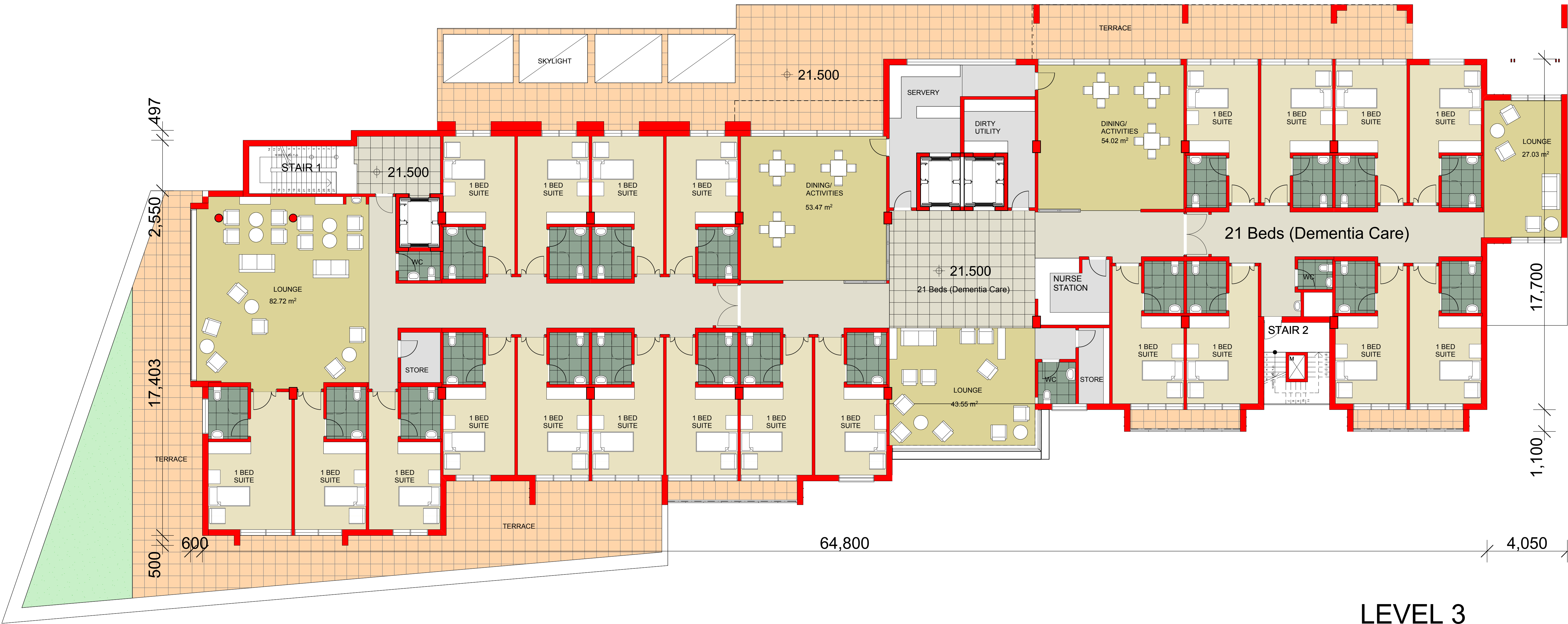
RACF Building - Level 3

"Copyright JPR Architects Pty Ltd. Reproduction of the whole or part of this documents constitutes an infringement of copyright. The information, ideas and concepts contained in this document are confidential and the recipient of this document is prohibited from disclosing such information, ideas and concepts to any person without the prior written consent of JPR Architects Pty Ltd."