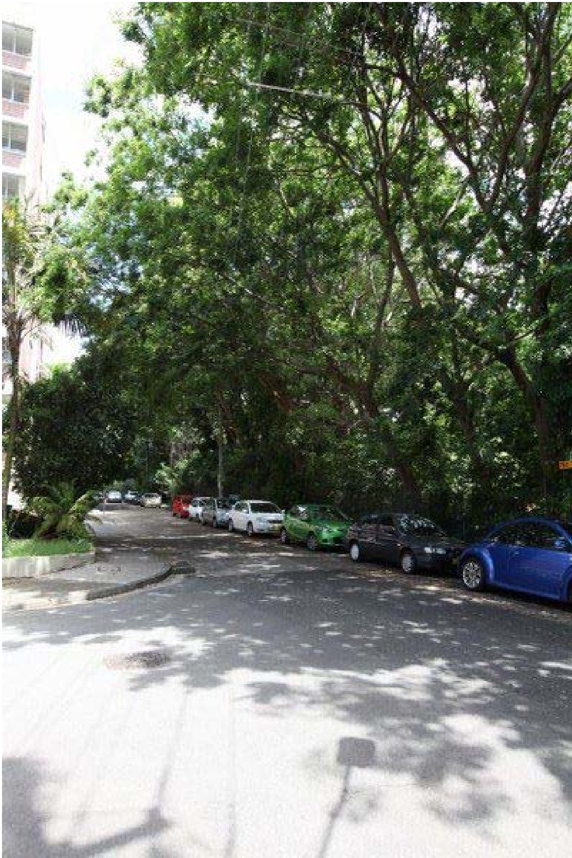
Existing View 6 - Glenn St & Stephen St