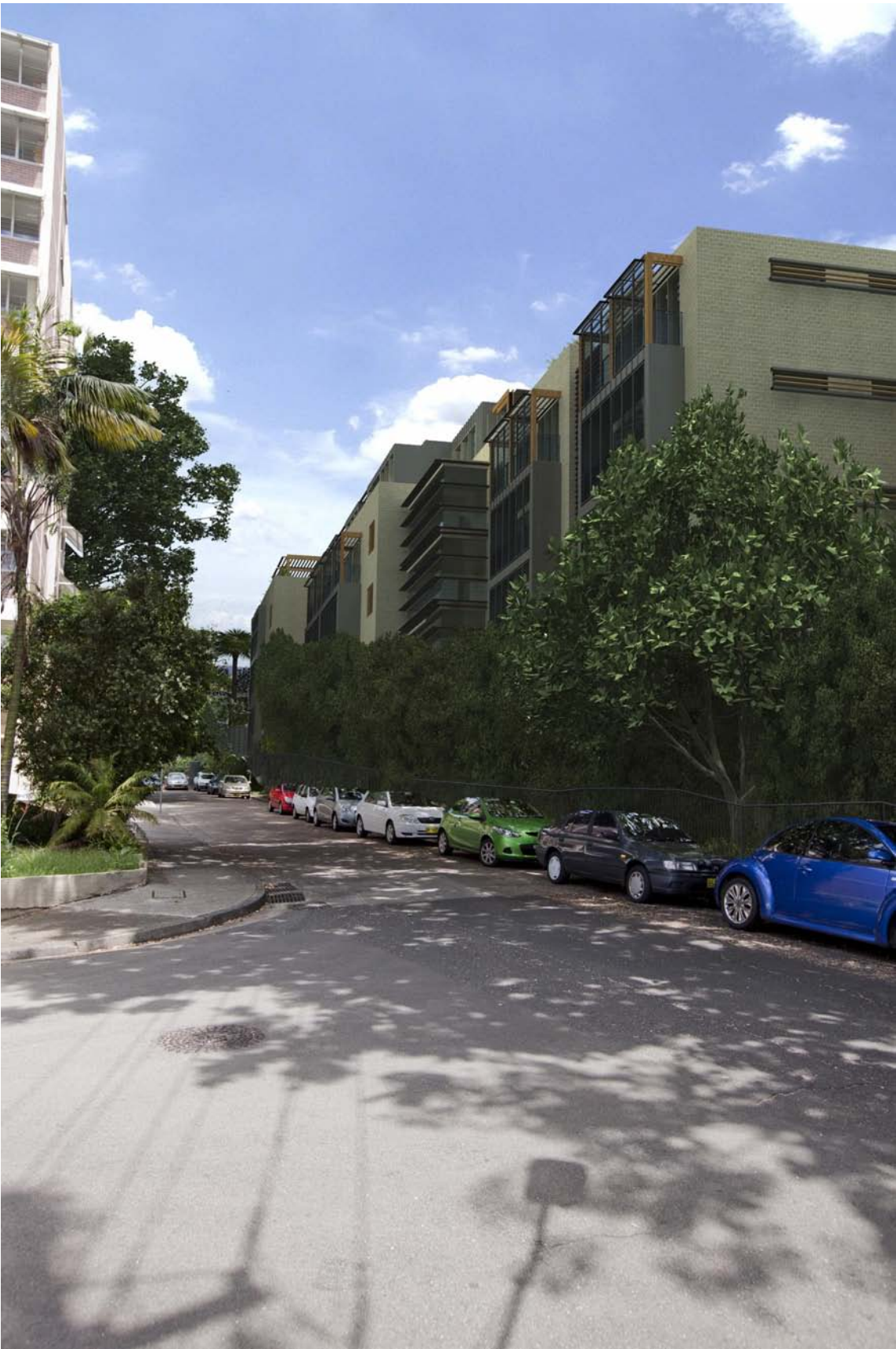
Proposed View 6 - Glenn St & Stephen St