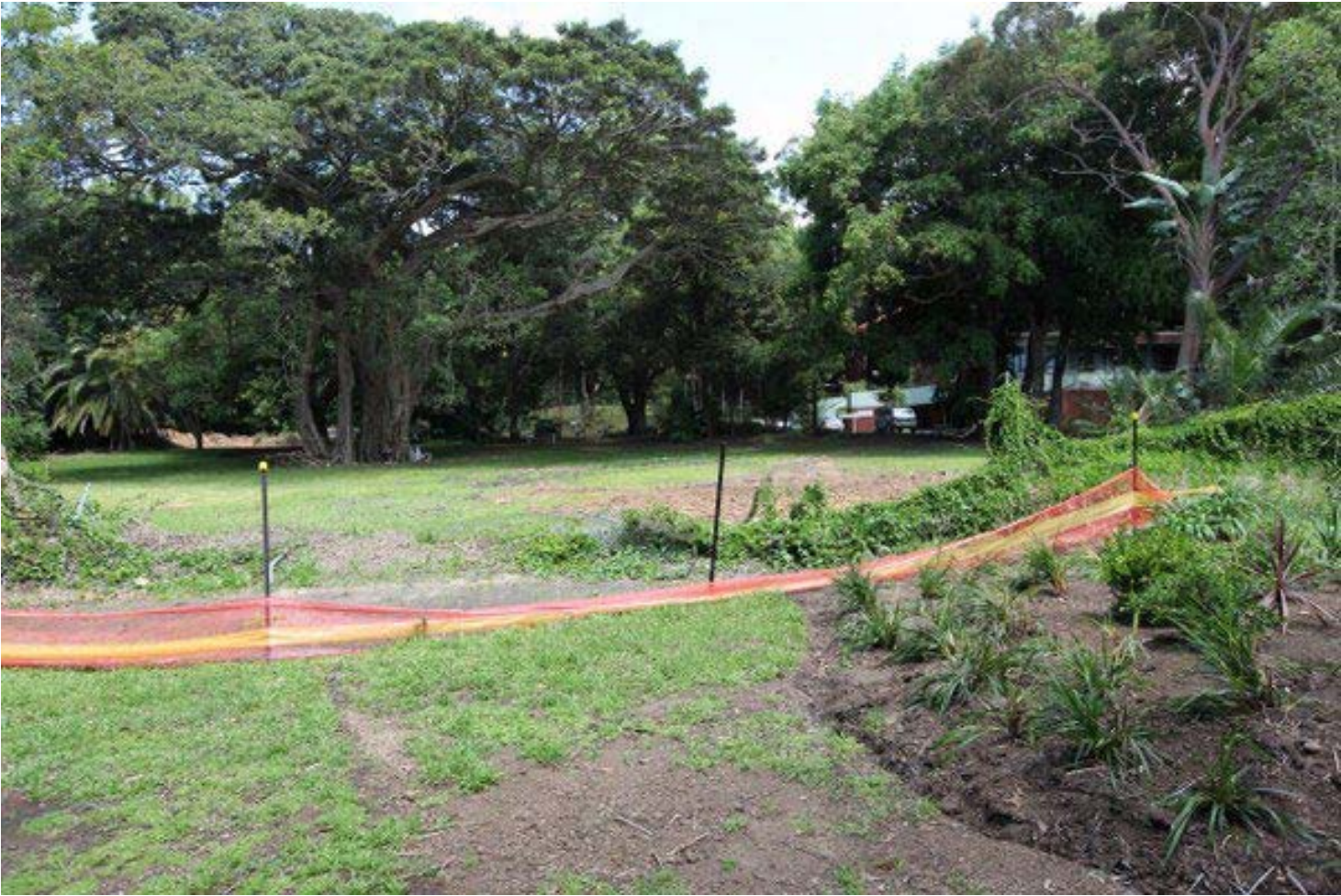
Existing View 8 - Dillon Reserve