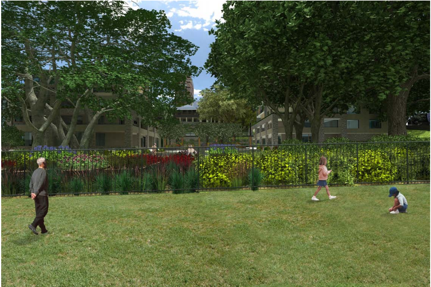
Proposed View 8 - Dillon Reserve